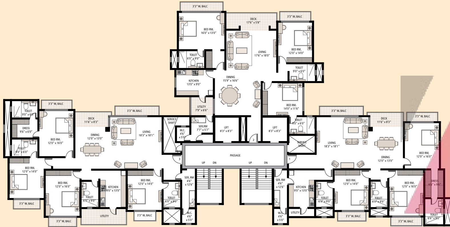
4 BHK + S - 3000 sq. feet 4 Bedroom, 4 Bathroom, Living & Dining, Utility Area and S. Room