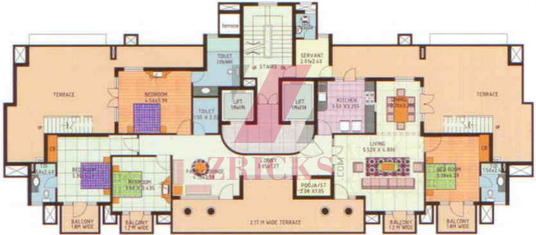
PENT HOUSE TYPE -III SUPER AREA = 5324 sqft