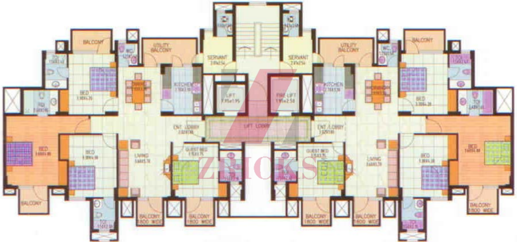
FOUR BED TYPICAL FLOOR PLAN