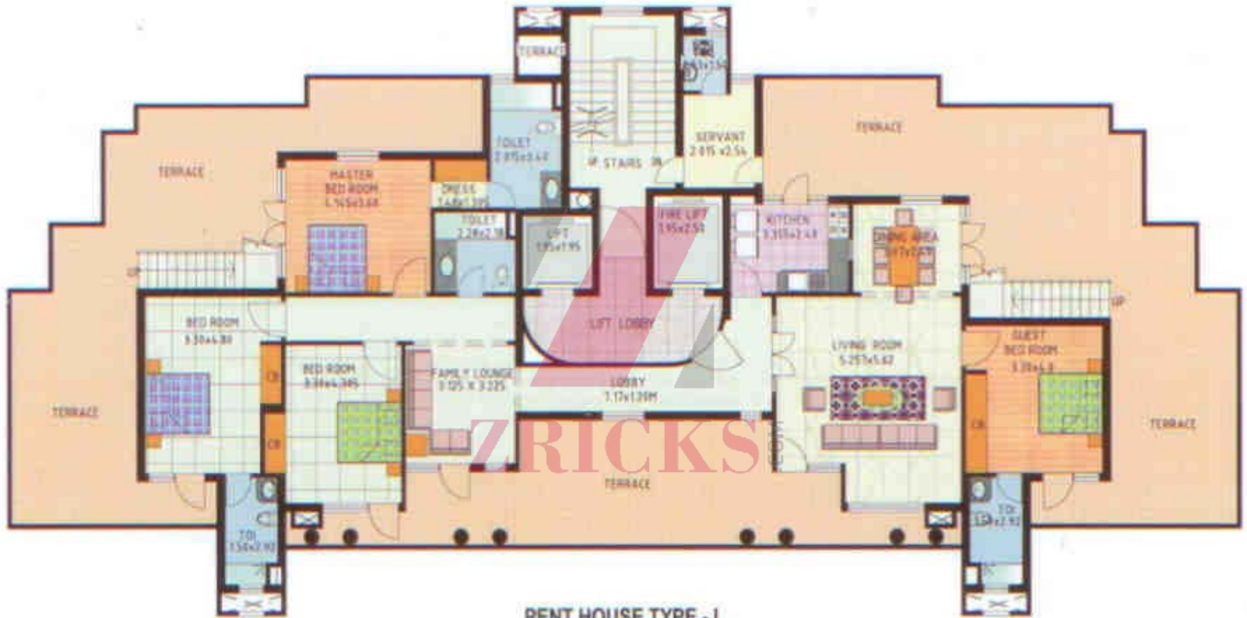
PENT HOUSE TYPE - I