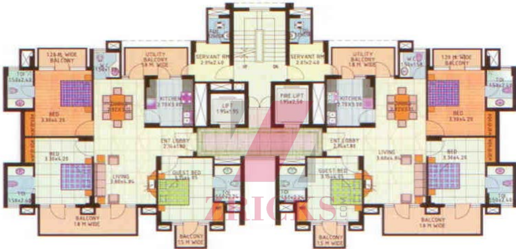
THREE BED ROOM TYPICAL FLOOR PLAN