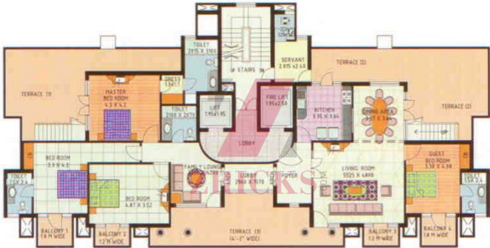
PENT HOUSE TYPE -II SUPER AREA = 4683 sqft