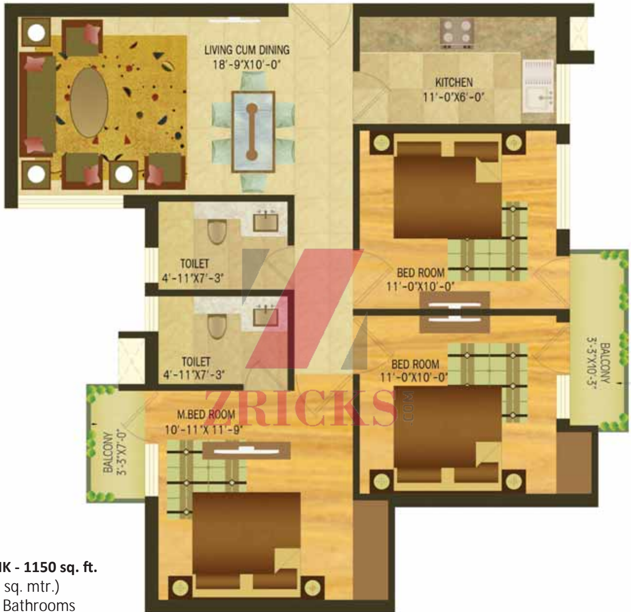
3 BHK - 1150 sq. ft. (107 sq. mtr.) Two Bathrooms