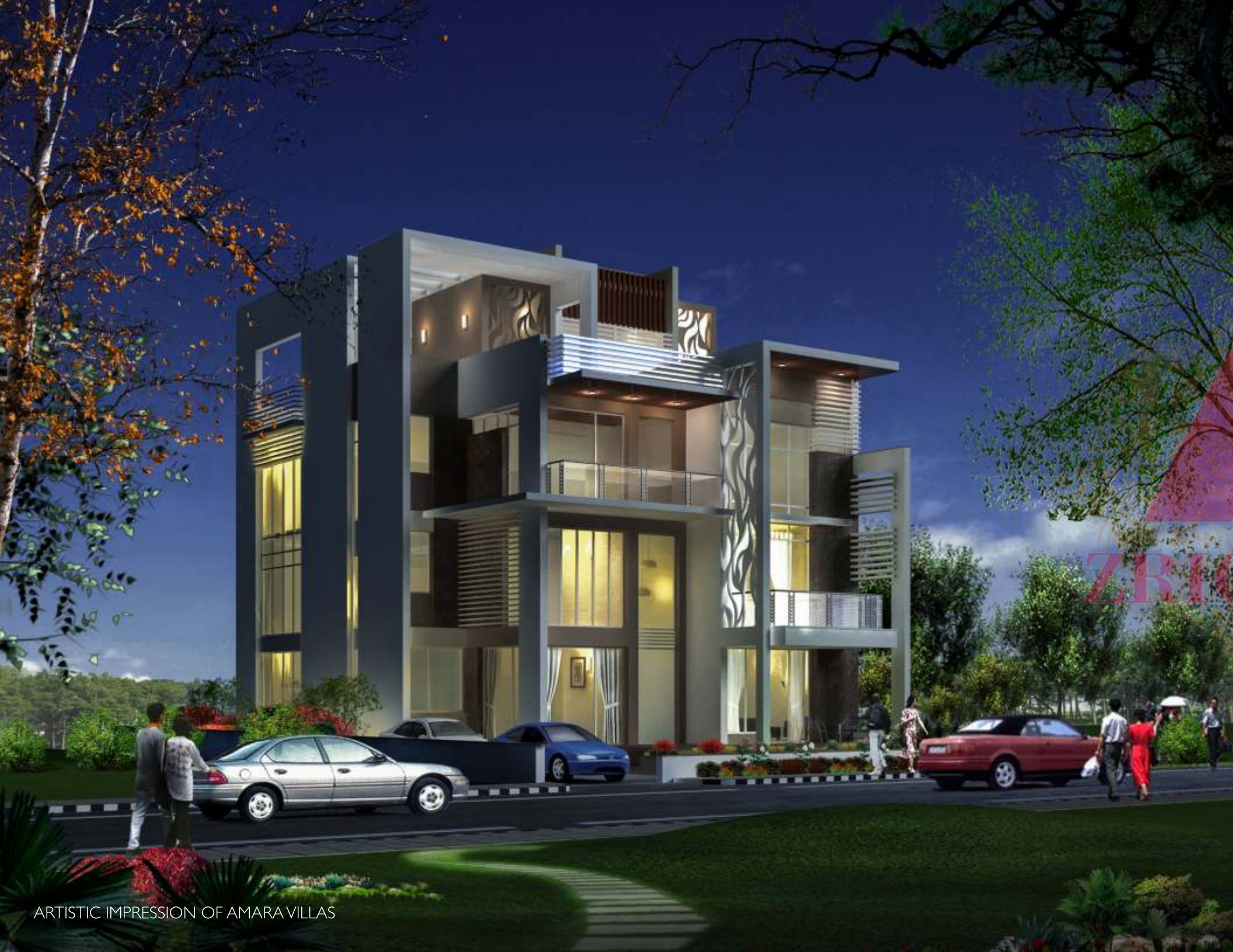
ARTISTIC IMPRESSION OF AMARA VILLAS