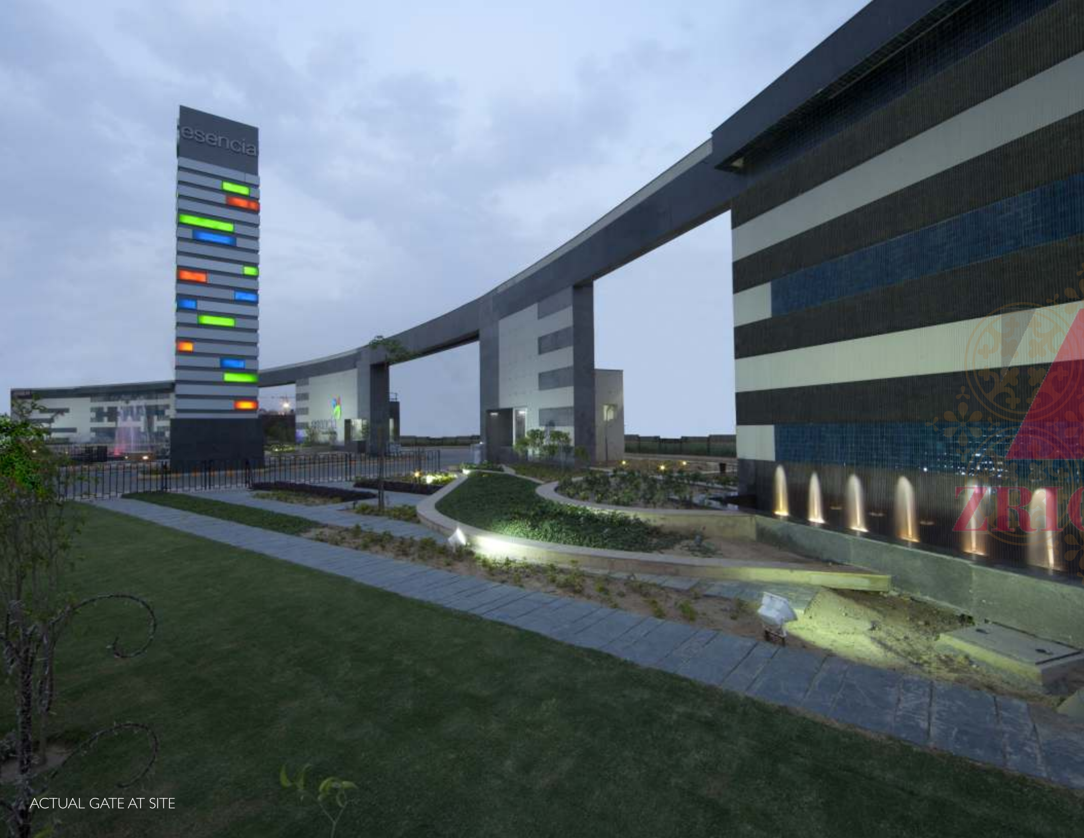
ACTUAL GATE AT SITE