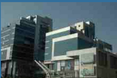
Krishna Apra Business Square, Pitampura