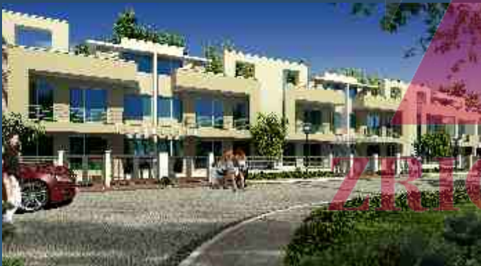
Arcity "Regency Park Villas" (Hisar)