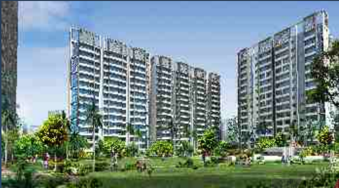
Arcity "Regency Park" (G.Noida, West)