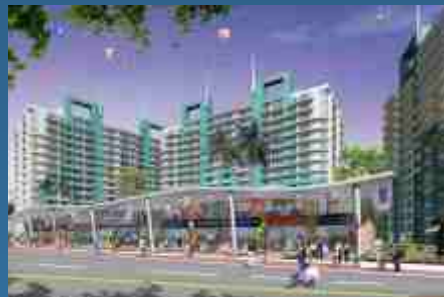
Krishna Apra Sapphire Indirapuram, Ghaziabad