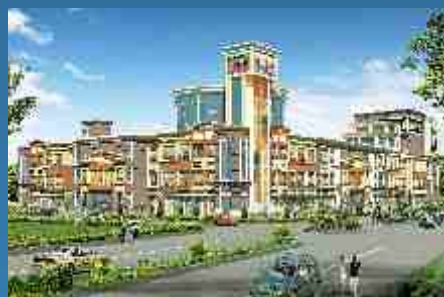
Krishna Apra D Mall Indirapuram, Ghaziabad