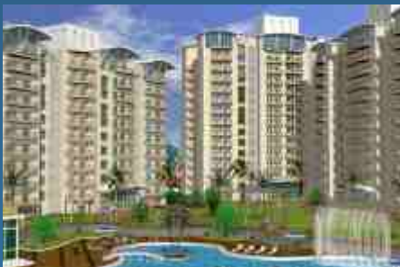
Krishna Apra Gardens Indirapuram, Ghaziabad