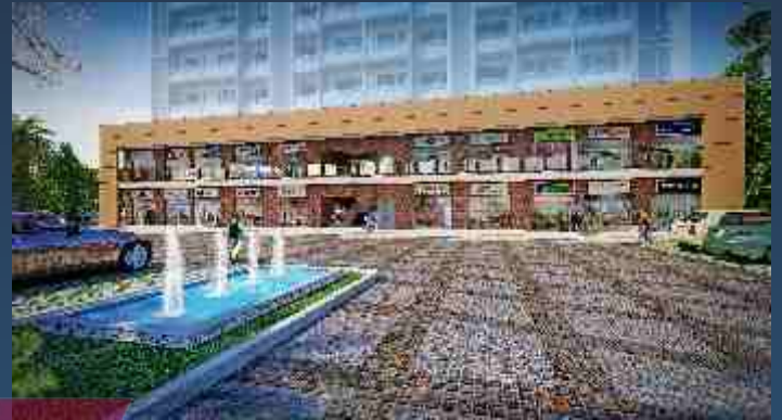
Arcity "Shop Mart" (G.Noida, West)