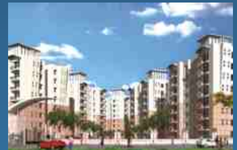
Krishna Apra Residency, Noida