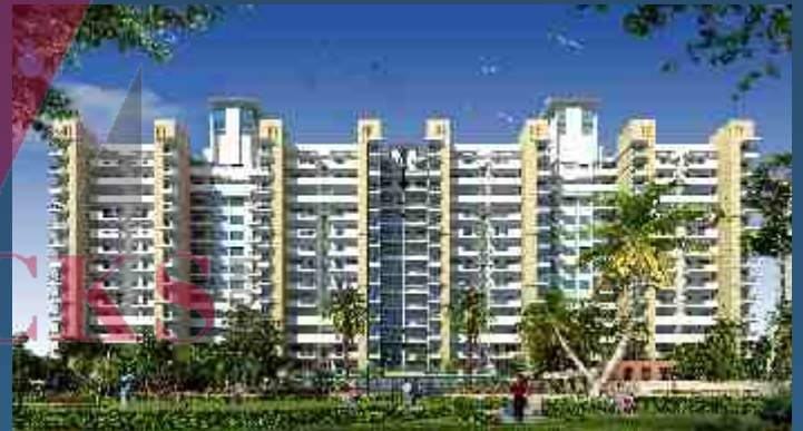
Arcity "Regency Park" (Hisar)