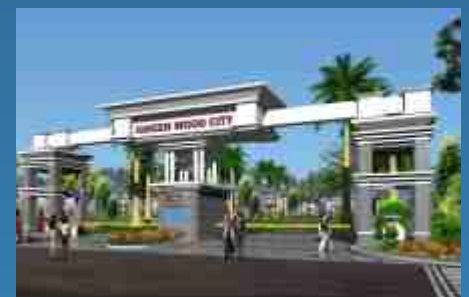
Krishna Artec Greenwood City, Sonapat