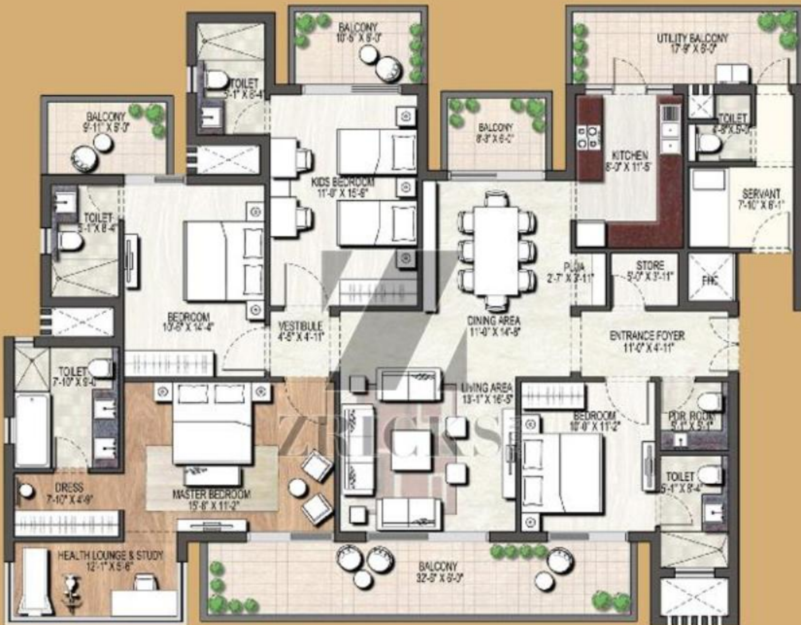
4 B.H.K. + Servant Room Unit Plan - 2835 Sq. Ft.