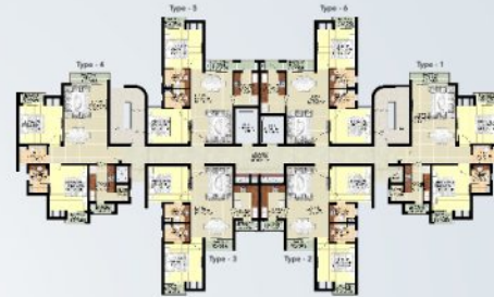
1 st , 2 nd , 3 rd , 4 th , 5 th , 6 th , 7 th , 8 th , 9 th & 10 th Floor Plan For Tower - A, B, C, P & Q 1 st , 2 nd , 3 rd , 4 th , 5 th , 6 th , 7 th , 8 th , 9 th , 10 th & 11 th Floor Plan For Tower - F, G, I & M