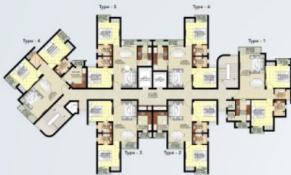
1 st , 2 nd , 3 rd , 4 th , 5 th , 6 th , 7 th , 8 th , 9 th , 10 th & 11 th Floor Plan For Tower - N & O