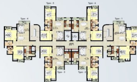
1 st , 2 nd , 3 rd , 4 th , 5 th , 6 th , 7 th , 8 th , 9 th & 10 th Floor Plan For Tower - A, B, C, P & Q 1 st , 2 nd , 3 rd , 4 th , 5 th , 6 th , 7 th , 8 th , 9 th , 10 th & 11 th Floor Plan For Tower - F, G, J & M