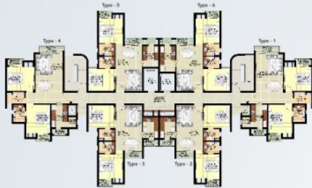
1 st , 2 nd , 3 rd , 4 th , 5 th , 6 th , 7 th , 8 th , 9 th & 10 th Floor Plan For Tower - A, B, C, P & Q 1 st , 2 nd , 3 rd , 4 th , 5 th , 6 th , 7 th , 8 th , 9 th , 10 th & 11 th Floor Plan For Tower - F, G, I & M