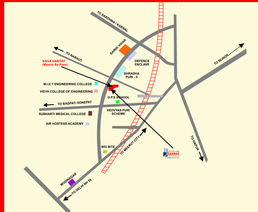
LOCATION PLAN OF SAGA HABITAT, MEERUT

SITE ADD: MEERUT BY-PASS, KHADOLI, MEERUT