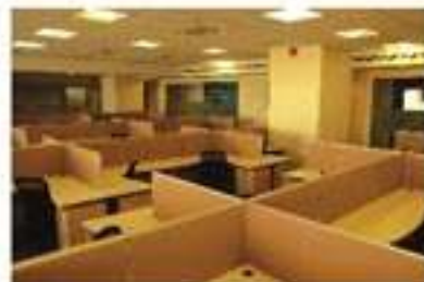
Incubation centre (350 seats)