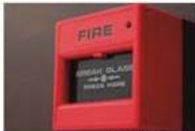
Fire fighting system