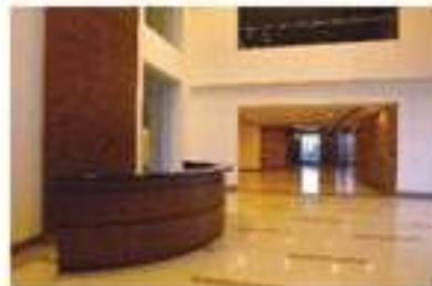
Reception lobby - North entrance