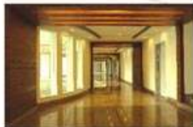
Connecting corridor (5F)