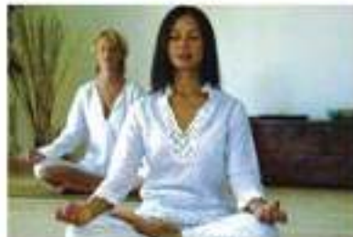
Yoga & Meditation center