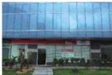
Ready for operations