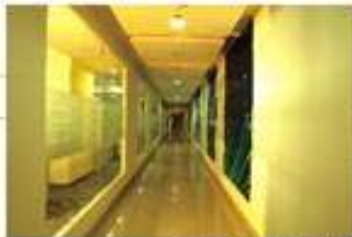
Business centre