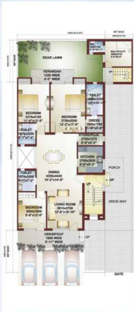
Ground Floor= 1983 sq.ft.

Plot Area = 12.5m x 25m = 312.5 sq.mt= 373.75 sq.yd