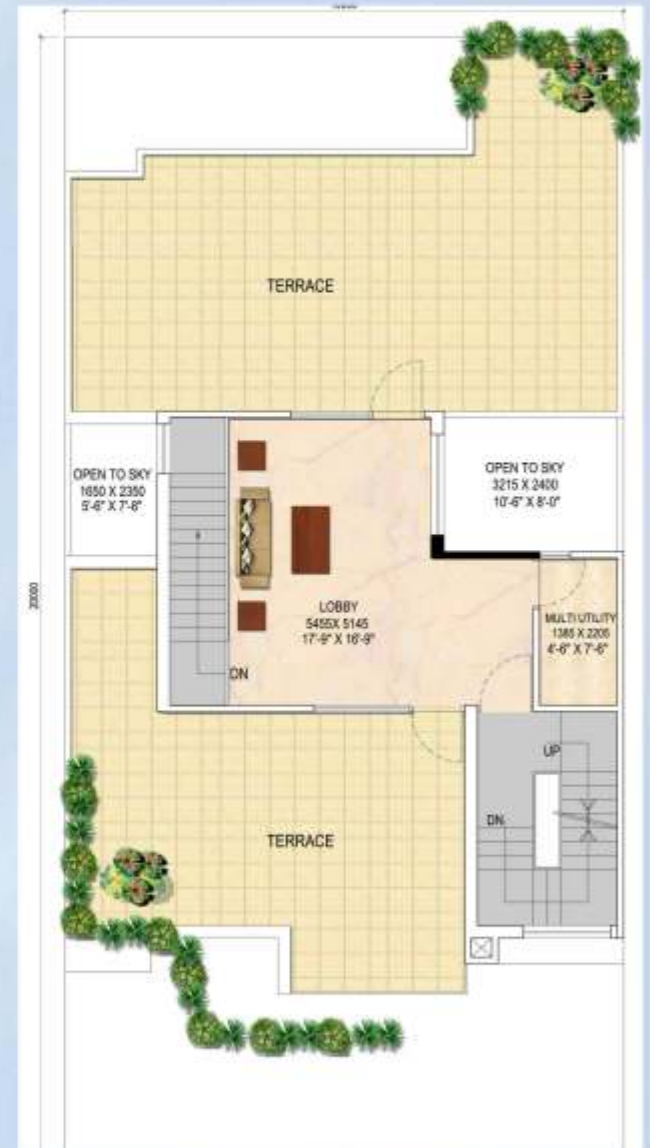
Built-up Area (Ground Floor) = 1563 sq.ft.