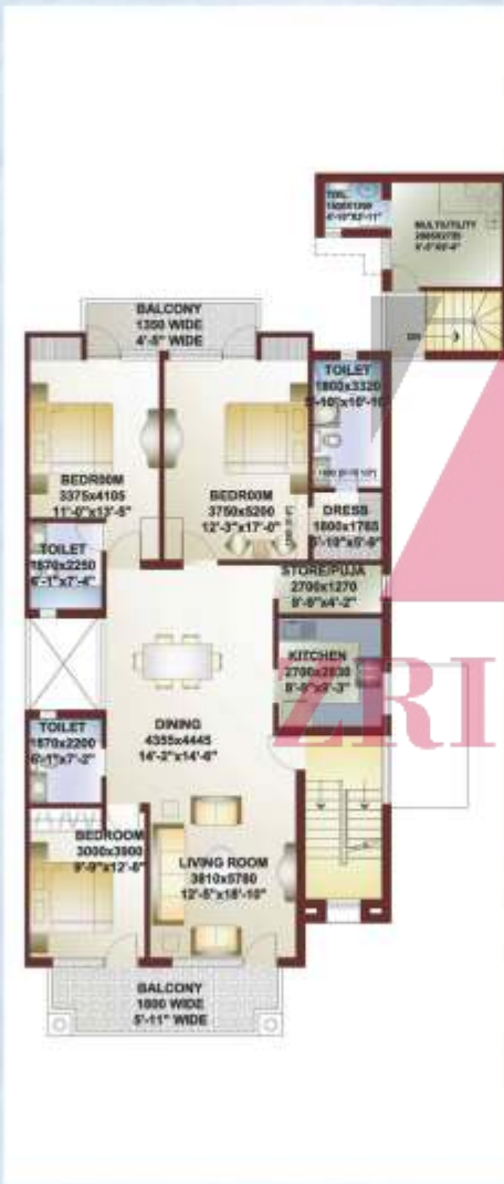
First Floor= 2009 sq.ft.