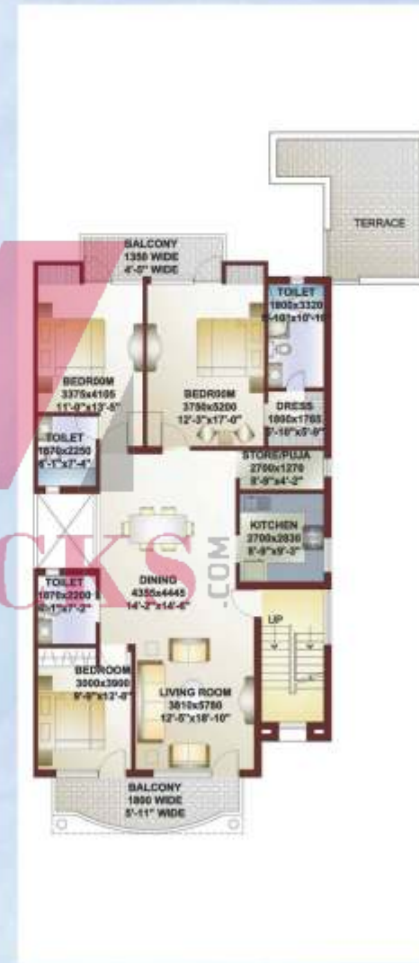
Second Floor + Terrace= 1935 sq.ft.