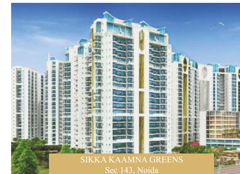
SIKKA KAAMNA GREENS Sec 143, Noida