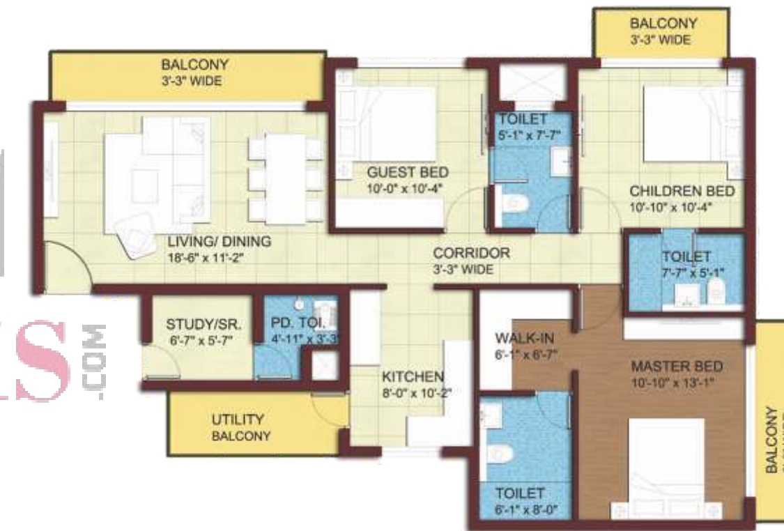
3BHK+ 3 Toilets + Study/Servent Room + Powder room S. Area: 1633 sq.ft.