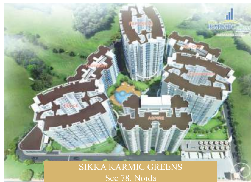
SIKKA KARMIC GREENS Sec 78, Noida