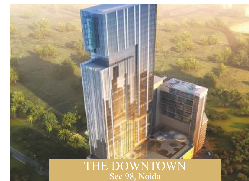
THE DOWNTOWN Sec 98, Noida