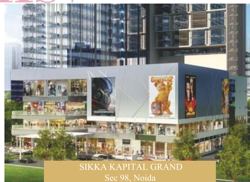
SIKKA KAPITAL GRAND Sec 98, Noida