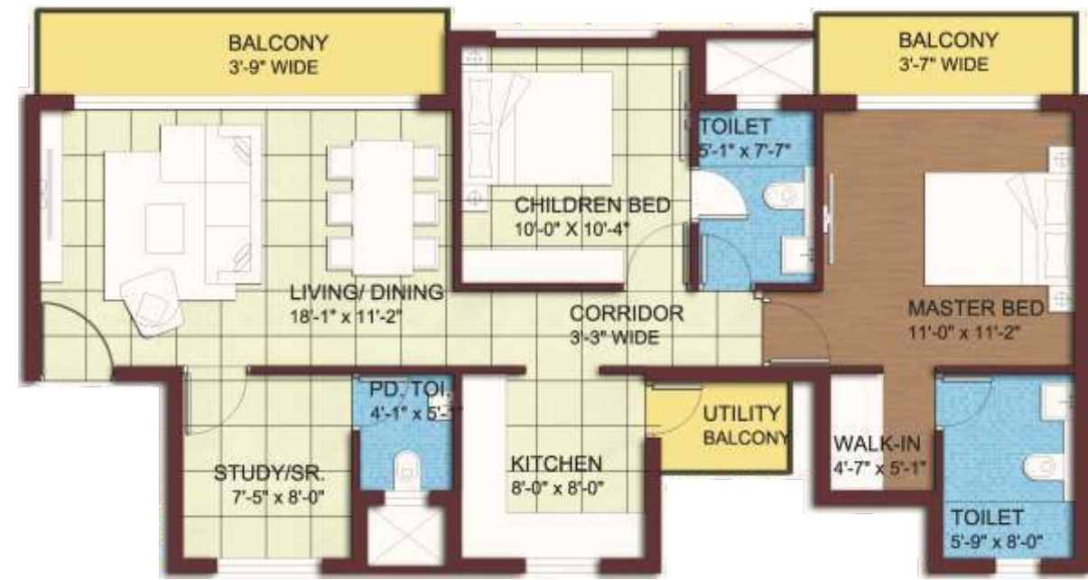
2BHK+ 2 Toilets + Study/Servent Room + Powder room (Type B) S. Area: 1293 sq.ft.