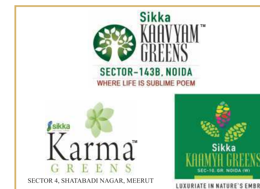
Sikka KAAVYAM™ GREENS SECTOR-143B, NOIDA WHERE LIFE IS SUBLIME POEM