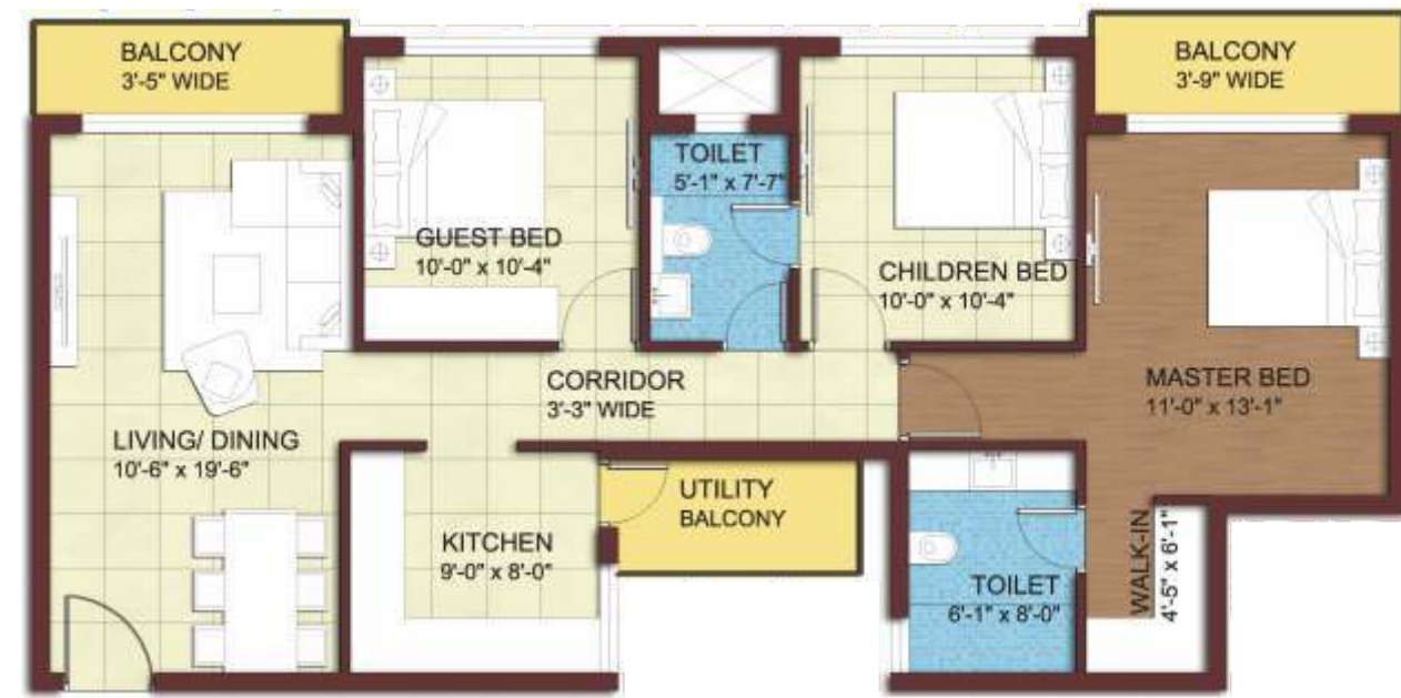
3BHK+ 2 Toilets S. Area: 1450 sq.ft.