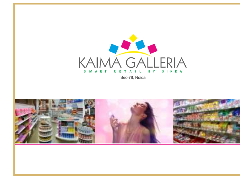
KAIMA GALLERIA SMART RETAIL BY SIKKA Sec-78, Noida