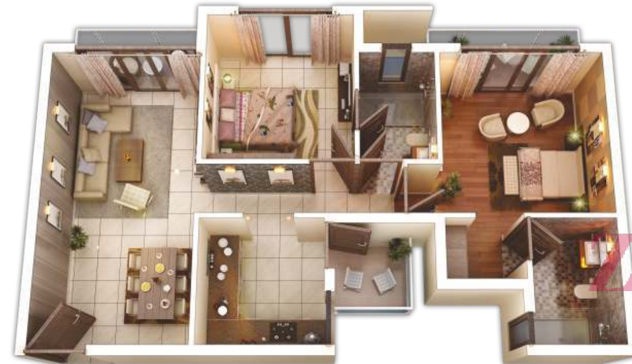
2BHK + 2Toilets (Large, Type B) S. Area: 1135 sq.ft.