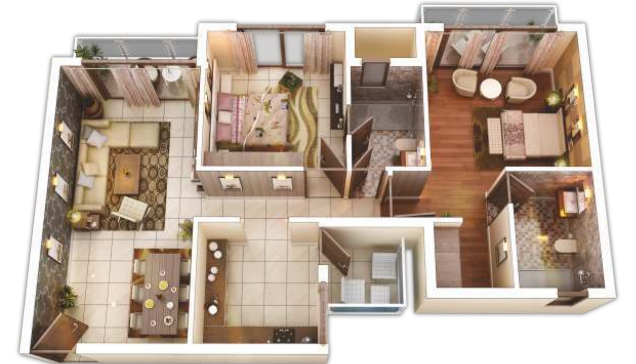
2BHK+ 2 Toilets (Large, Type A) S. Area: 1135 sq.ft.