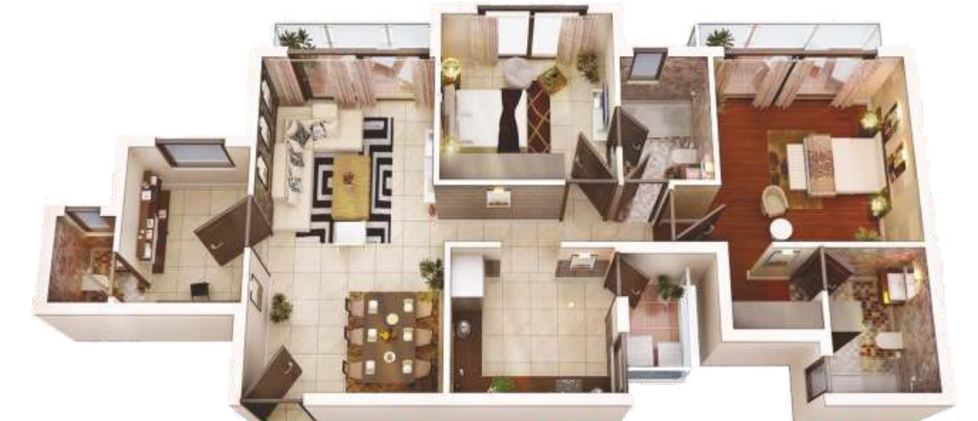
2BHK+ 2 Toilets + Study/Servent Room + Powder room (Type A) S. Area: 1293 sq.ft.