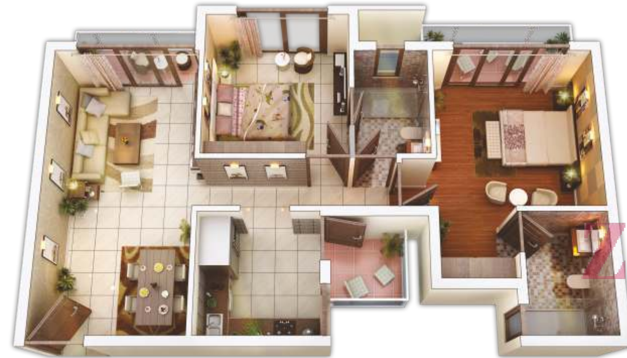
2BHK + 2Toilets (Small) S. Area: 990 sq.ft.