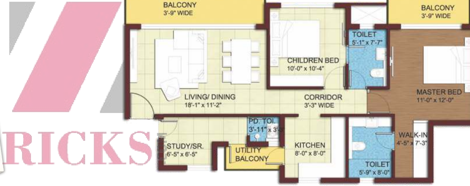
2BHK+ 2 Toilets + Study/Servent Room + Powder room (Type C) S. Area: 1293 sq.ft.