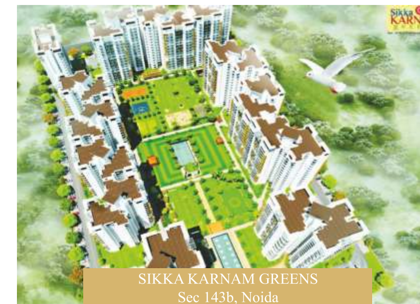
SIKKA KARNAM GREENS Sec 143b, Noida