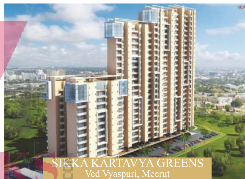
SIKKA KARTAVYA GREENS Ved Vyasपुरi, Meerut