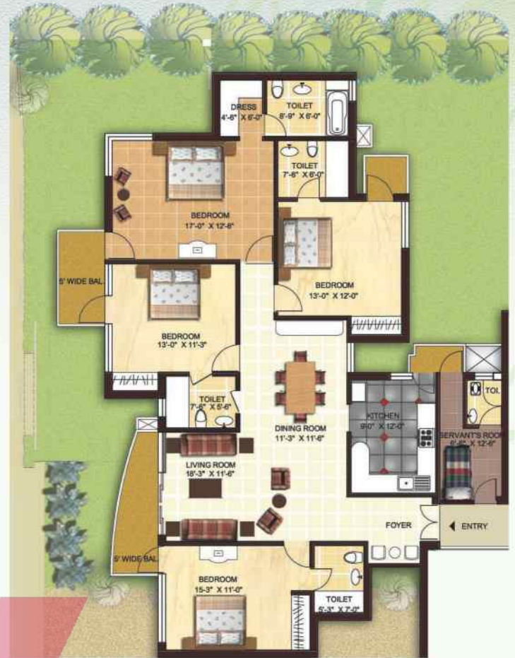
Area - 2570 sq.ft. Saleable Area