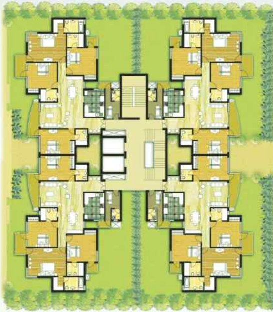
▲ Cluster Plan