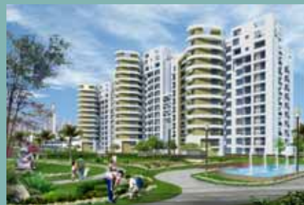
Eldeco Amantran Sec. 119, Noida