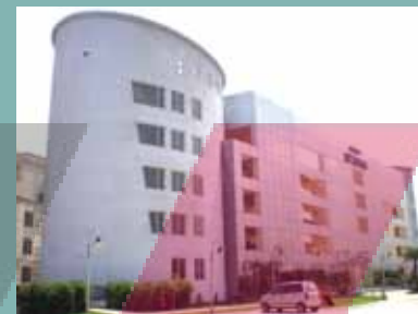
Eldeco Studio Sec. 93A, Expressway, Noida