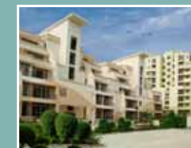
Eldeco Utopia*, Expressway, Noida