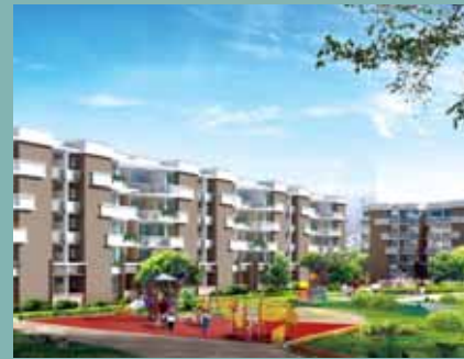
Eldeco Mystic Green Sec. Omicron, Greater Noida