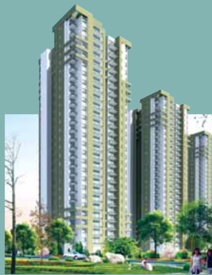
Eldeco Magnolia Park Sec. 119, Noida