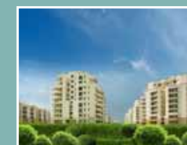
Eldeco Utopia*, Expressway, Noida