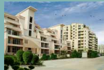
Eldeco Sylvan View Sec.93A, Expressway, Noida