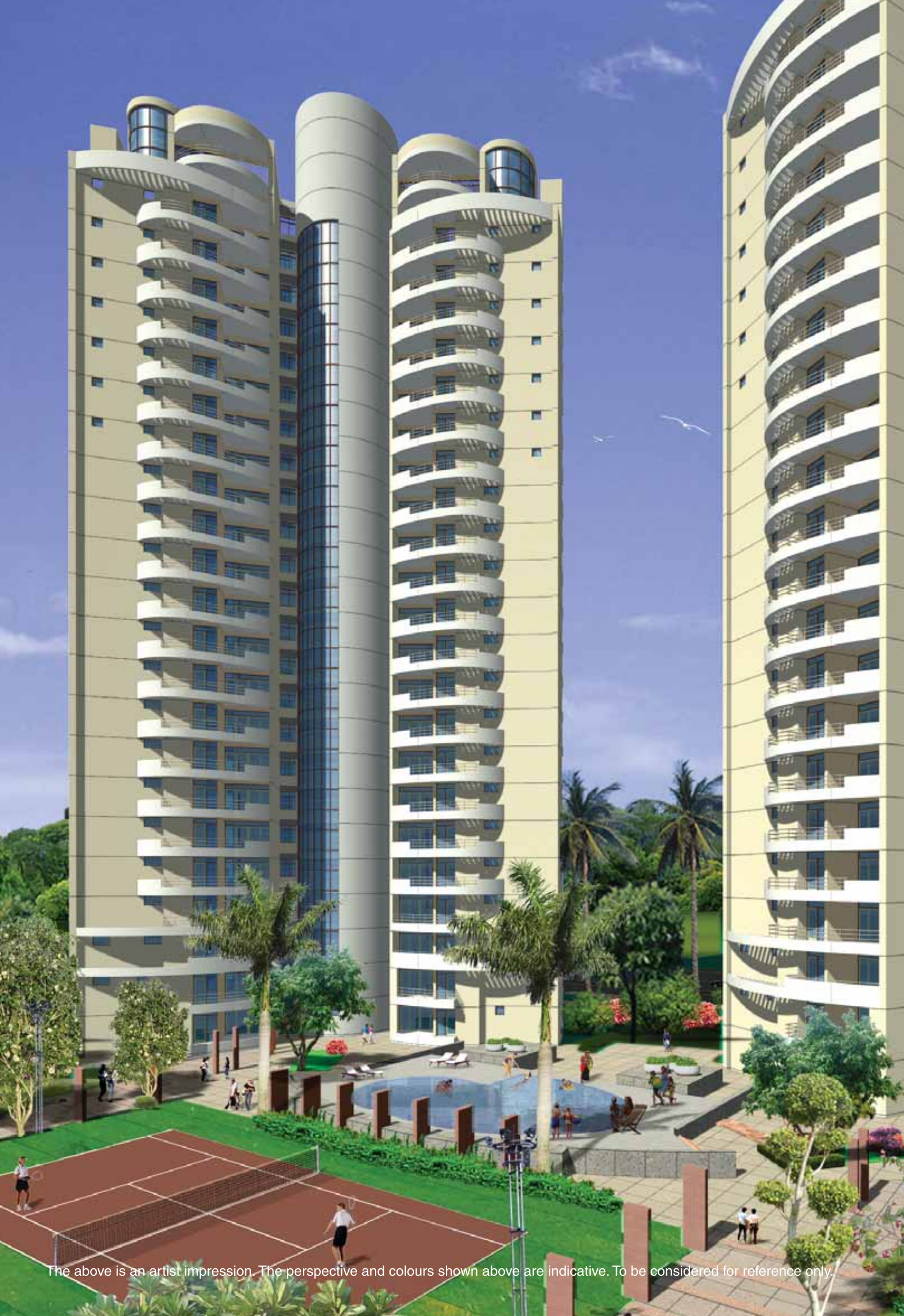
The above is an artist impression. The perspective and colours shown above are indicative. To be considered for reference only.