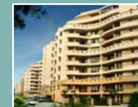
Eldeco Utopia*, Expressway, Noida