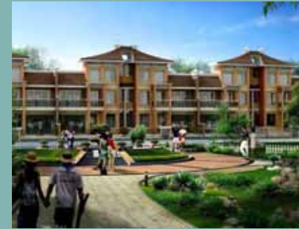
Eldeco Eden Park Neemrana, Rajasthan