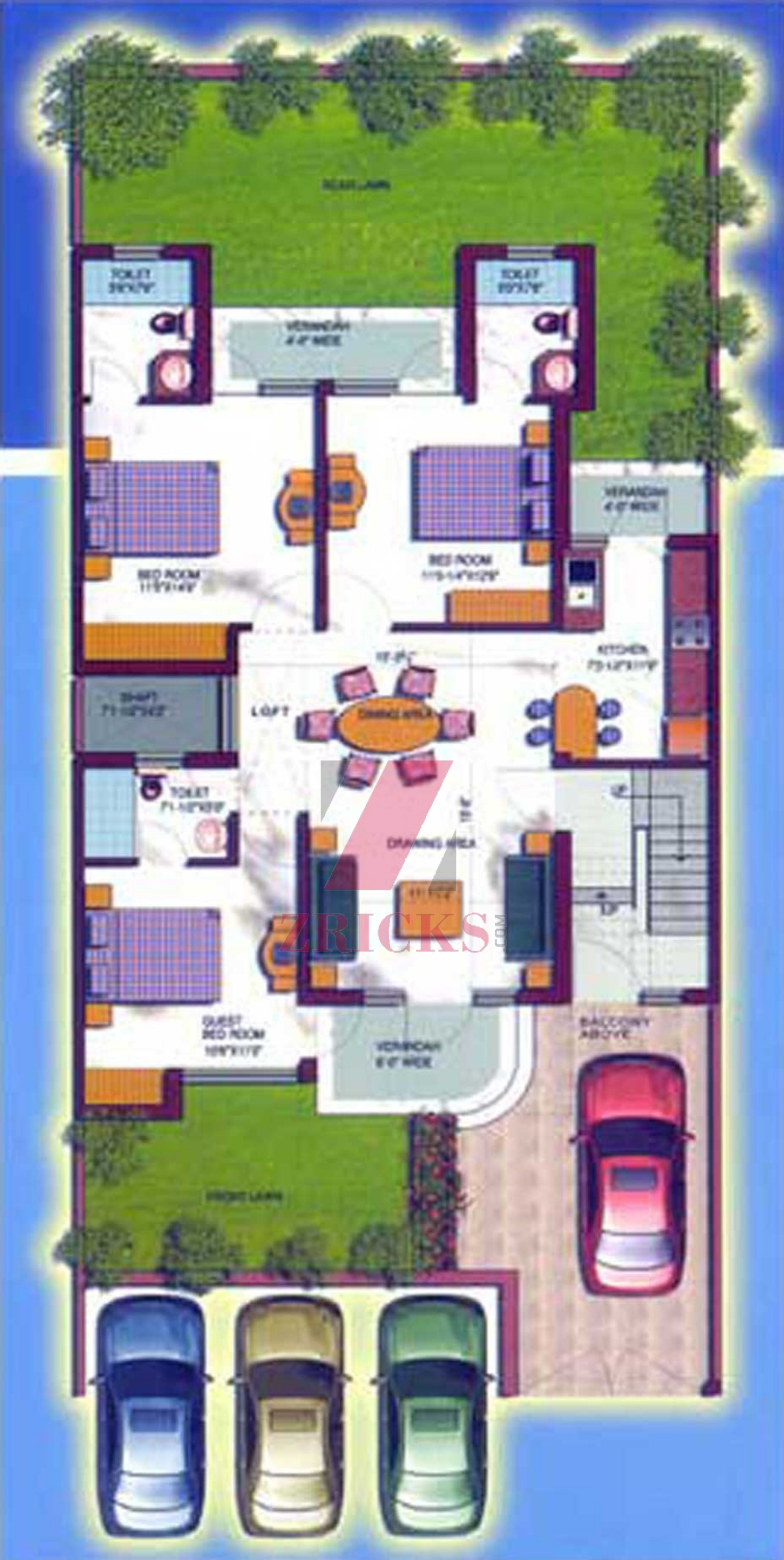
3 BHK+1200SQ.FT+2nd Floor