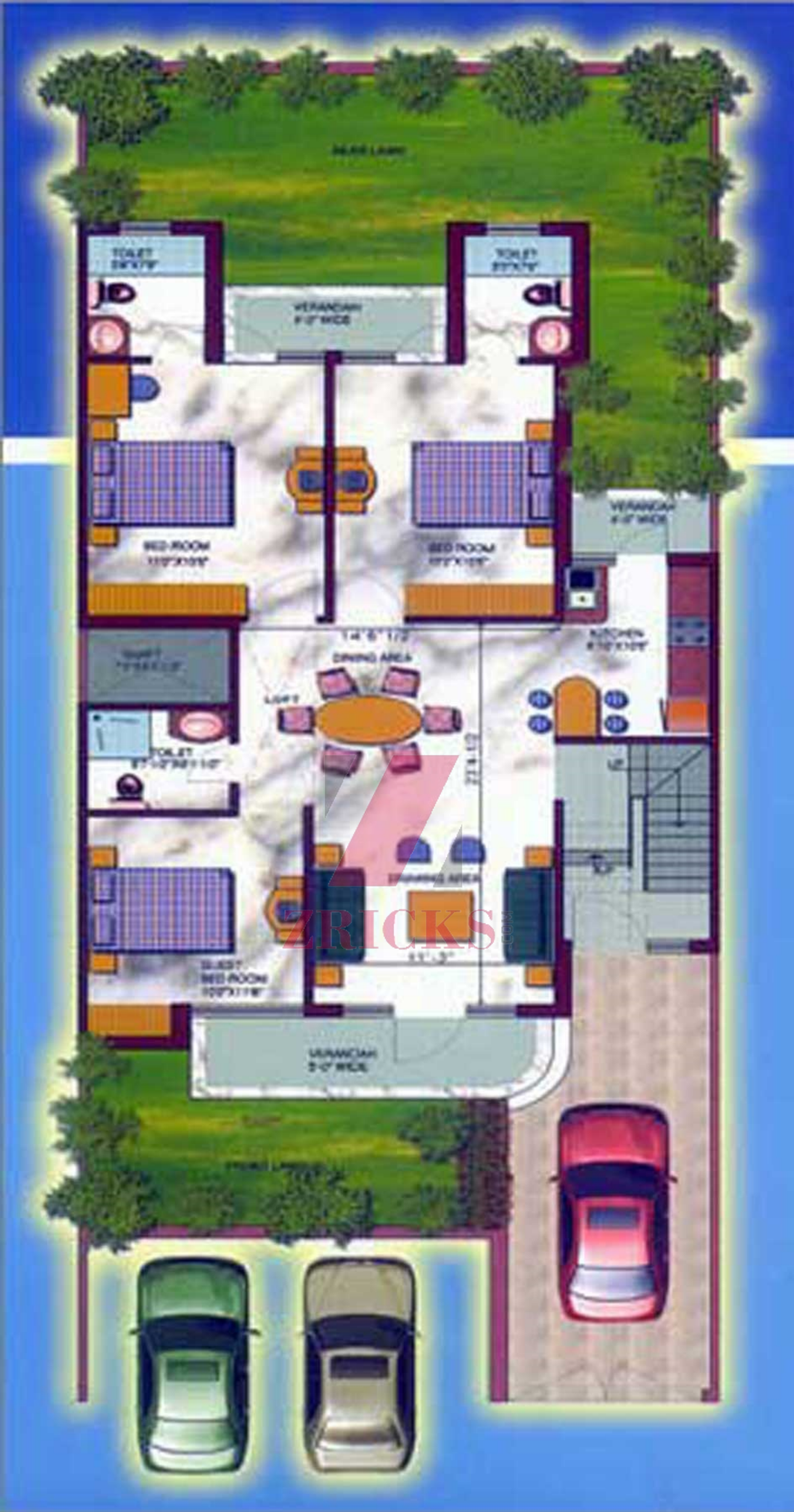
3 BHK+1200SQ.FT+1st Floor