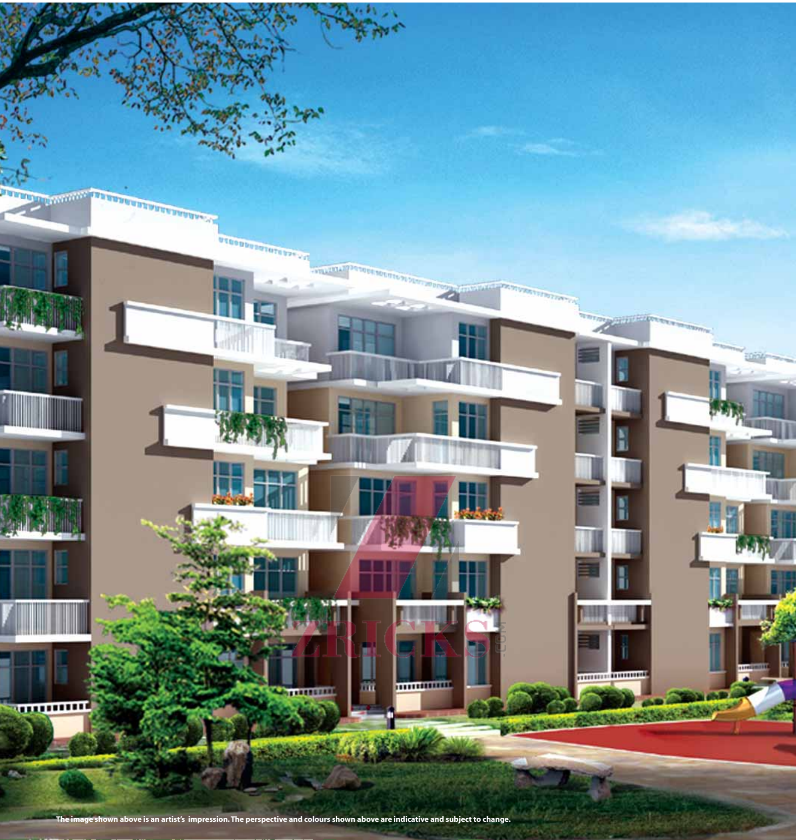
The image shown above is an artist's impression. The perspective and colours shown above are indicative and subject to change.