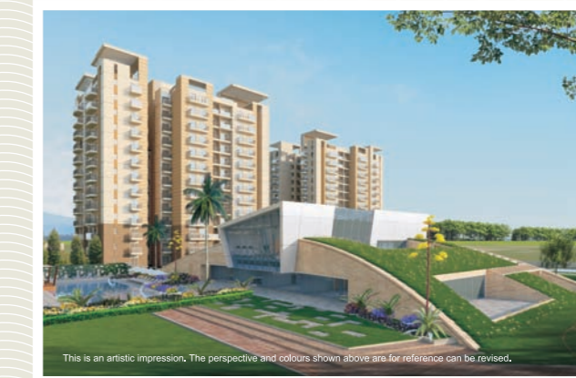
This is an artistic impression. The perspective and colours shown above are for reference can be revised.