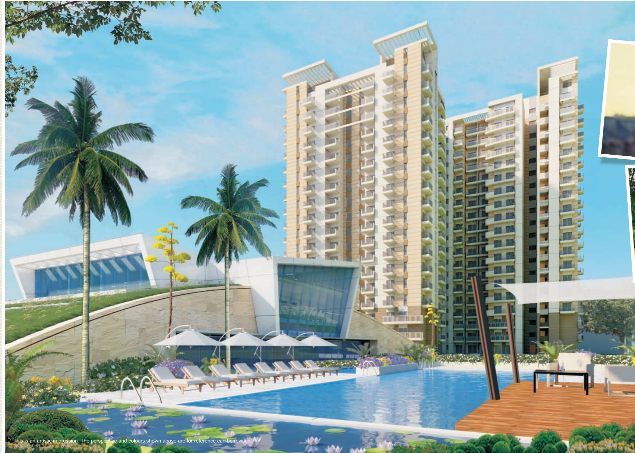
This is an artistic impression. The perspective and colours shown above are for reference can be revised.

Enter your home to celebrate your achievements with loved ones. Capture moments beyond the photoframes, create memories to last a lifetime. Stir some thoughts in the kitchen or scrub off the worldly worries under a refreshing shower. Feel at home. Feel rewarded.