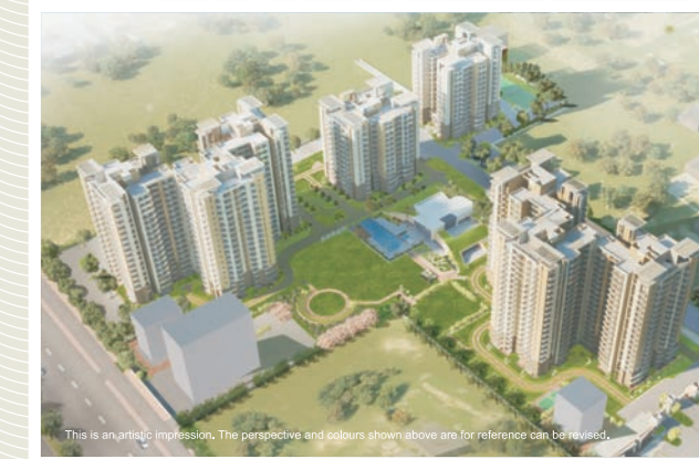
This is an artistic impression. The perspective and colours shown above are for reference can be revised.