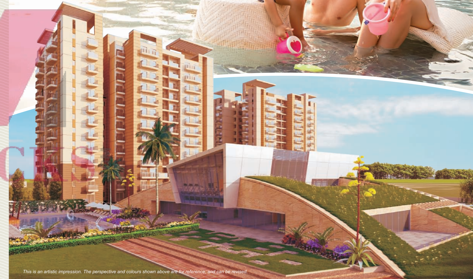
This is an artistic impression. The perspective and colours shown above are for reference, and can be revised.