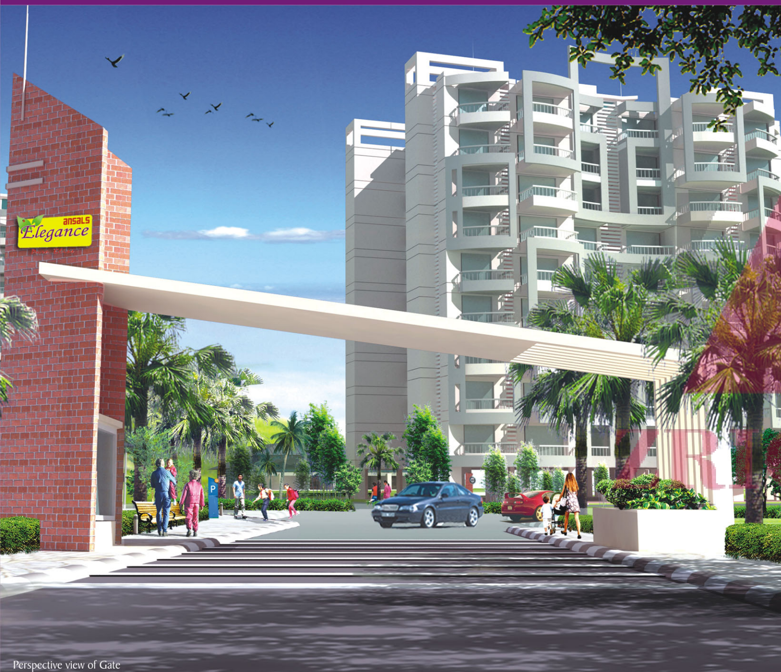
Perspective view of Gate