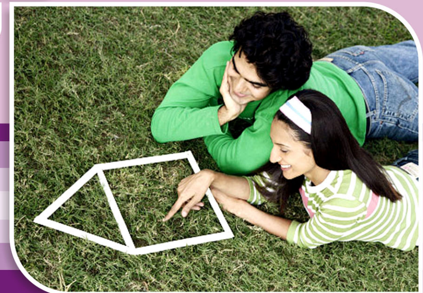
Reference picture only