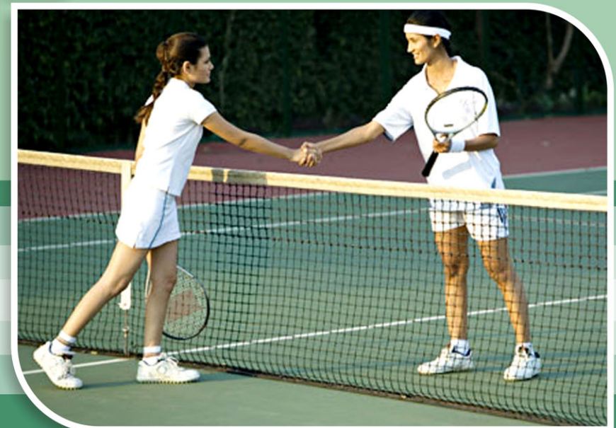
Reference picture only