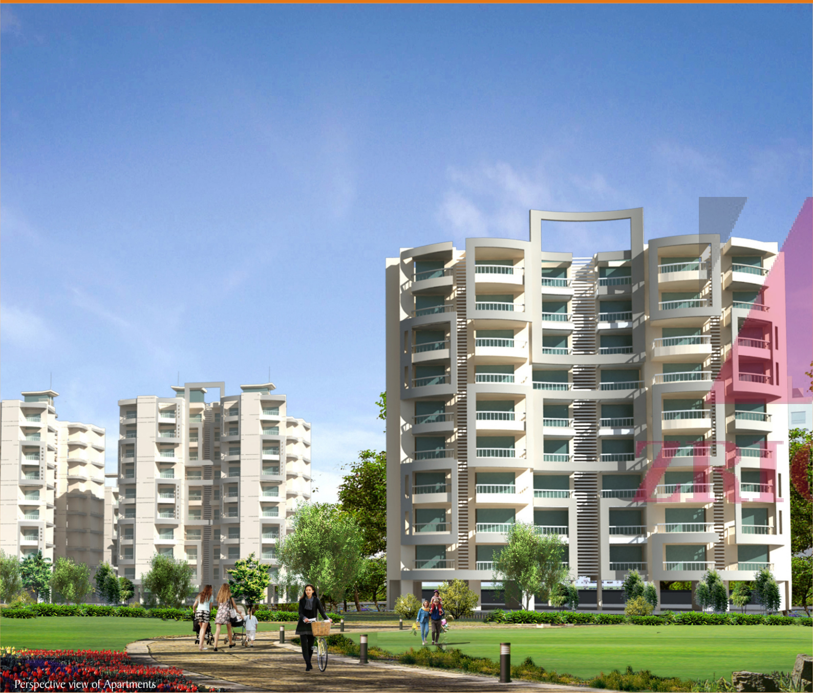
Perspective view of Apartments