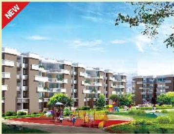
Eldeco Mystic Greens Sector Omicron, Greater Noida