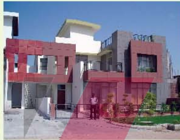
Eldeco County Sector 19, Main G.T. Road, Sonapat