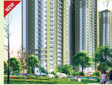
Eldeco Magnolia Park Sector 119, Noida