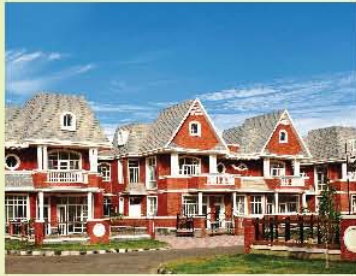
Eldeco Mansionz Sector 48, Sohna Road, Gurgaon