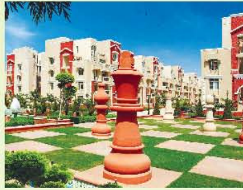
Eldeco Green Meadows Sector Pi, Greater Noida