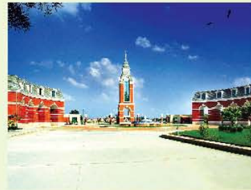
Eldeco Estate One, Panipat Sector 40, G.T. Karnal Road