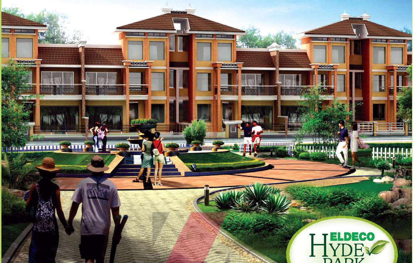
This is an artistic impression. The perspective & colours shown above are for reference & can be revised.