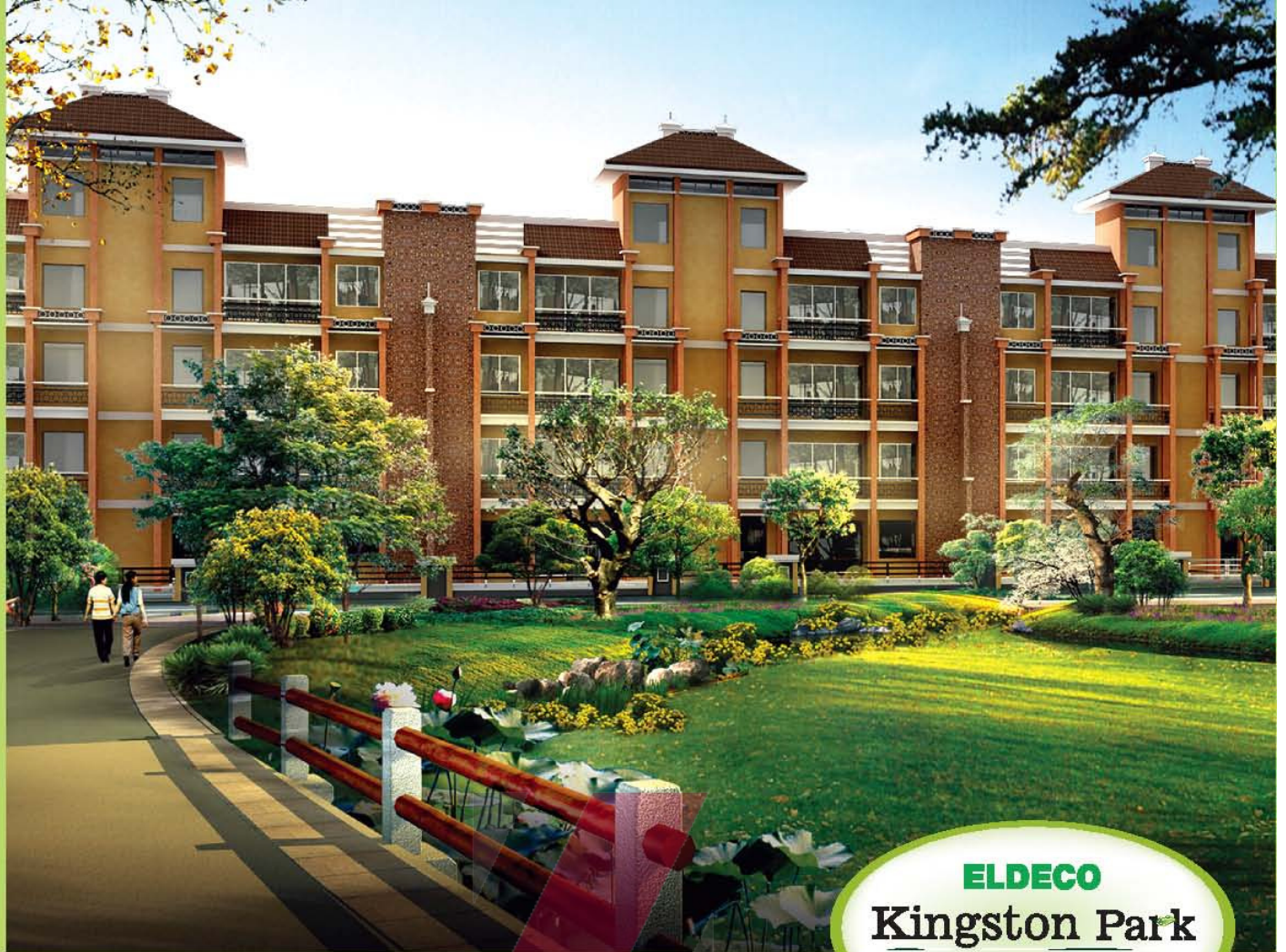
This is an artistic impression. The perspective & colours shown above are for reference & can be revised.