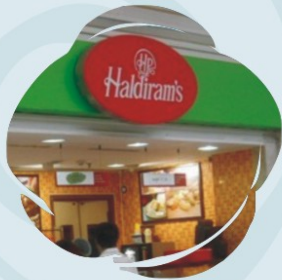
Haldiram's Outlet in Bhiwadi