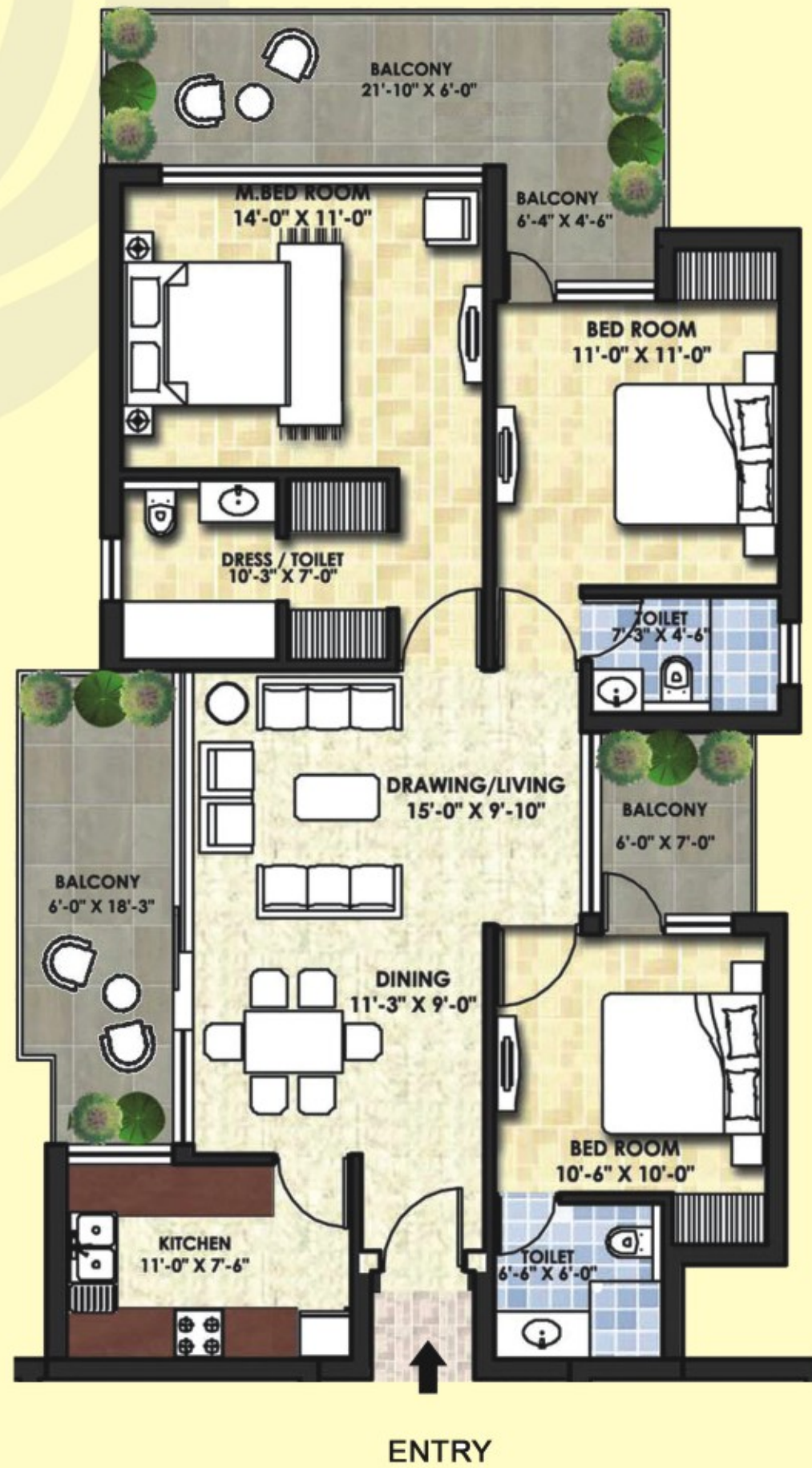
Type 1-B (3BHK) 1650 Sq. Ft.