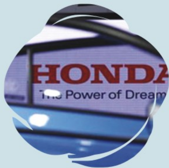
Honda Plant, Bhiwadi