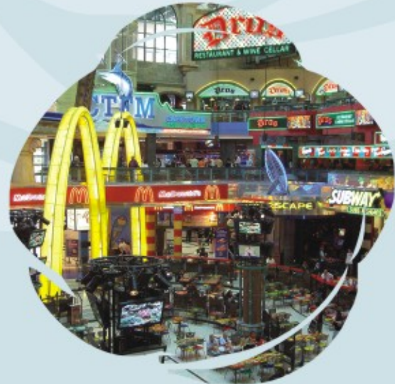
Multiplex in Bhiwadi