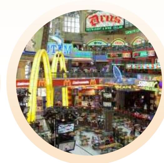
Multiplex in Bhiwadi