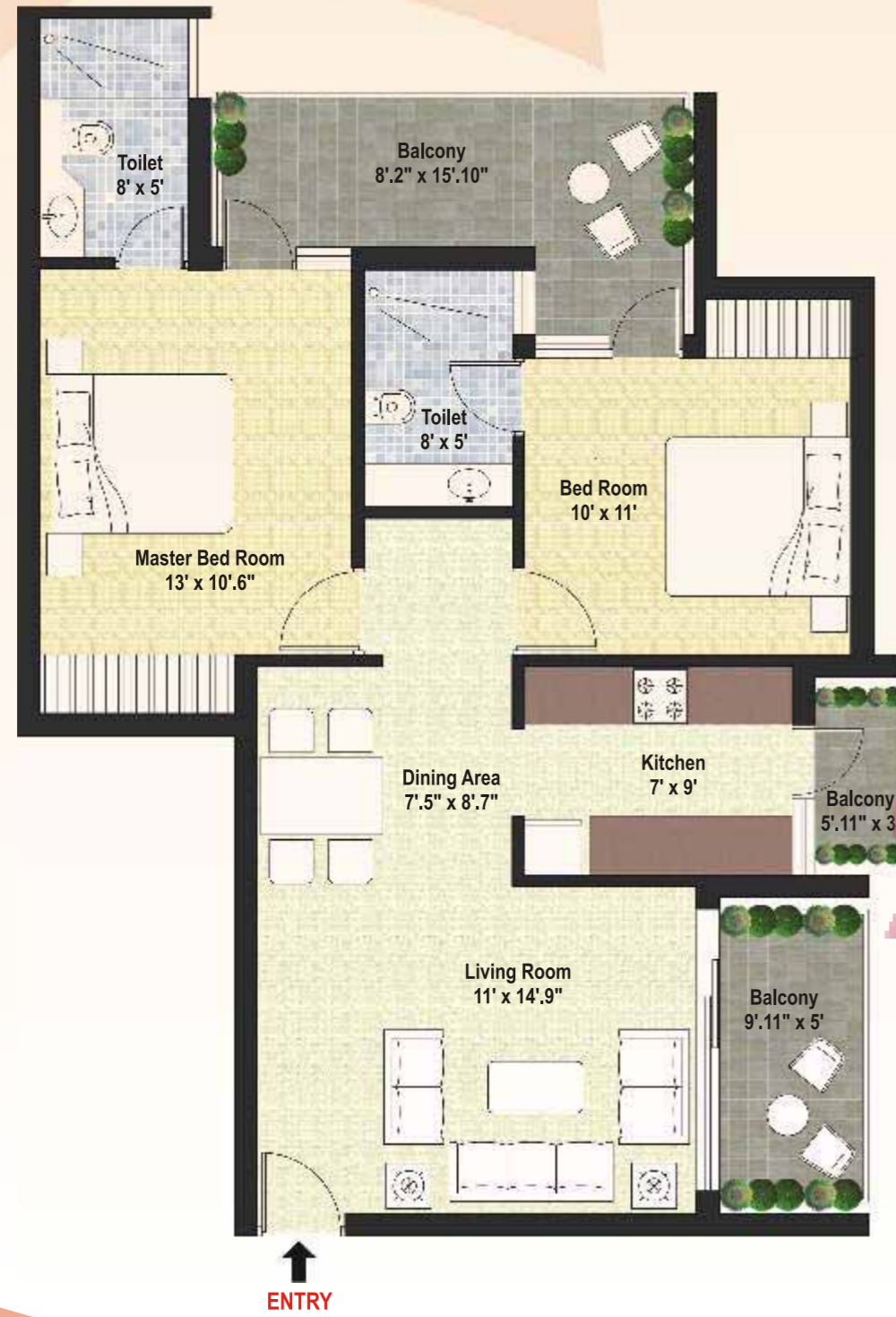
Type - A (2BHK) 1150 Sq. Ft.