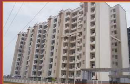
Actual Site Photograph of Avalon Gardens, Bhiwadi