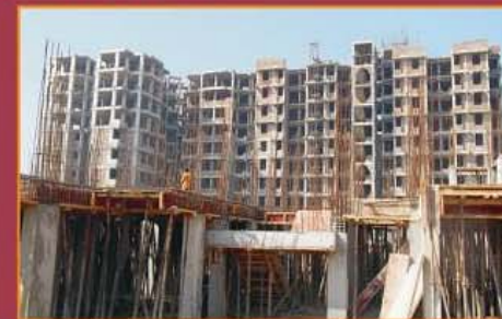
Actual Site Photograph of Avalon Residency, Bhiwadi