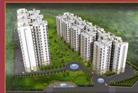
Perspective View of Avalon Rangoli, Bhiwadi