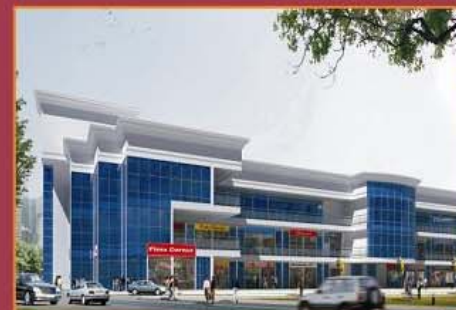
Perspective View of Avalon Plaza, Bhiwadi