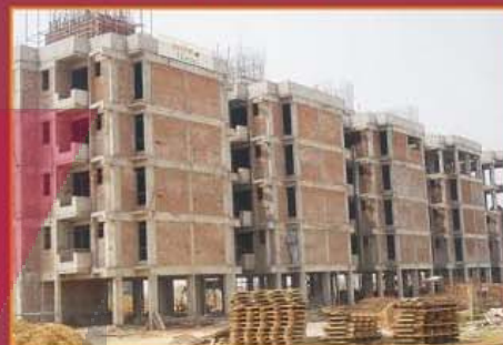
Actual Site Photograph of Avalon Homes, Bhiwadi