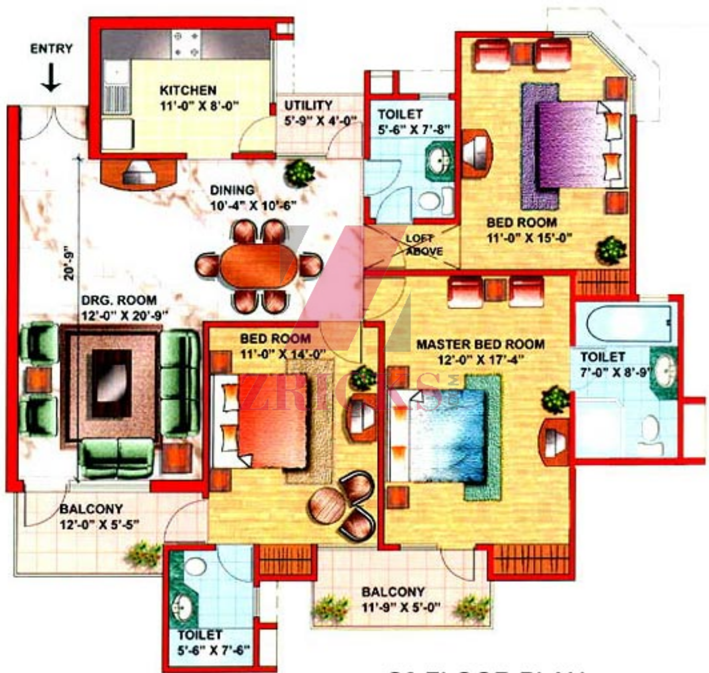
C3 FLOOR PLAN SUPER AREA = 1785 SQ. FT ACCOMMODATION = 3 B/R + 3 TOILETS