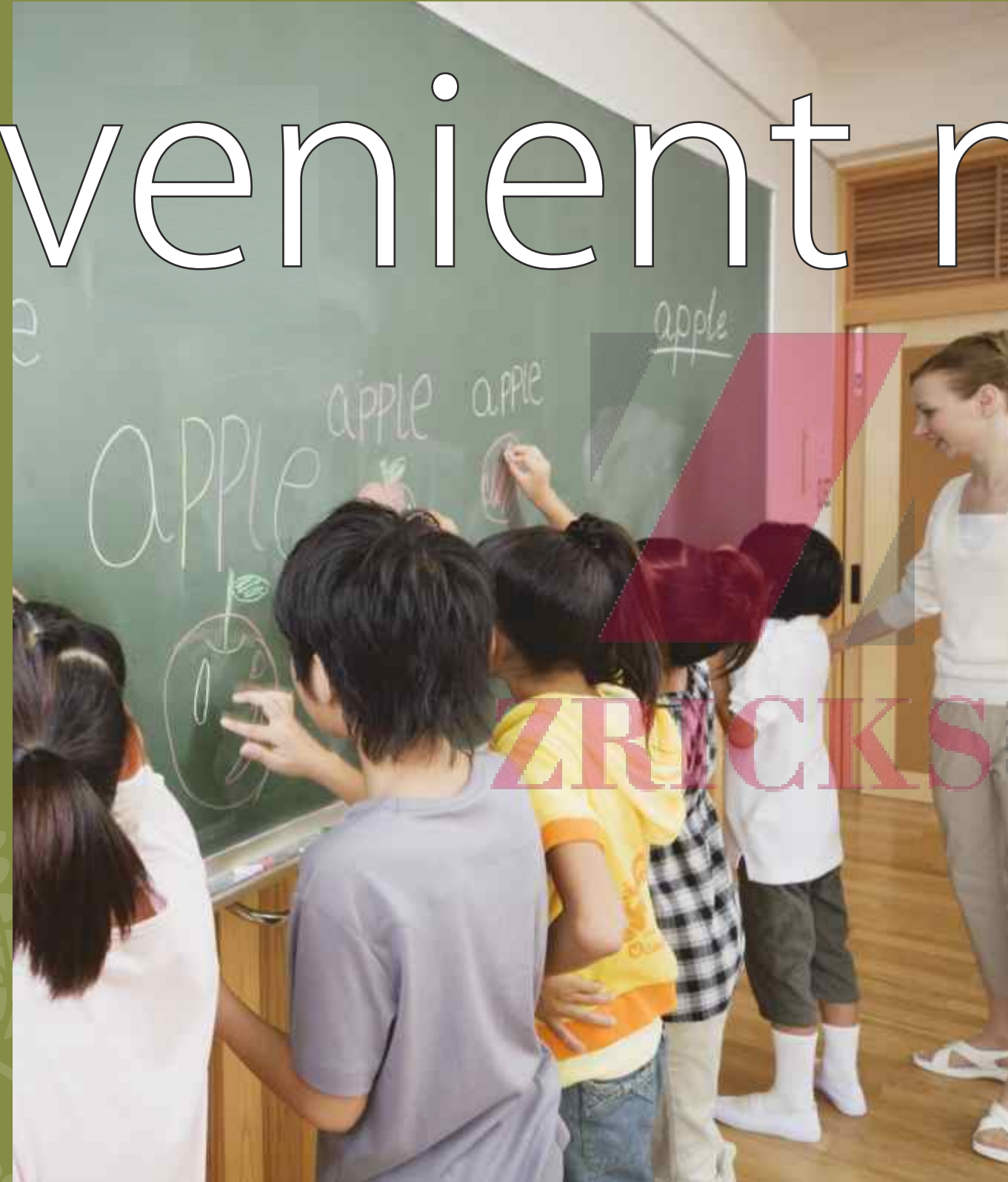
Primary & Nursery School

The M2K County is a complete world in itself. The meticulously planned layout is systematically spread in scenic plush vicinity with every modern city facility. The primary & nursery school, health center and sports facilities are specially designed to exceed every expectation of luxury living.