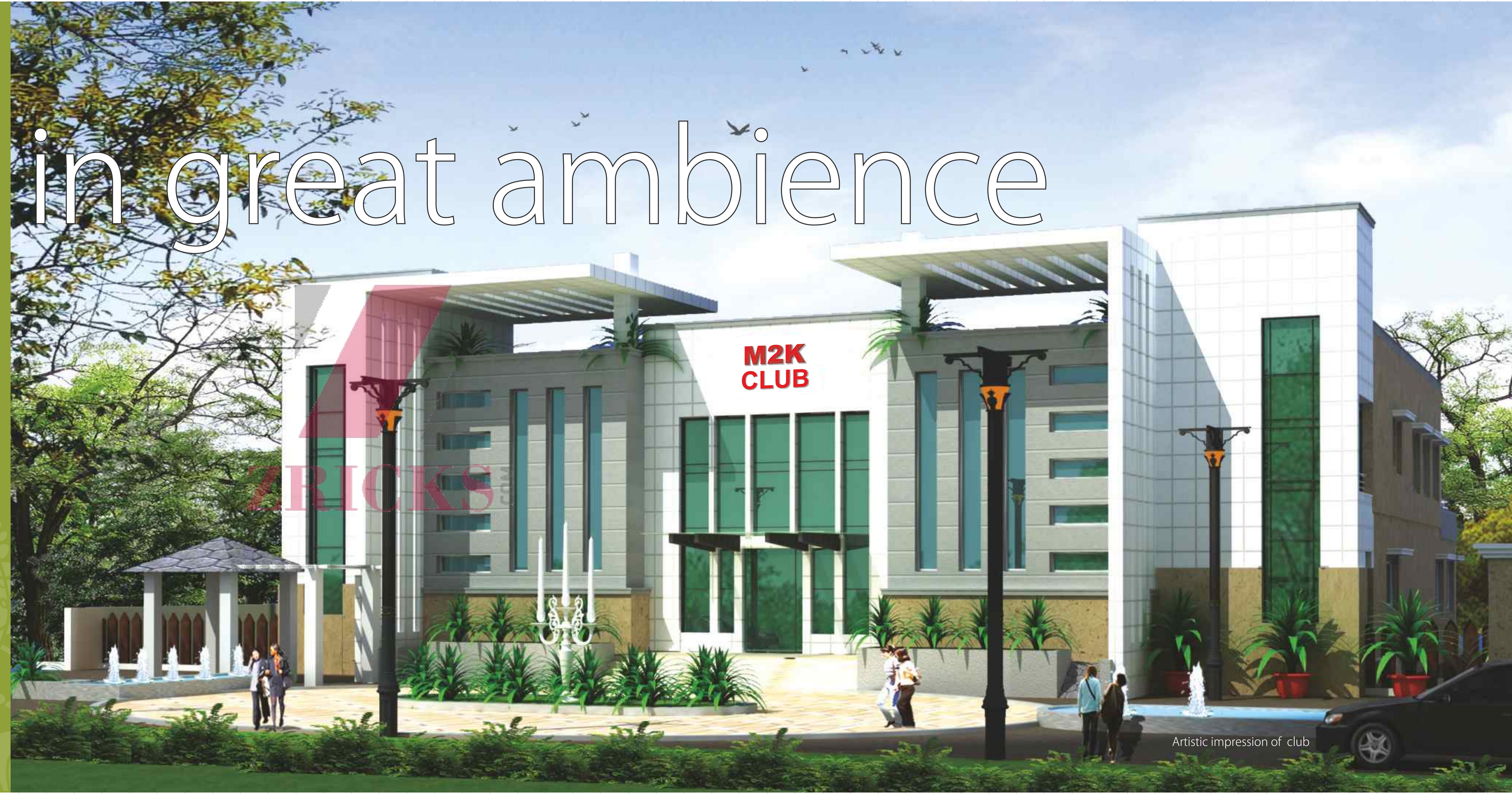
Artistic impression of club