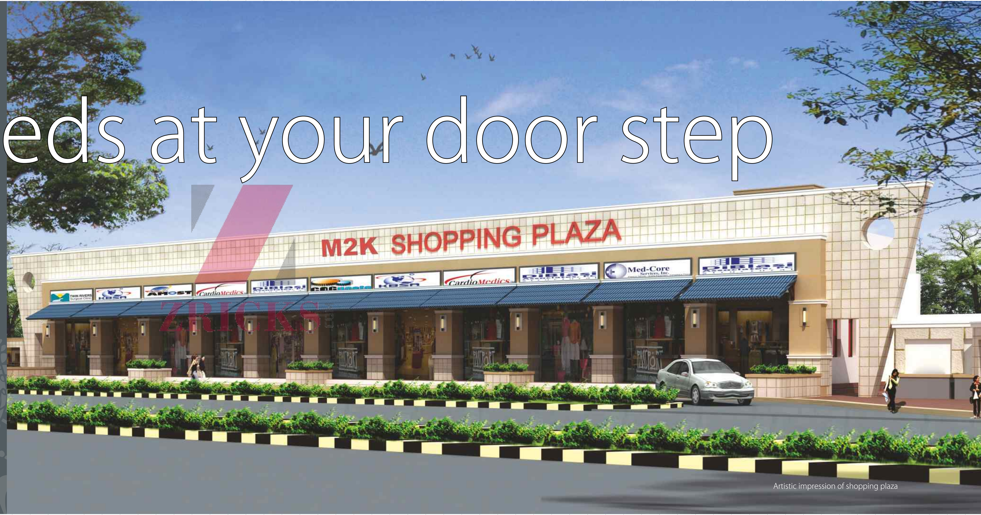
Artistic impression of shopping plaza

The world-class modern age facilities like Shopping Arcade with Lifestyle and daily need stores at the M2K County are methodically designed to compliment your County living.