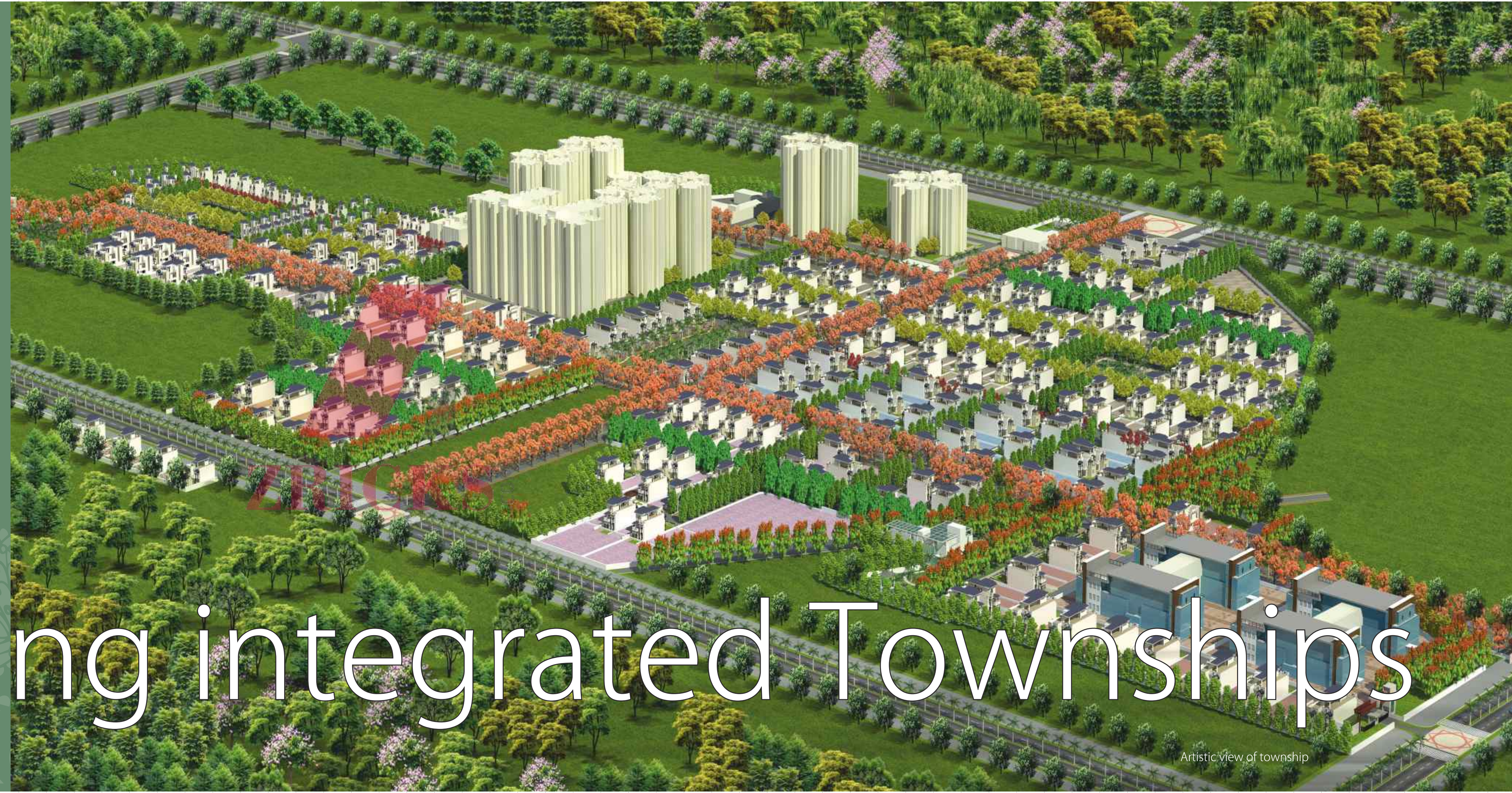
Artistic view of township