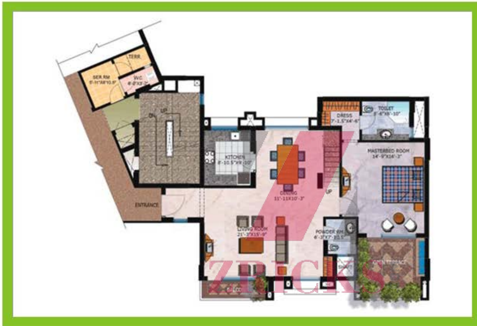
Lower level Pent House Type (A) Above 1737 sq. ft., 3 Bedrooms with Servant Room Area - 3474 scoff. + Top Terrace