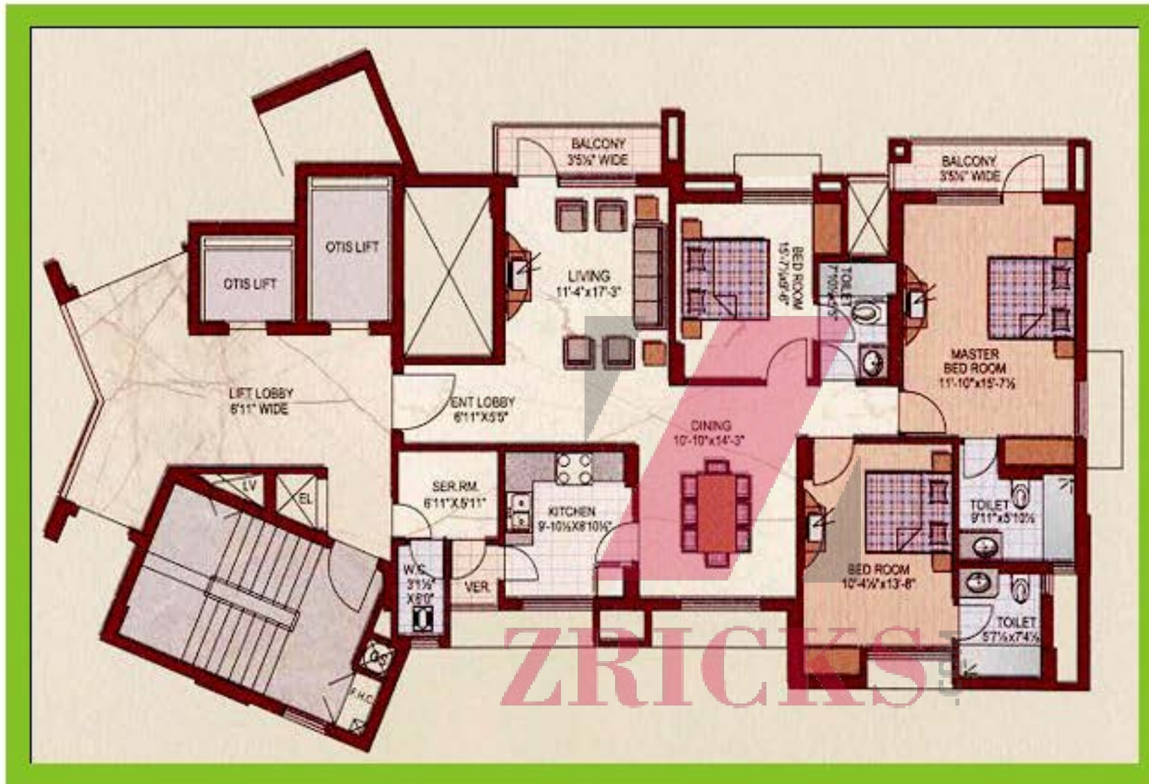
Key Plan Type (B)