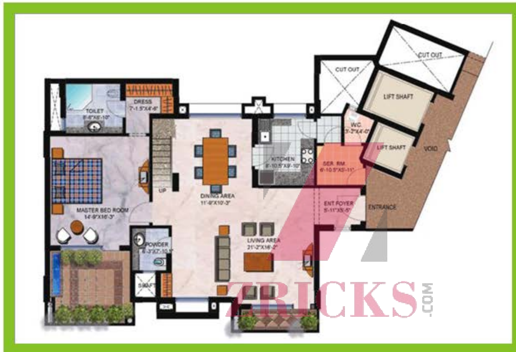
Lower level Pent House Type (B) Above 1875 sq.ft., 3 Bedrooms with Servant Room Area - 3750 sq.ef. + Top Terrace