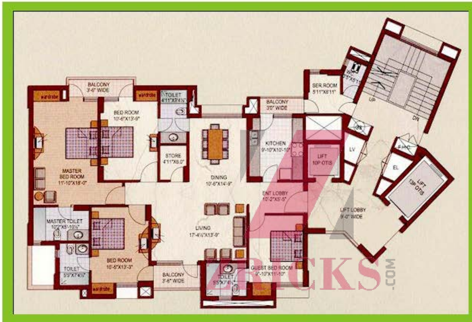
Key Plan Type (C)