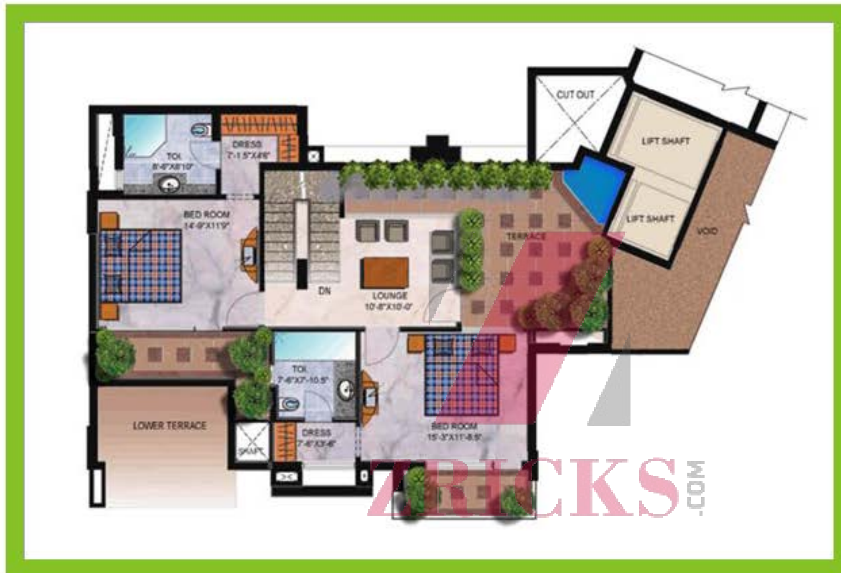
Upper level Pent House Type (B) Above 1875 sq. ft., 3 Bedrooms with Servant Room Area - 3750 sq. ef. + Top Terrace