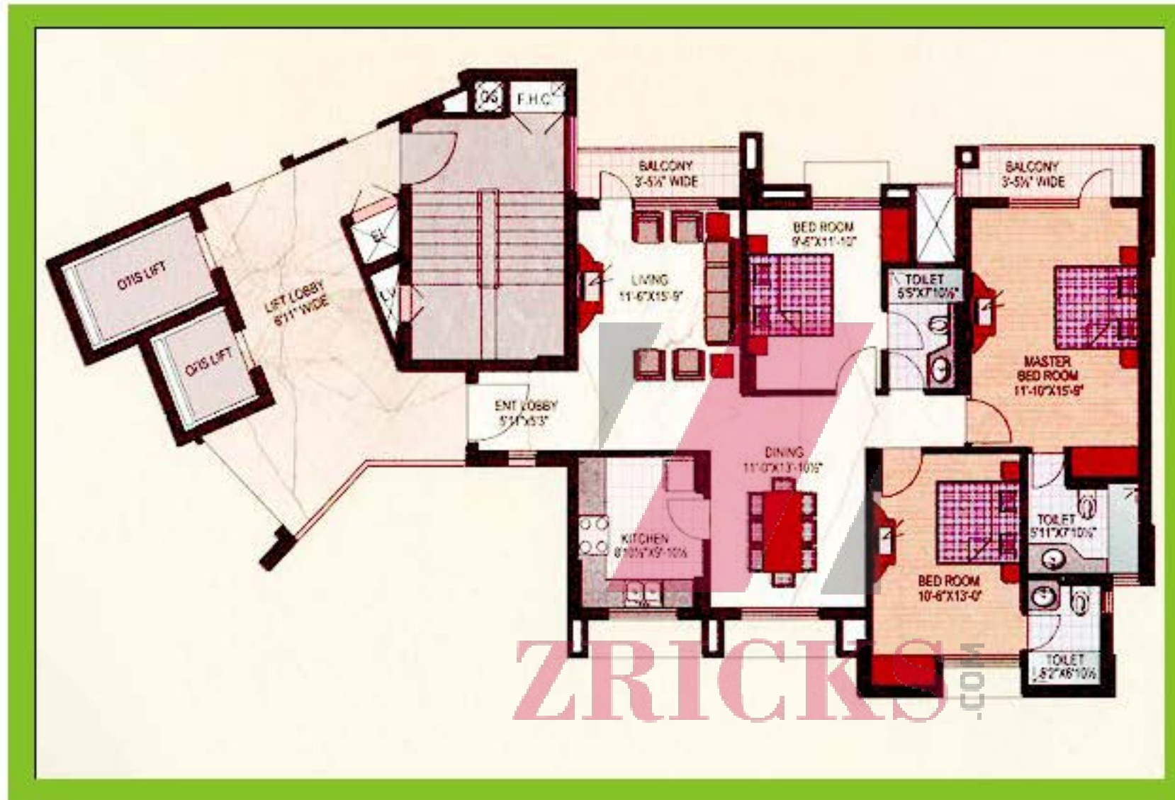
Key Plan Type (A)