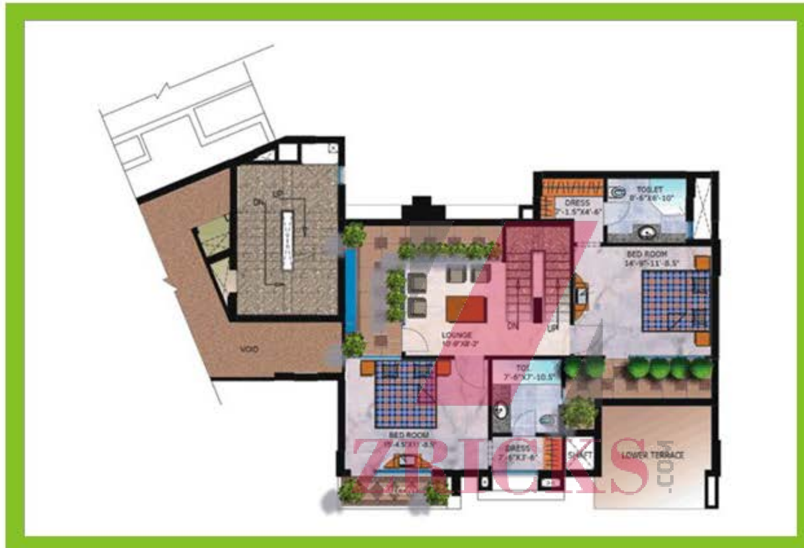
Upper level Pent House Type (A) Above 1737 sq.ft., 3 Bedrooms with Servant Room Area - 3474 scoff. + Top Terrace