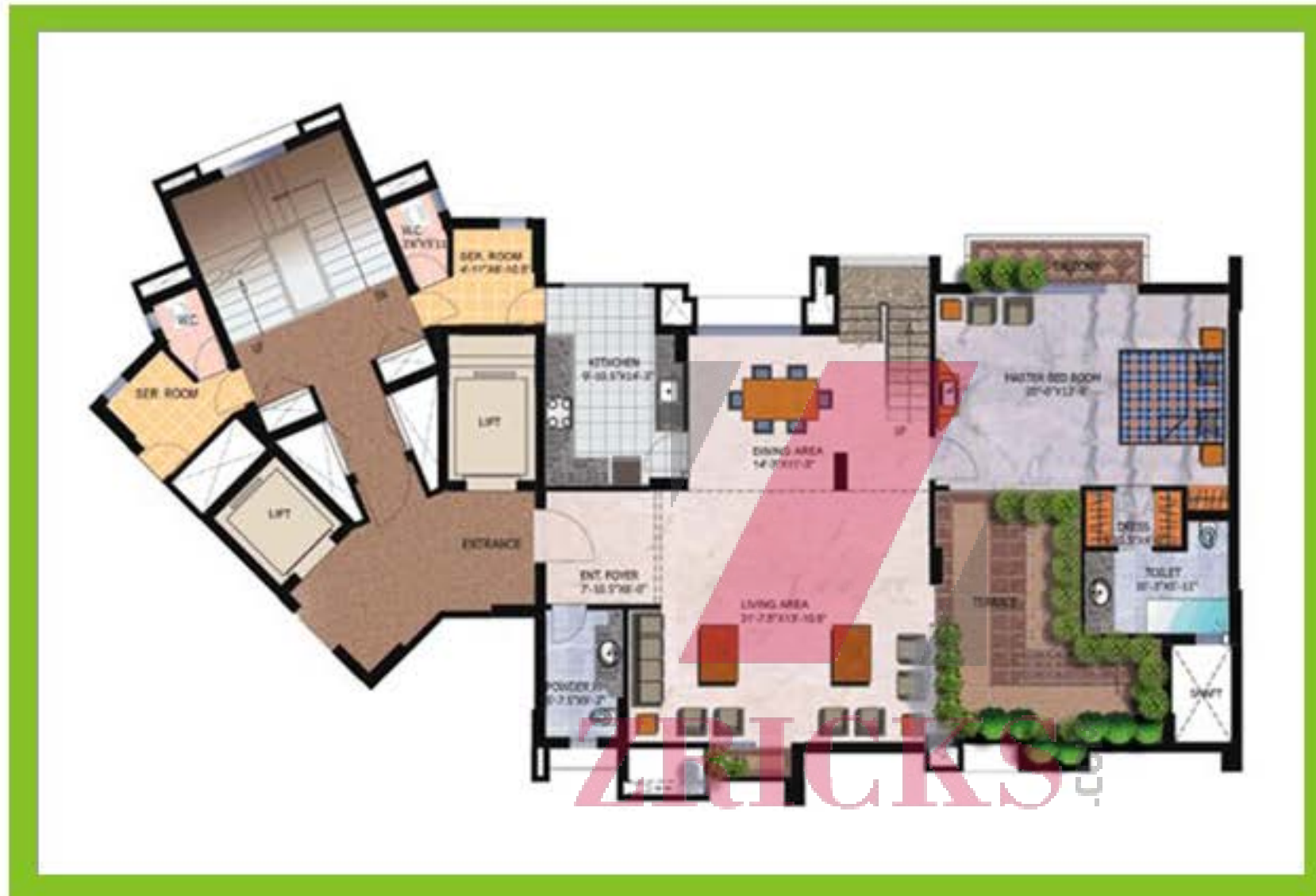
Lower level Pent House Type (C) Above 2350 sq.ft., 4 Bedrooms with Servant Room Area - 4700 sq.ef. + Top Terrace