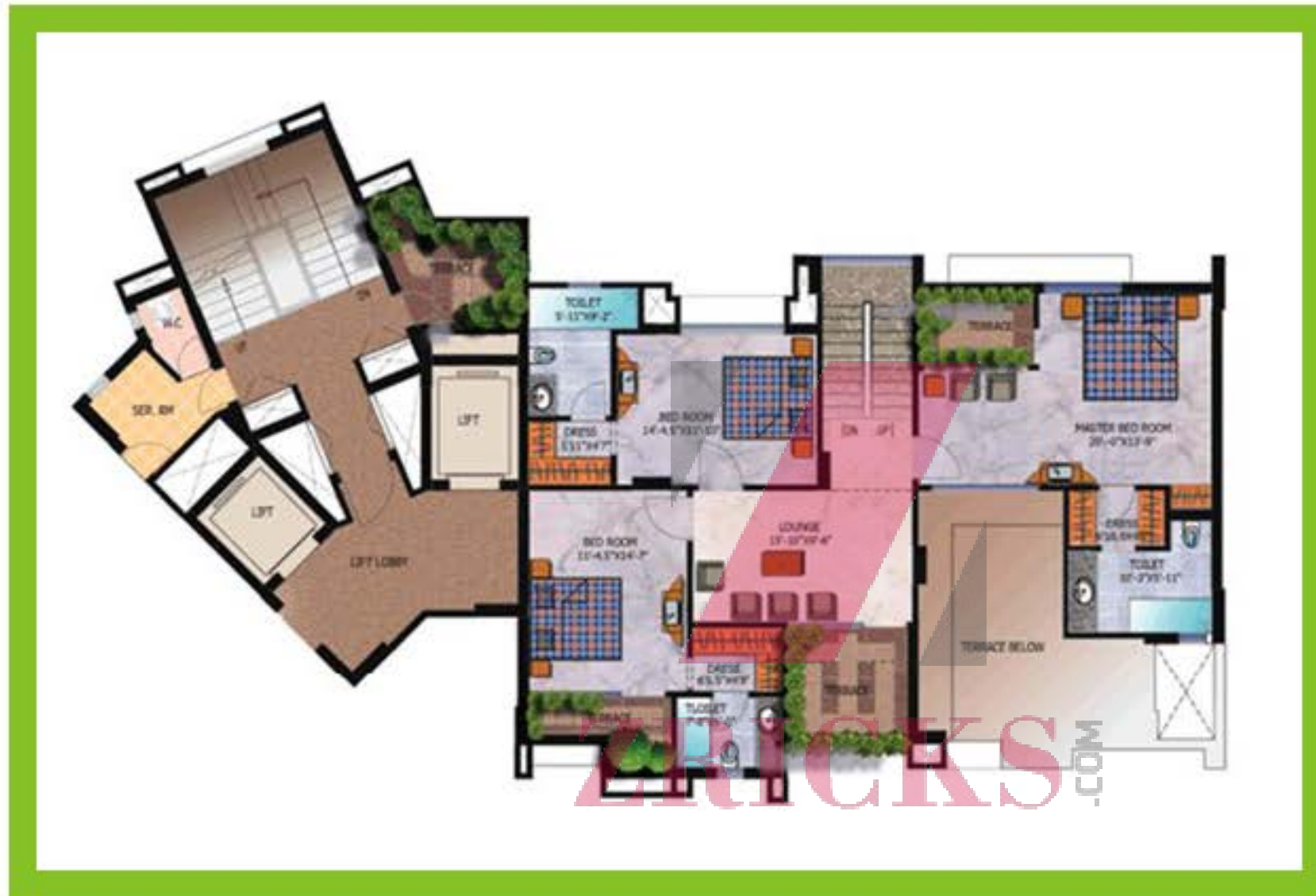
Upper level Pent House Type (C) Above 2350 sq.ft., 4 Bedrooms with Servant Room Area - 4700 sq.ef. + Top Terrace