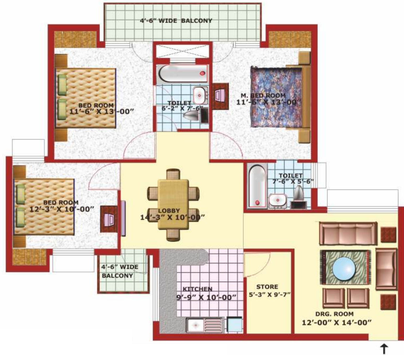
TENTATIVE LAYOUT: 3 BEDROOM FLAT