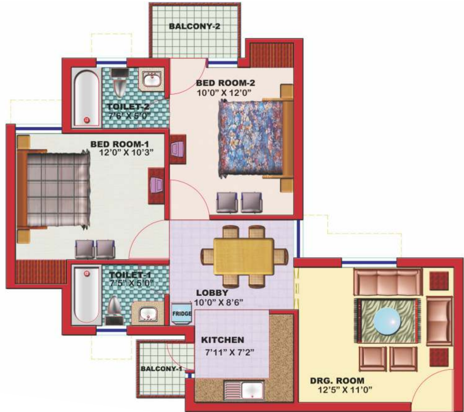
TENTATIVE LAYOUT: 2 BEDROOM FLAT