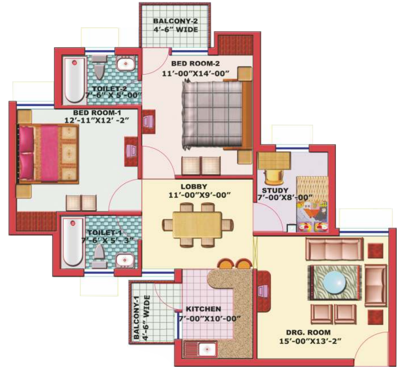
TENTATIVE LAYOUT: 2 BEDROOM FLAT + STUDY