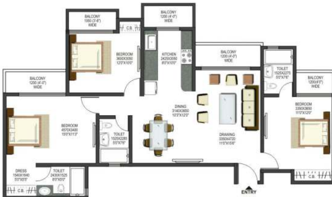
UNIT TYPE: III SUPER AREA : 1560 SQ. FT. BUILT UP AREA : 1257 SQ. FT. • 3 BEDROOMS • DRAWING/DINING • 3 TOILETS • KITCHEN • BALCONIES • DRESS