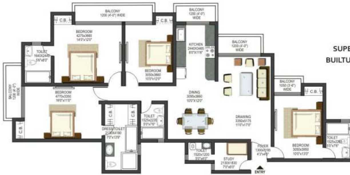
UNIT TYPE: II SUPER AREA : 1735 SQ. FT. BUILT UP AREA : 1377 SQ. FT. • 3 BEDROOMS • DRAWING/DINING • 4 TOILETS • KITCHEN • BALCONIES • STUDY • DRESS