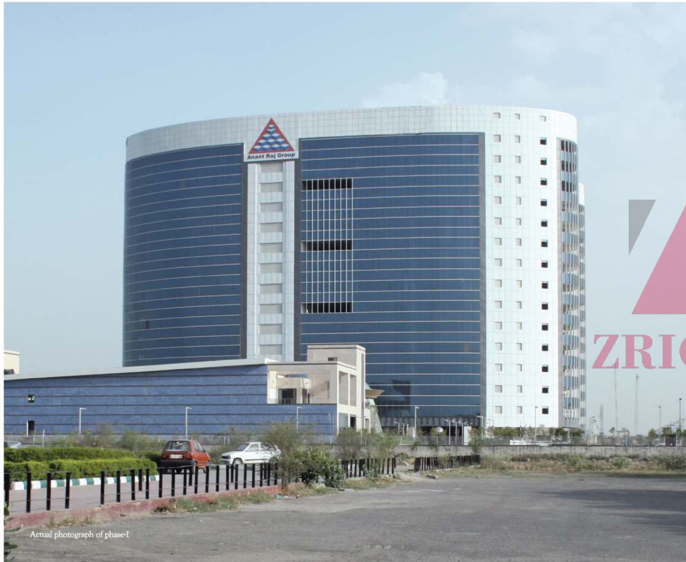
Actual photograph of phase-I