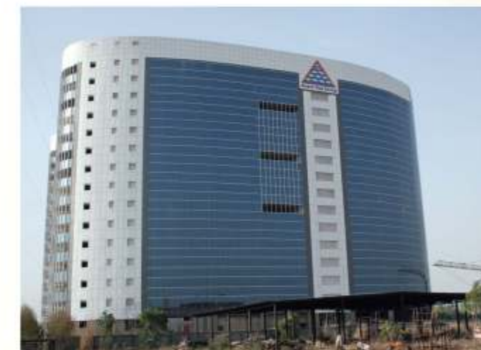
Actual photograph of phase-1

Construction of II & III phase are also underway.