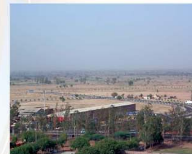
Actual NH-1 view from the building

The area spells high potential value in more ways than one. NH1 is now signal free and there is already a huge impetus owing to the ambitious project "Rajiv Gandhi Education City" including 10 best universities such as IIT (Delhi Extension Centre), IIM etc. and spread over an area of 2000 acres. Experts say that just as IT was a trigger for Gurgaon's growth, education will play a similar role in case of Sonipat. Another development is the IT SEZ in the Rai Industrial Area, which also includes other firms.