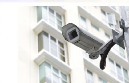
24 hours Security