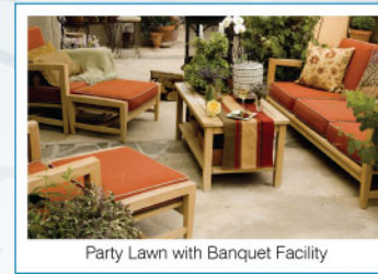
Party Lawn with Banquet Facility