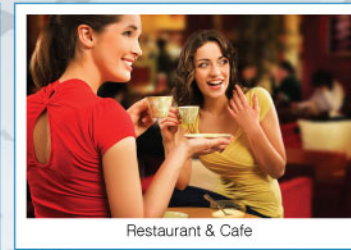
Restaurant & Cafe