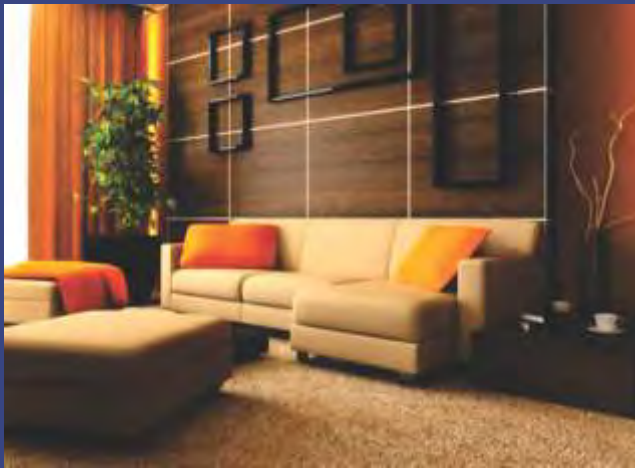
Eclectic living spaces