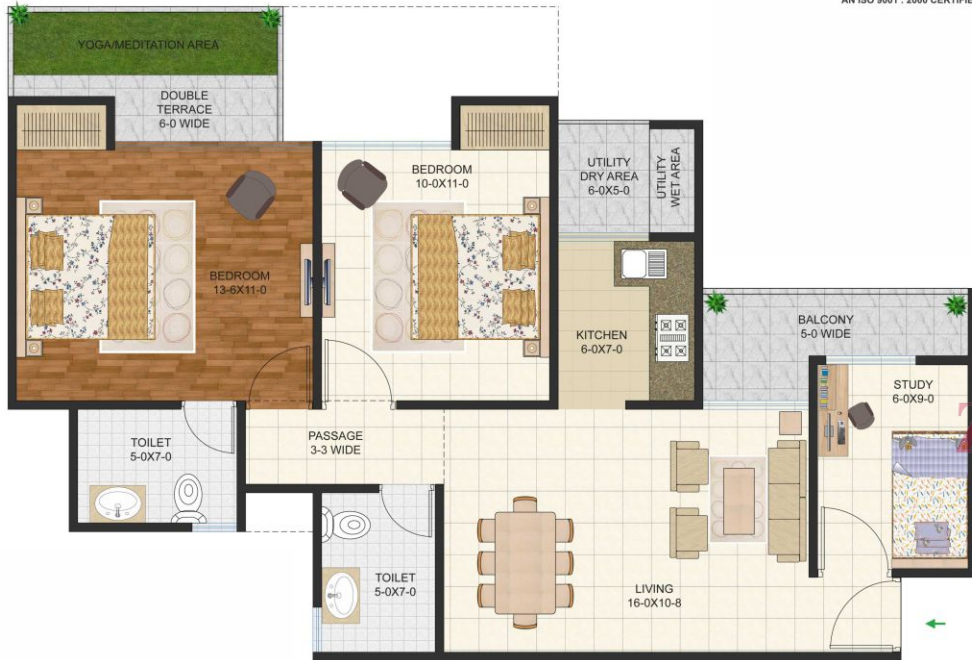
2 BHK + STUDY DOUBLE HEIGHT TERRACE HOMES