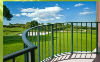
Double height terrace with grand view