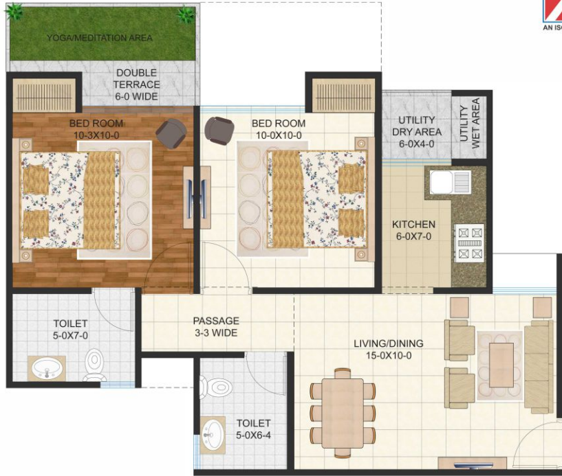
2 BHK DOUBLE HEIGHT TERRACE HOMES