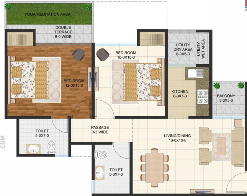
2 BHK DOUBLE HEIGHT TERRACE HOMES