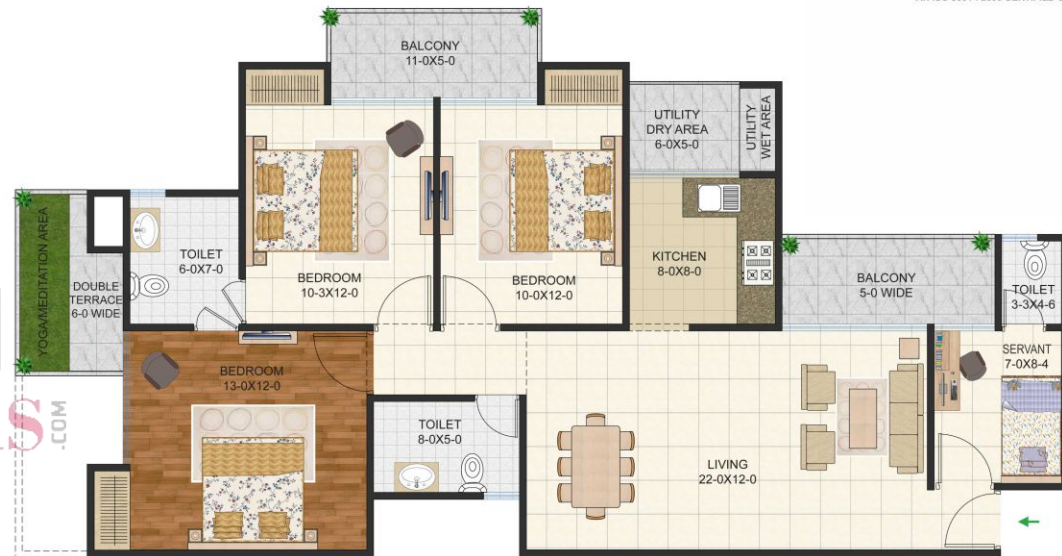
3 BHK + SERVANT DOUBLE HEIGHT TERRACE HOMES