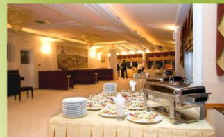
Community hall for family functions