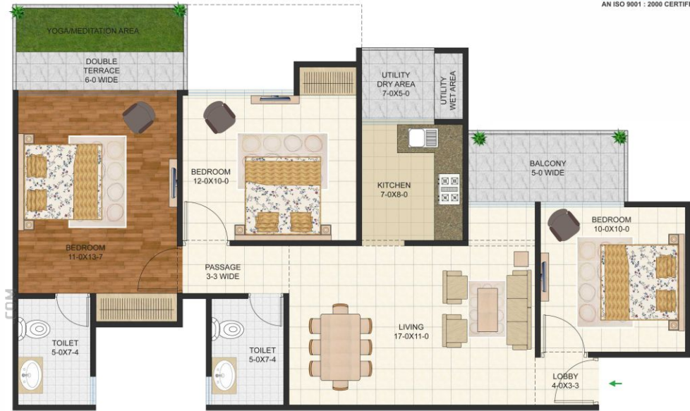
3 BHK DOUBLE HEIGHT TERRACE HOMES