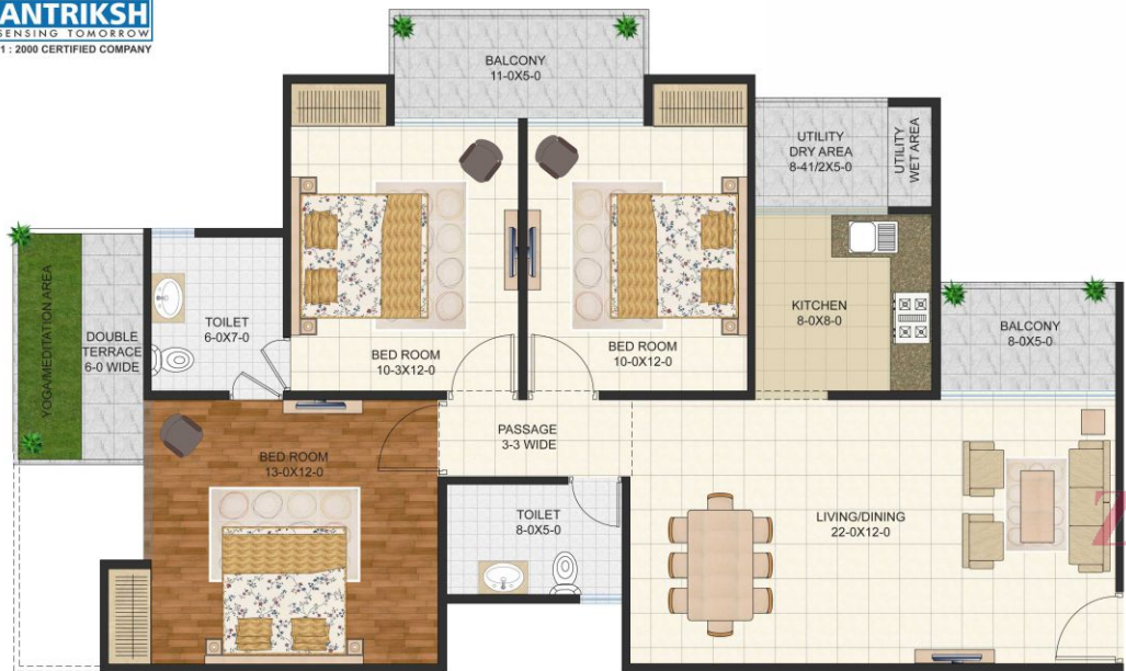
3 BHK DOUBLE HEIGHT TERRACE HOMES