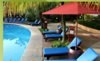
Open air swimming pool