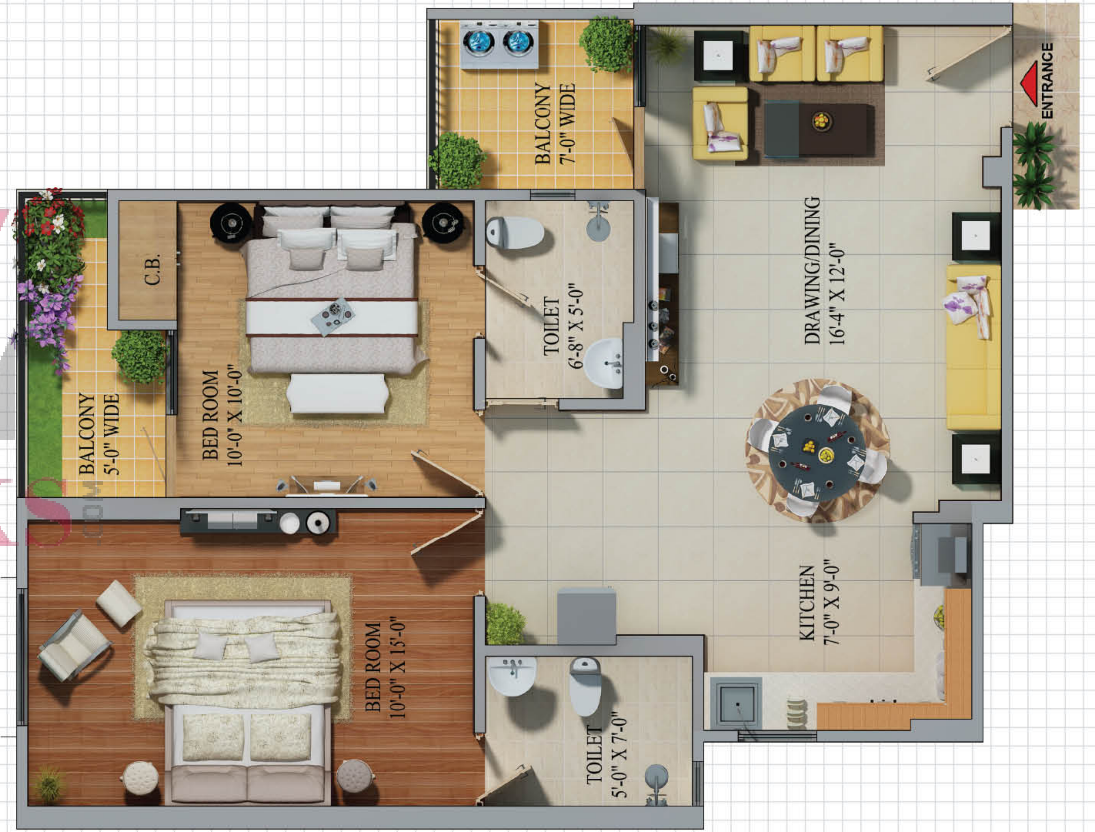
2 BHK 2 Bedrooms + Drg./Din. Room + Kitchen + 2 Toilets + 2 Balconies Area -1325 sq. ft.