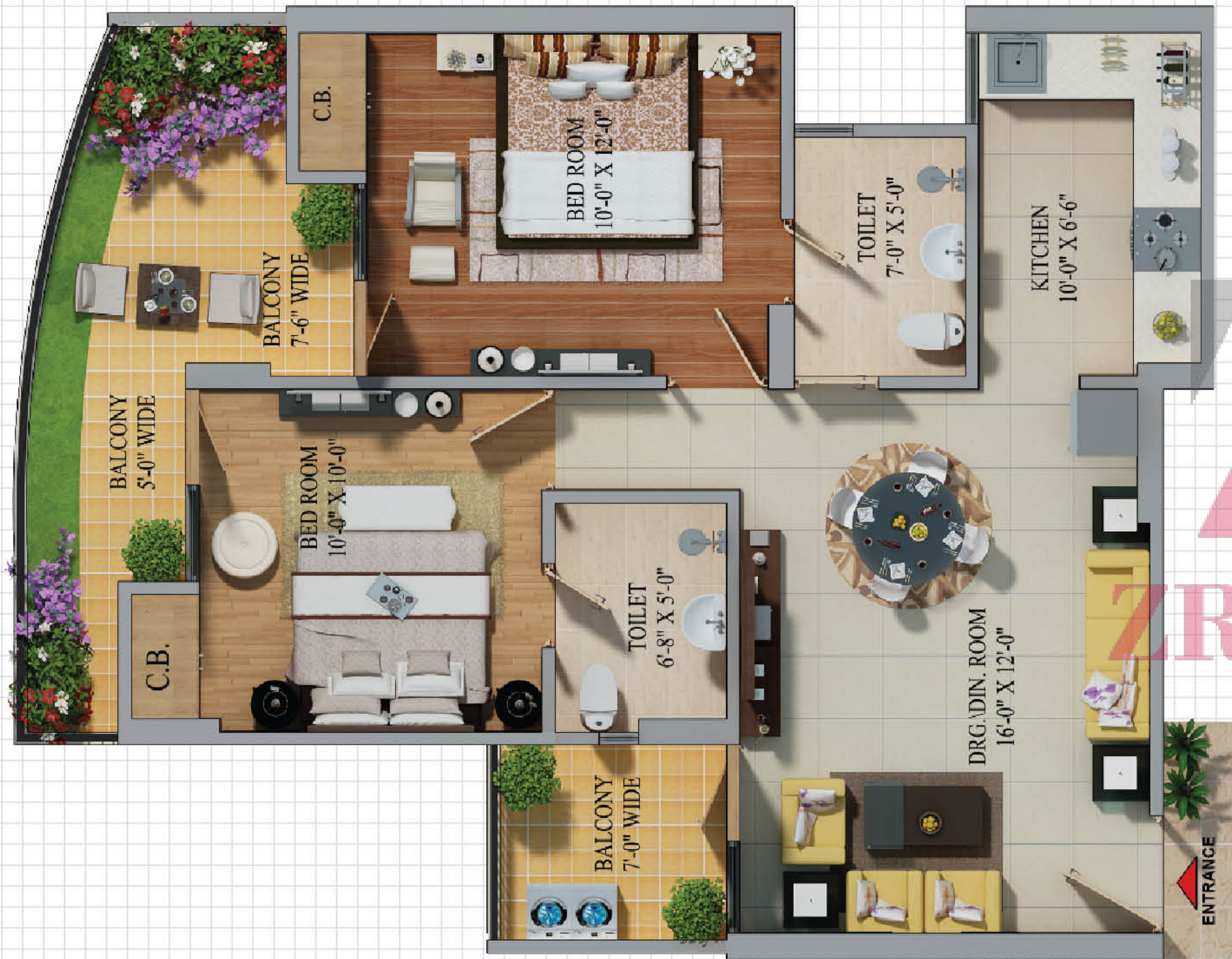
2 BHK 2 Bedrooms + Drg./Din. Room + Kitchen + 2 Toilets + 3 Balconies Area -1355 sq. ft.