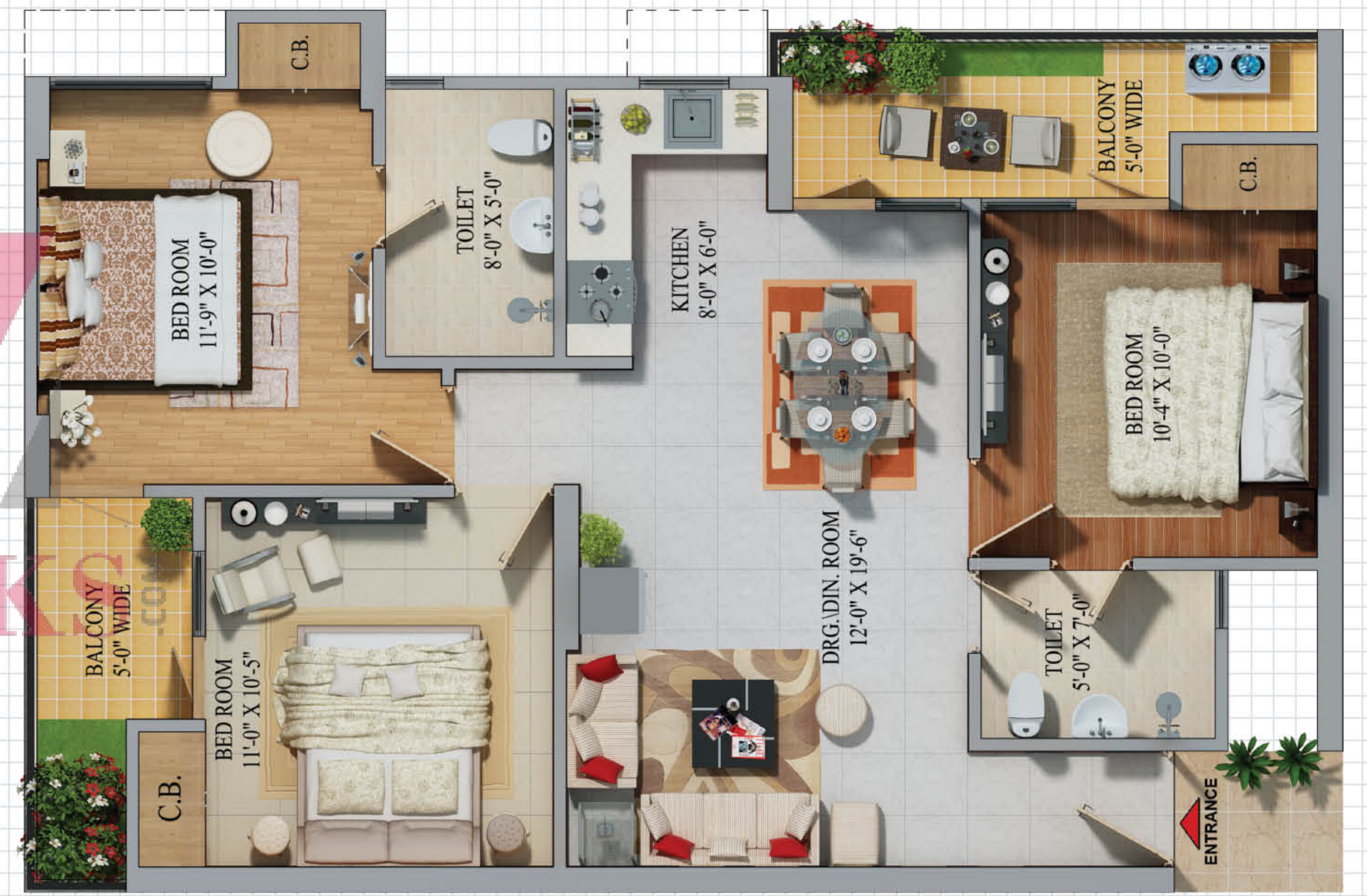
3 BHK 2 Bedrooms + Drg./Din. Room + Kitchen + 2 Toilets + 2 Balconies Area -1550 sq. ft.