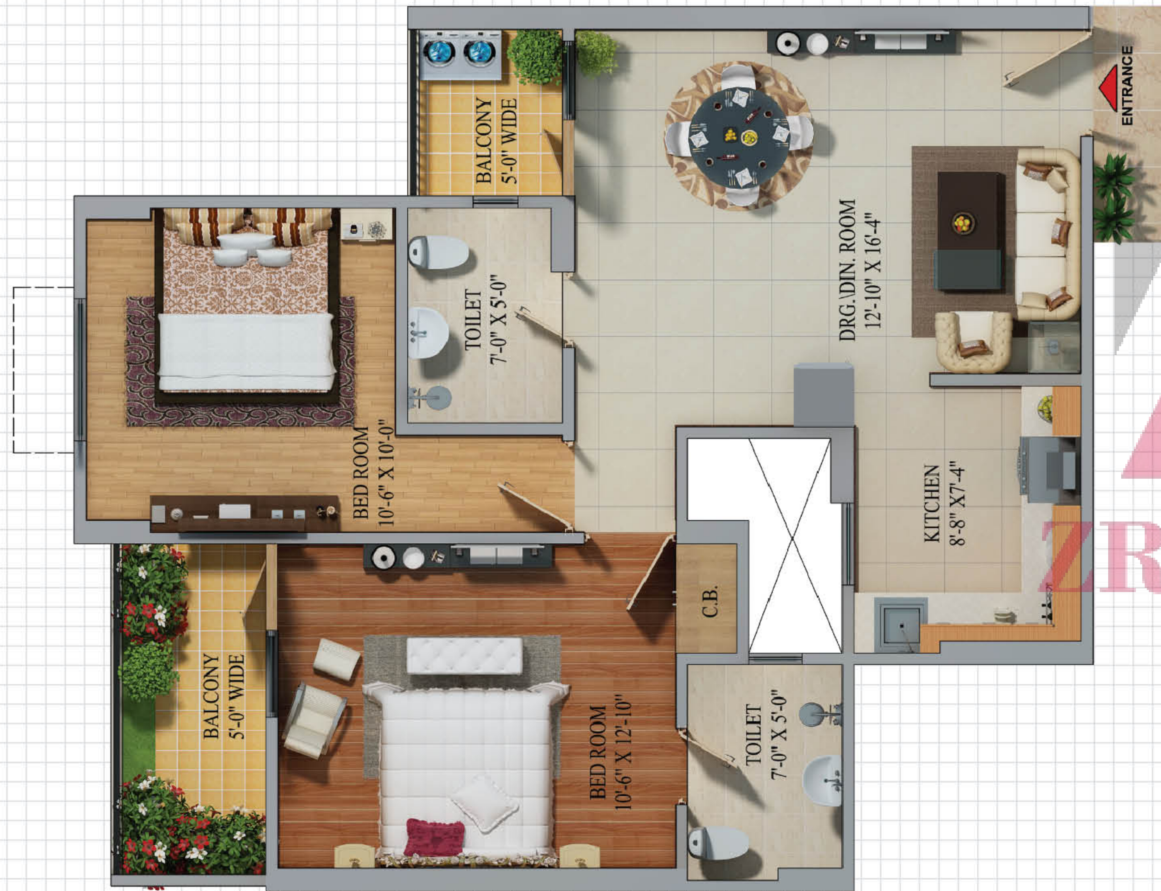
2 BHK 2 Bedrooms + Drg./Din. Room + Kitchen + 2 Toilets + 2 Balconies Area -1275 sq. ft.