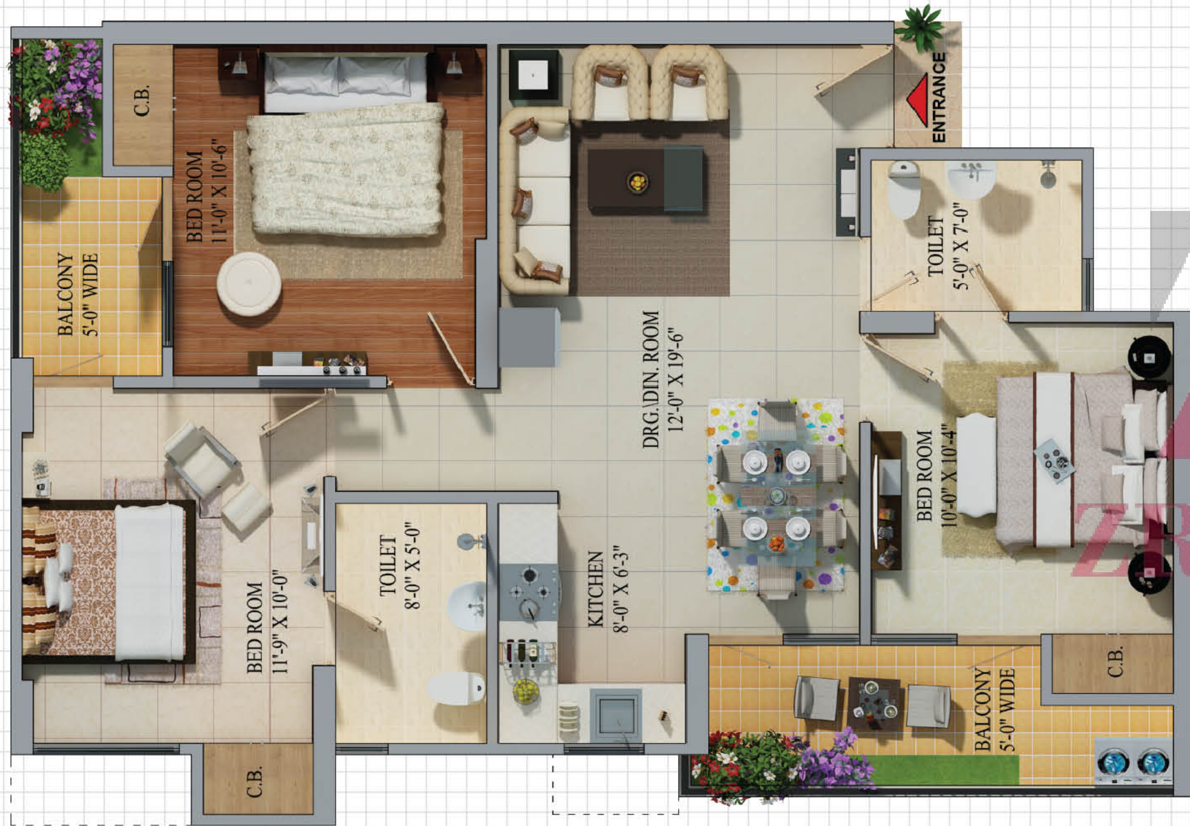
3 BHK 2 Bedrooms + Drg./Din. Room + Kitchen + 2 Toilets + 2 Balconies Area -1515 sq. ft.