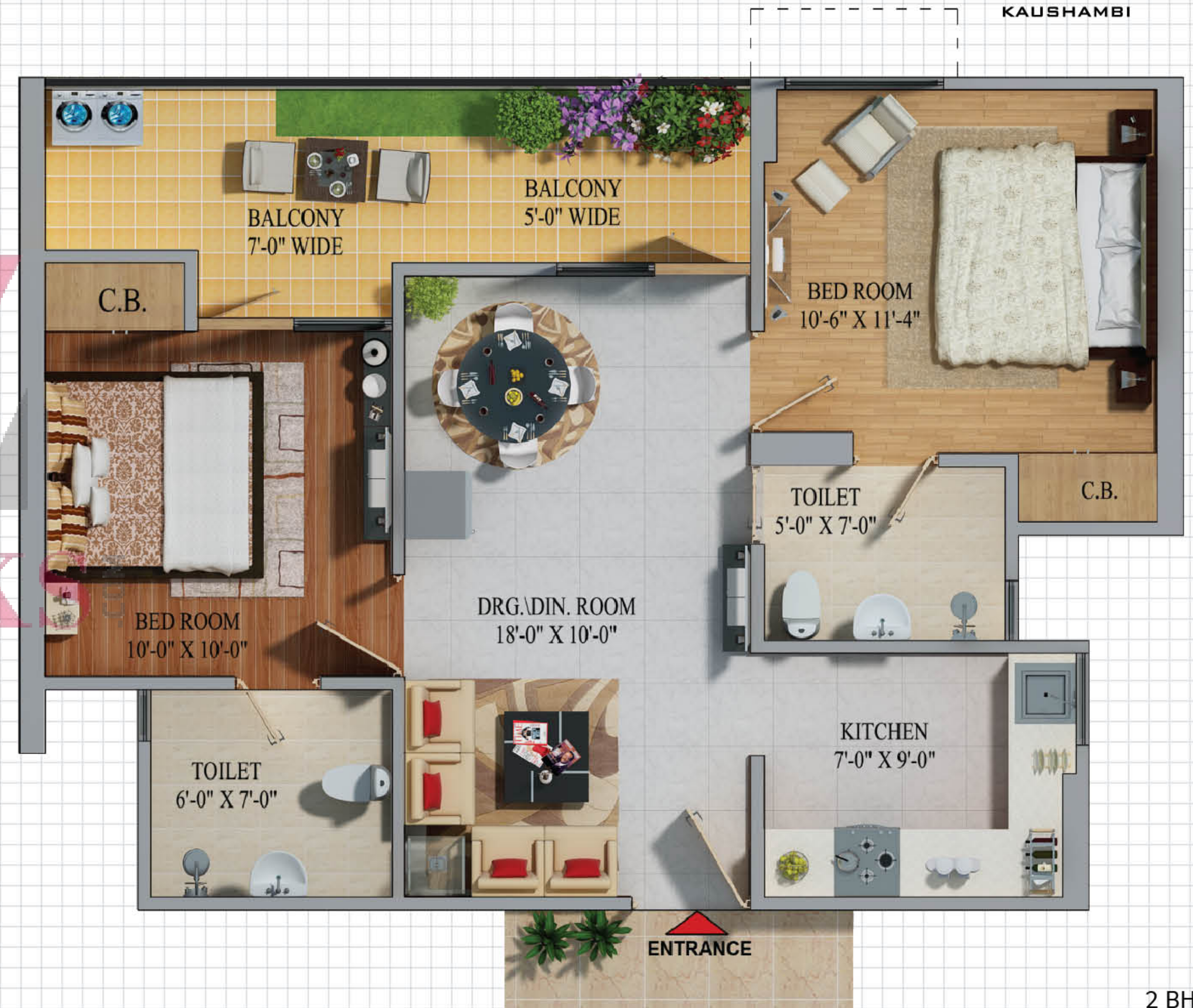
2 BHK 2 Bedrooms + Drg./Din. Room + Kitchen + 2 Toilets + 2 Balconies Area -1235 sq. ft.