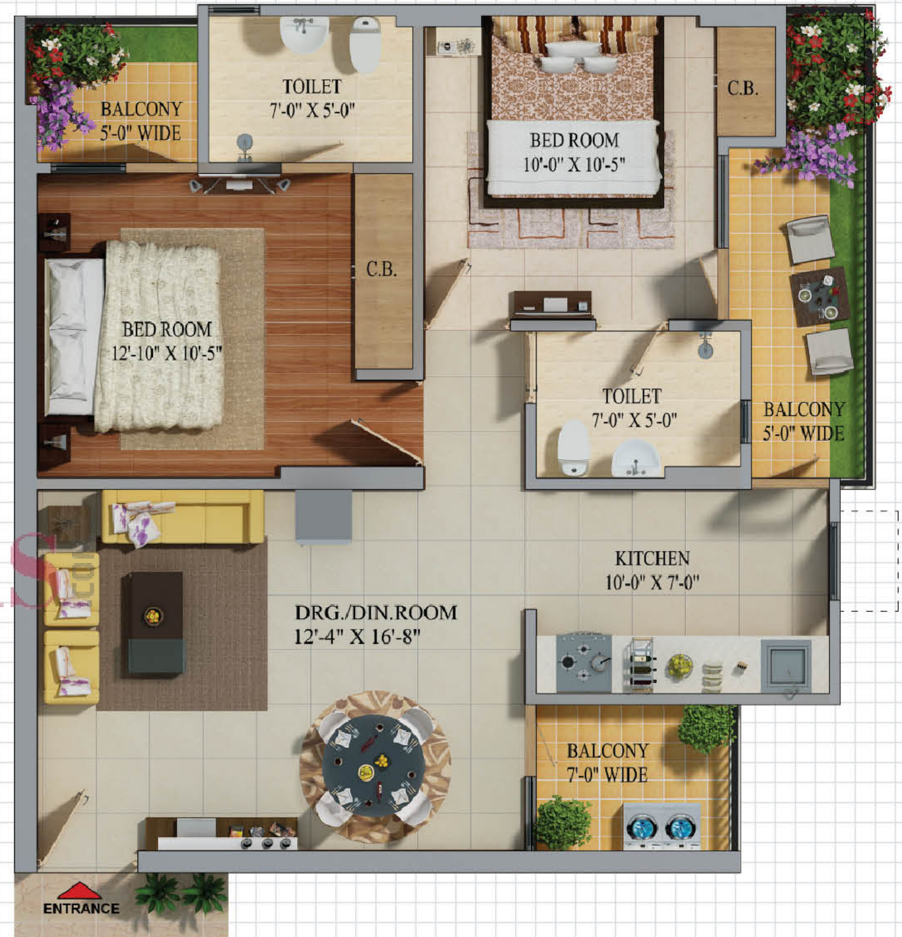
2 BHK 2 Bedrooms + Drg./Din. Room + Kitchen + 2 Toilets + 3 Balconies Area -1370 sq. ft.