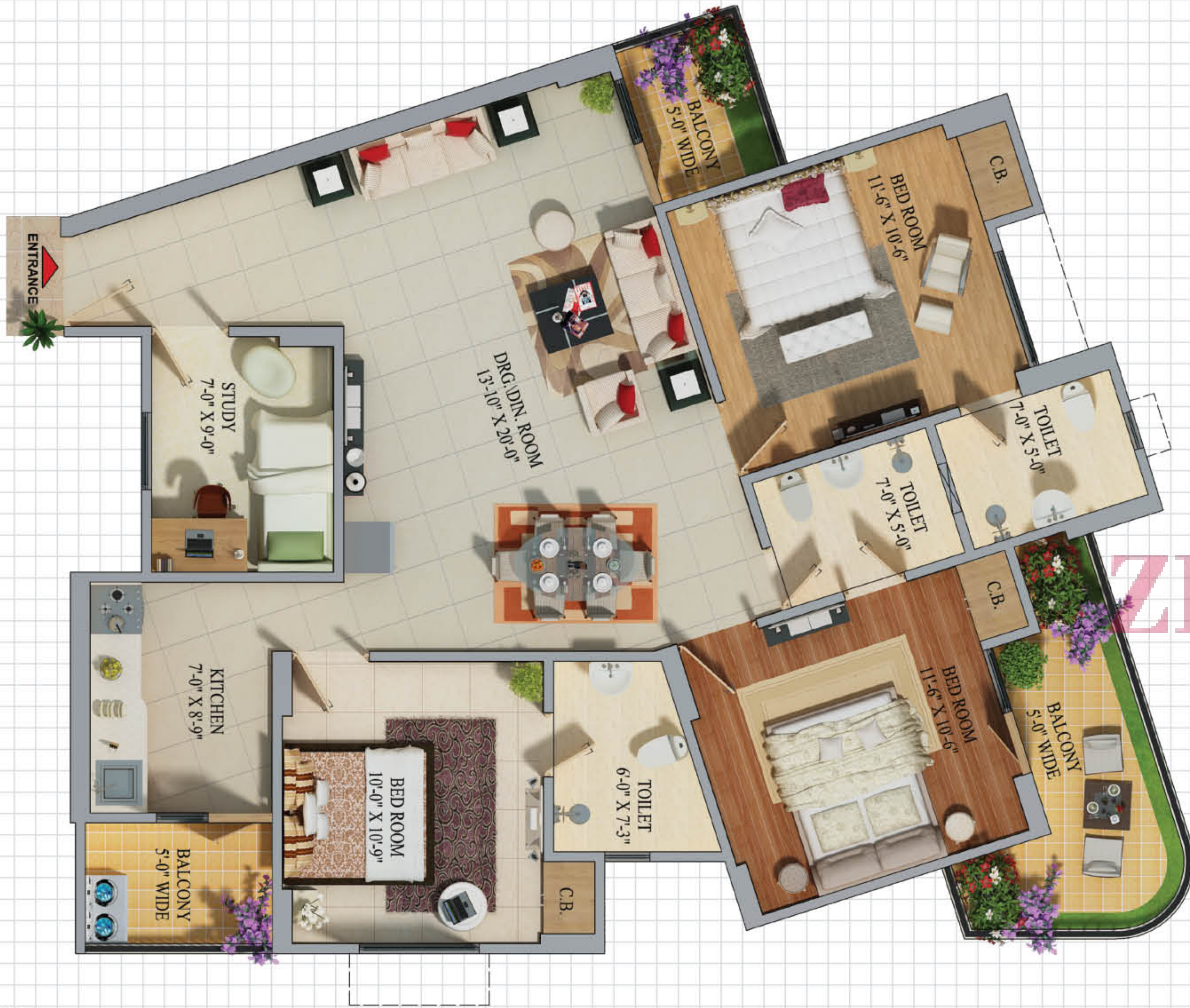
3 BHK 2 Bedrooms + Drg./Din. Room + Kitchen + 3 Toilets + 3 Balconies Area -2000 sq. ft.