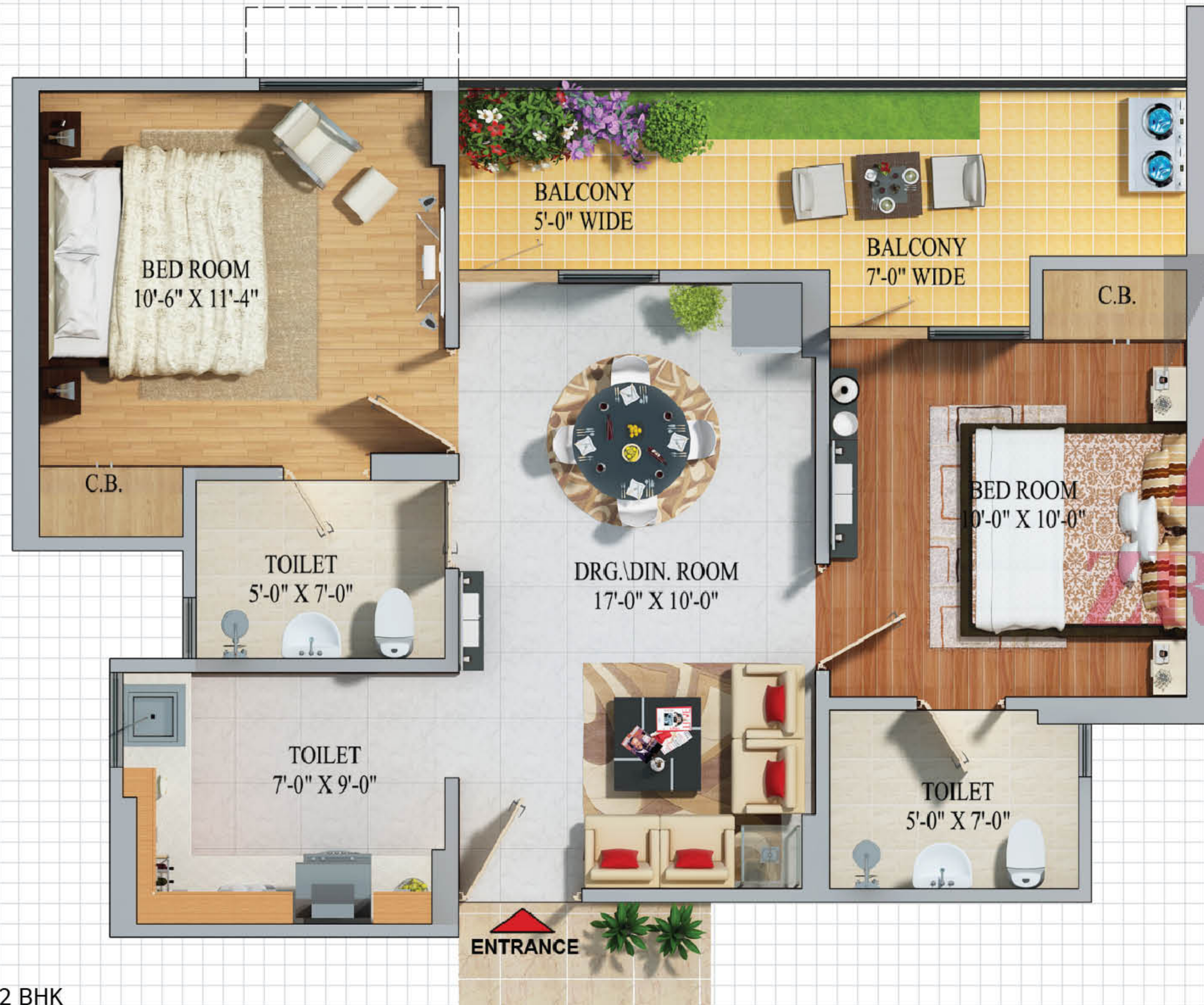
2 BHK 2 Bedrooms + Drg./Din. Room + Kitchen + 2 Toilets + 2 Balconies Area -1210 sq. ft.