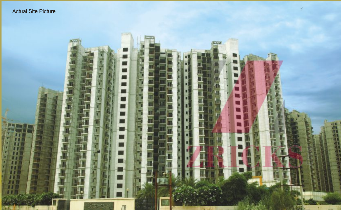
ACTUAL SITE PICTURE