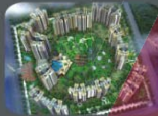
Logix Blossom County