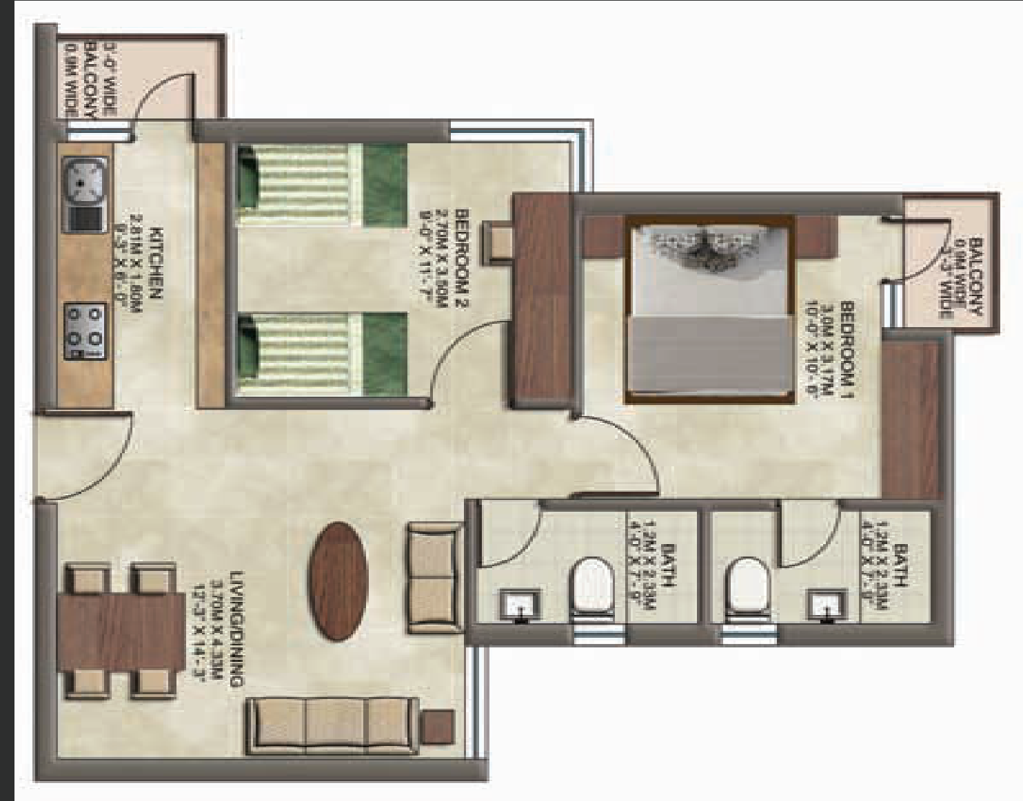
Typical Floor Plan - 2 BHK Super Area - 808 sq.ft.