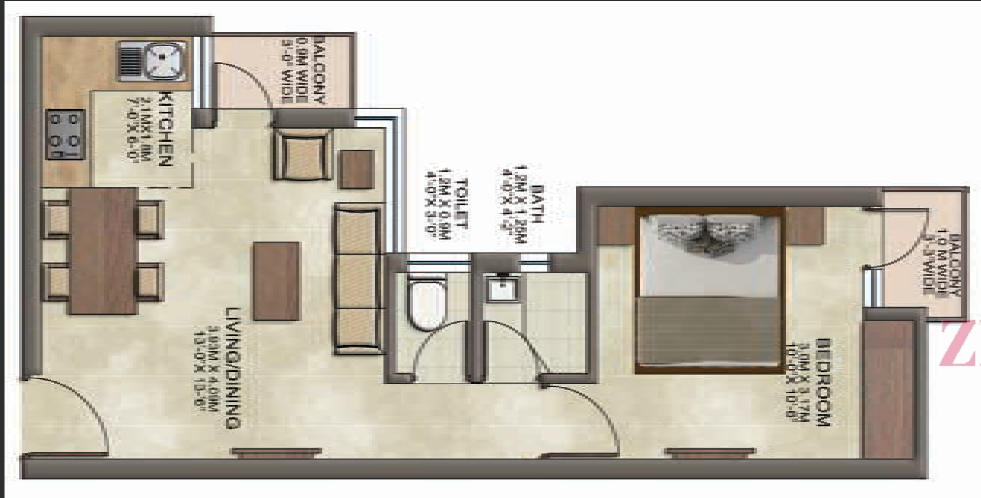
Typical Floor Plan - 1BHK Super Area - 578 sq.ft.