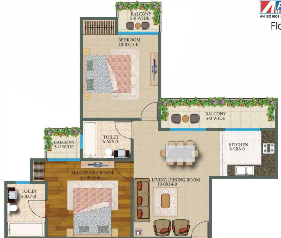
TYPE A - 2 BHK SUPER AREA : 900 SQ. FT.