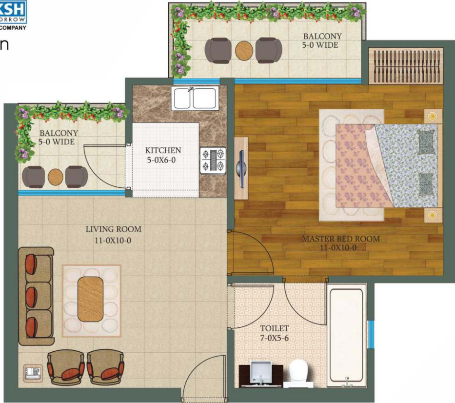
TYPE E - 1 BHK SUPER AREA : 575 SQ. FT.