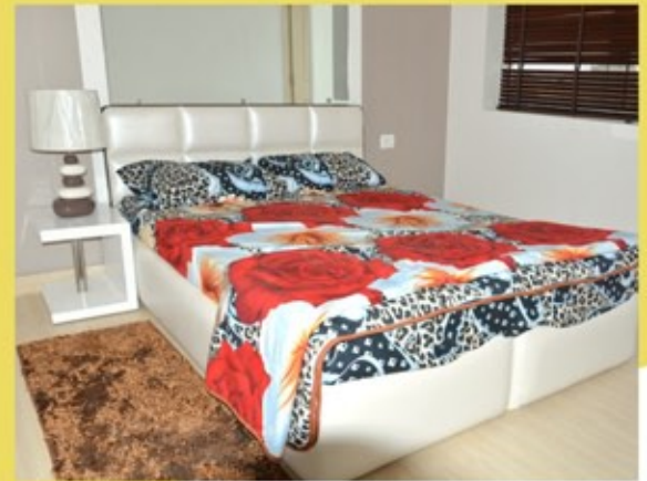
Actual pictures of sample apartments