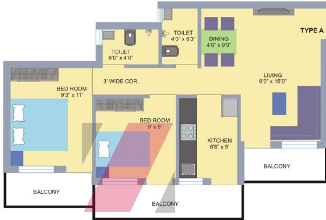
2BHK (834 sq.ft.)