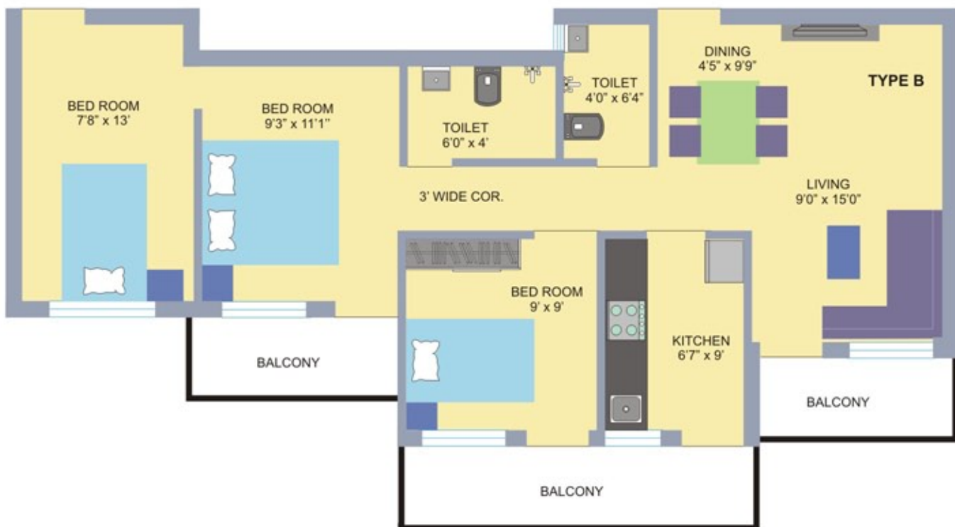
3BHK (964 sq.ft.)