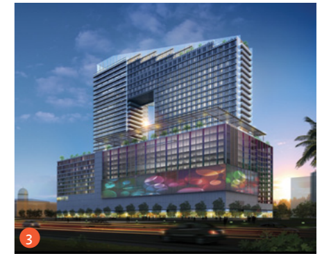
Wave One – Sec 18 Noida