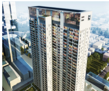
Multi-Use Commercial Studio Apartments