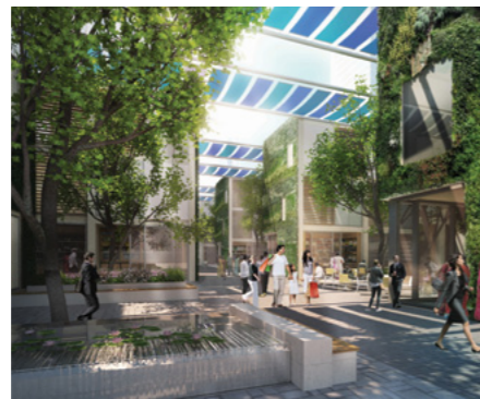
High Street Shop Condominiums