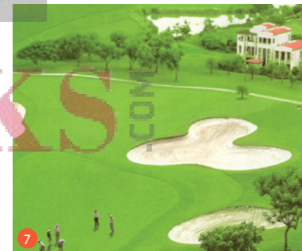
Noida Golf Course