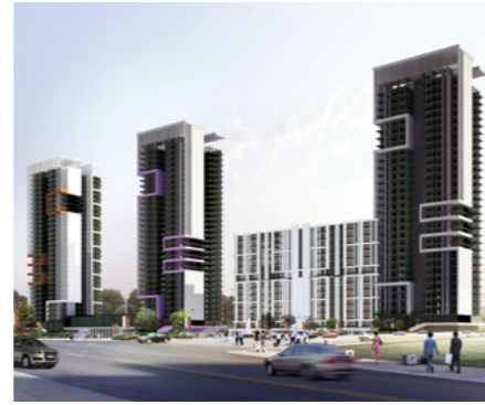
Premium Serviced Residences