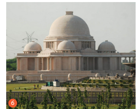
Noida Memorial Park