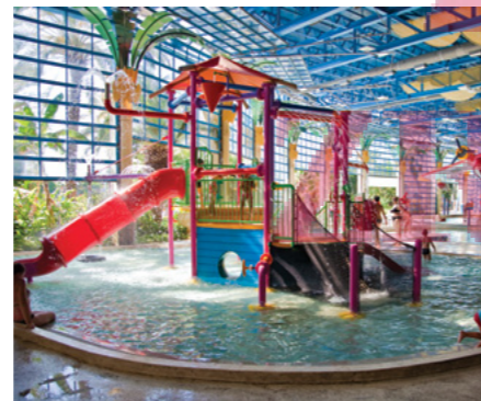
Indoor Water Park