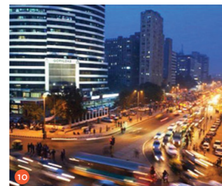
Towards Connaught Place