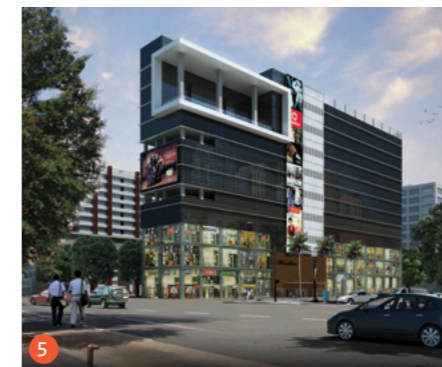
Wave 1st Silver Tower – Sec 18 Noida