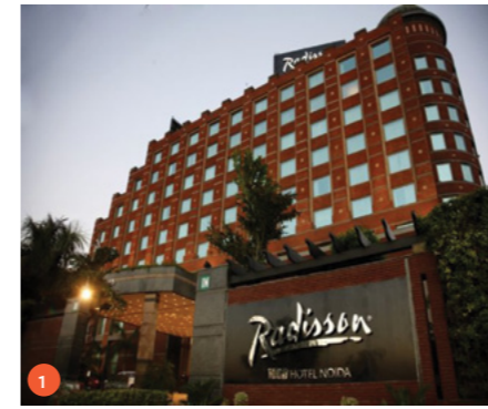
Radisson Hotel – Sec 18 Noida

*All distances mentioned above are crow fly distances.