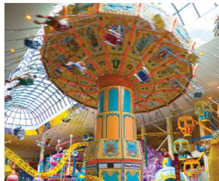
Family Entertainment Center