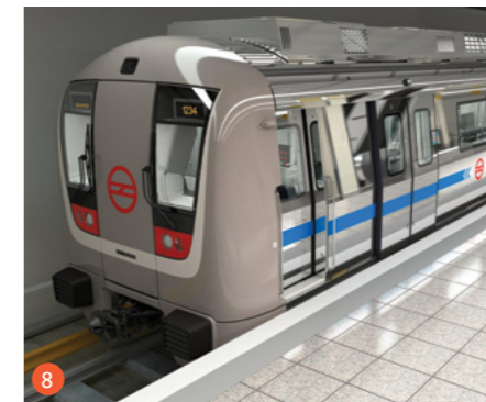
Noida City Center Metro Station