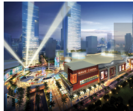
Mall & Multiplexes