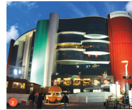
The Center Stage Mall – Sec 18 Noida