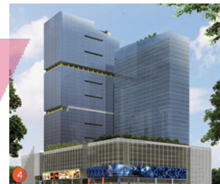
Wave Eleven – Sec 18 Noida