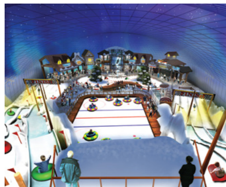
Indoor Snow Park

Disclaimer: 1 sq mtr. = 10.764 sq ft. 1 acre = 4046.856 sq mtr. The company and the architects reserve absolute right to change /revise/ delete/ omit any detail, specification, material, design, drawing, layout, finishes, etc. as they deem fit without any notice. The company further reserves absolute right to withdraw, change, omit, delete, add, revise any terms and conditions at any time without giving any notice. Please refer to latest publications for current information as terms and conditions, design, specification, etc. may be revised from time to time by the company. All images are artistic impressions and figures mentioned are indicative and are subject to change in the best interests of the development. The company shall not be responsible for any decision made by the buyer, therefore they are requested to ascertain all the facts at their end before making any decision/ application for allotment/ purchase etc. This publication shall not be construed any way as a legal offering.