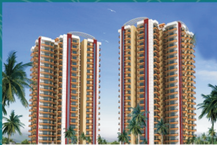
Grace Sector - 61, Noida