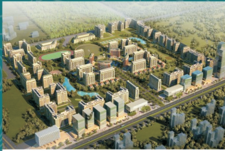
Golf City Sector - 75, Noida