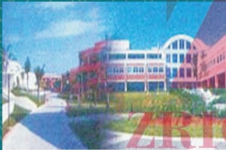
Hi-Tech City, Jaipur