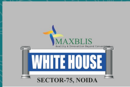
White House, Sector - 75, Noida