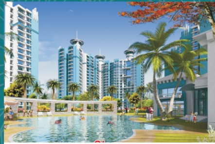
Glory Sector-46, Noida