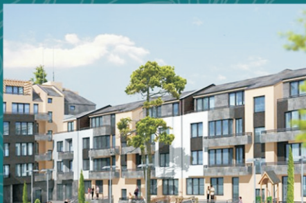
Aranya Vihar, Patna