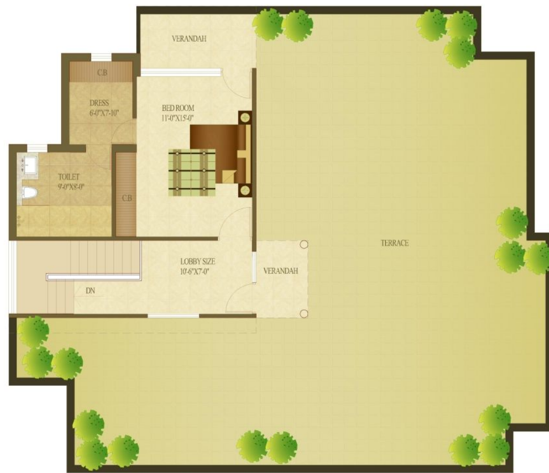
Duplex Penthouse Upper Unit Area of upper unit - 1510 sq.ft. (140.28 sq.mtr.) approx.