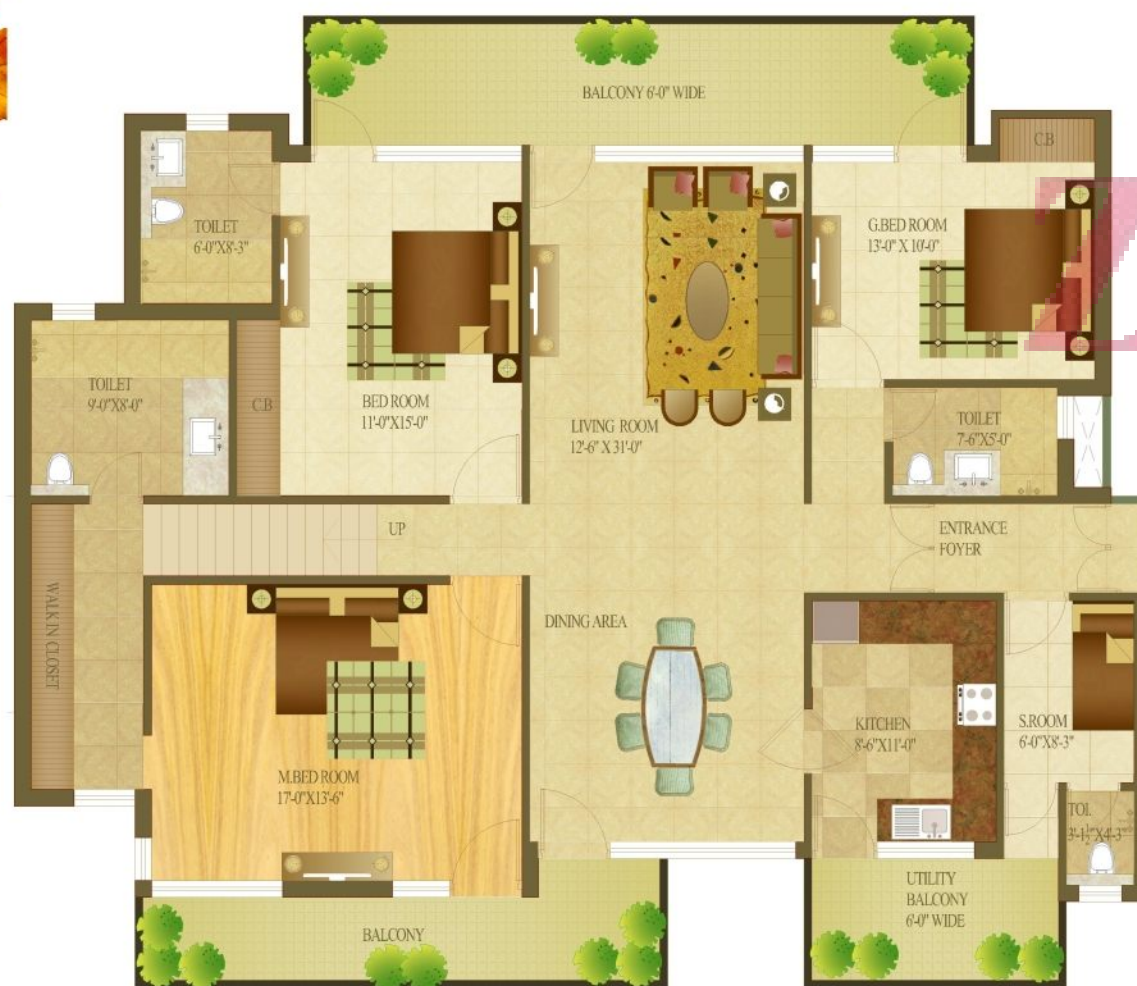
Duplex Penthouse Lower Unit Area of lower unit - 2500 sq.ft. (232.25 sq.mtr.) approx.