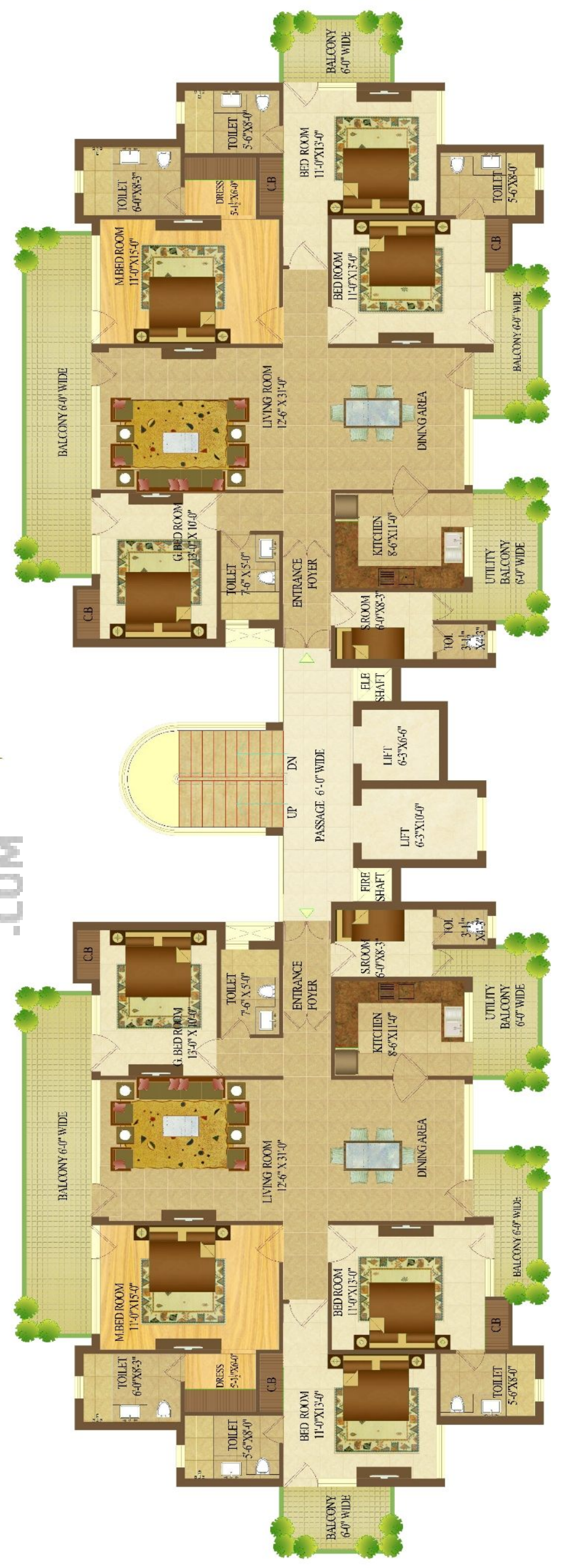
4 BHK + Servant Room Area of one unit - 2490 sq.ft. (231.32 sq.mtr.) approx.