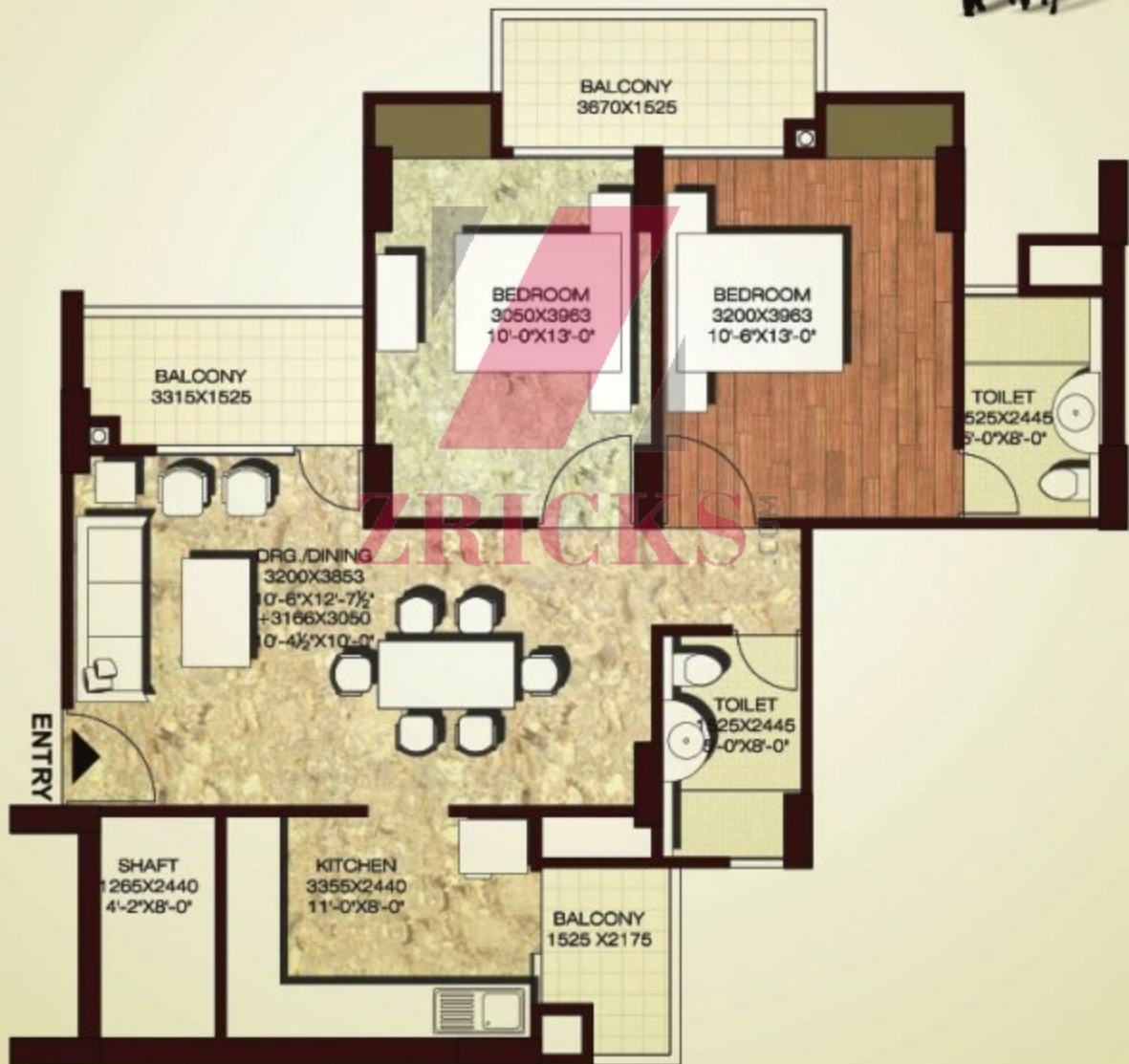
TYPE-6 : AREA = 1290 SQ. FT. 2 BHK · 2 TOILETS