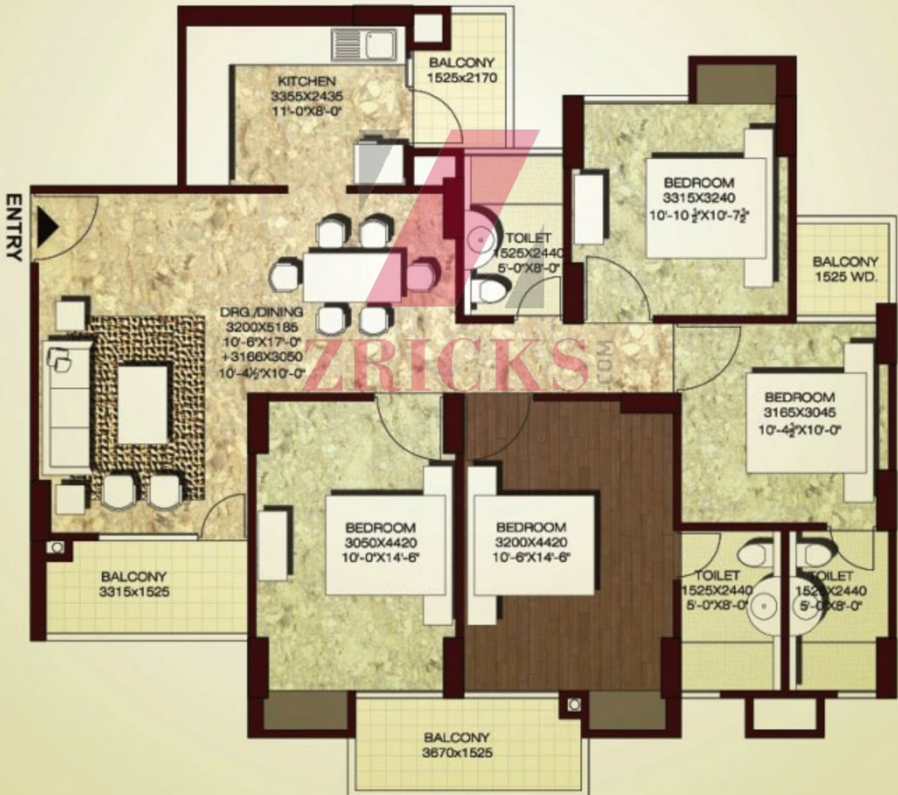
TYPE-1 : AREA = 1895 SQ. FT. 4 BHK · 3 TOILETS