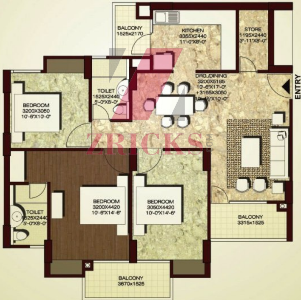
TYPE-3 : AREA = 1685 SQ. FT. 3 BHK · 2 TOILETS · 1 STORE