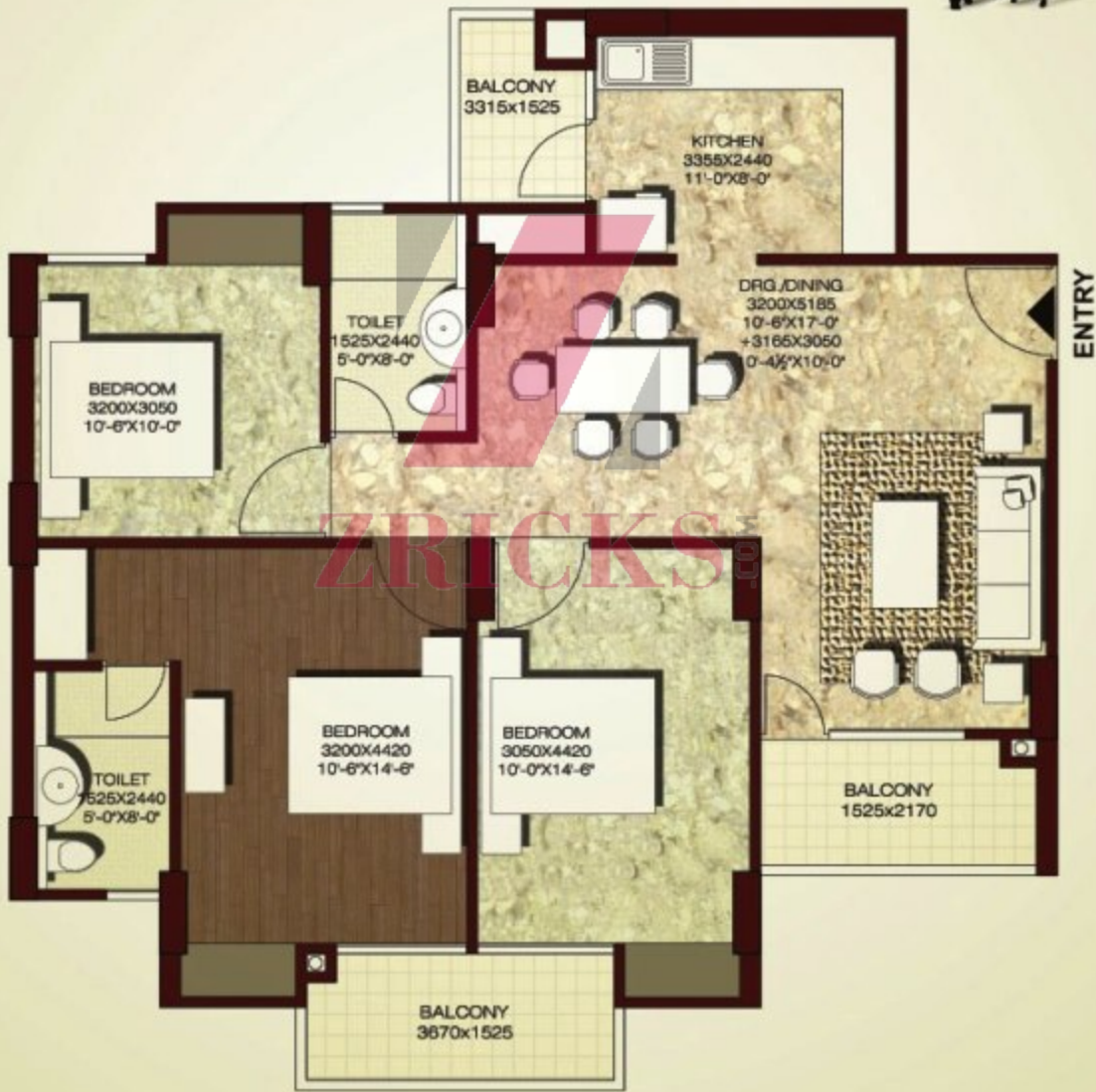
TYPE-4 : AREA = 1635 SQ. FT. 3 BHK · 2 TOILETS