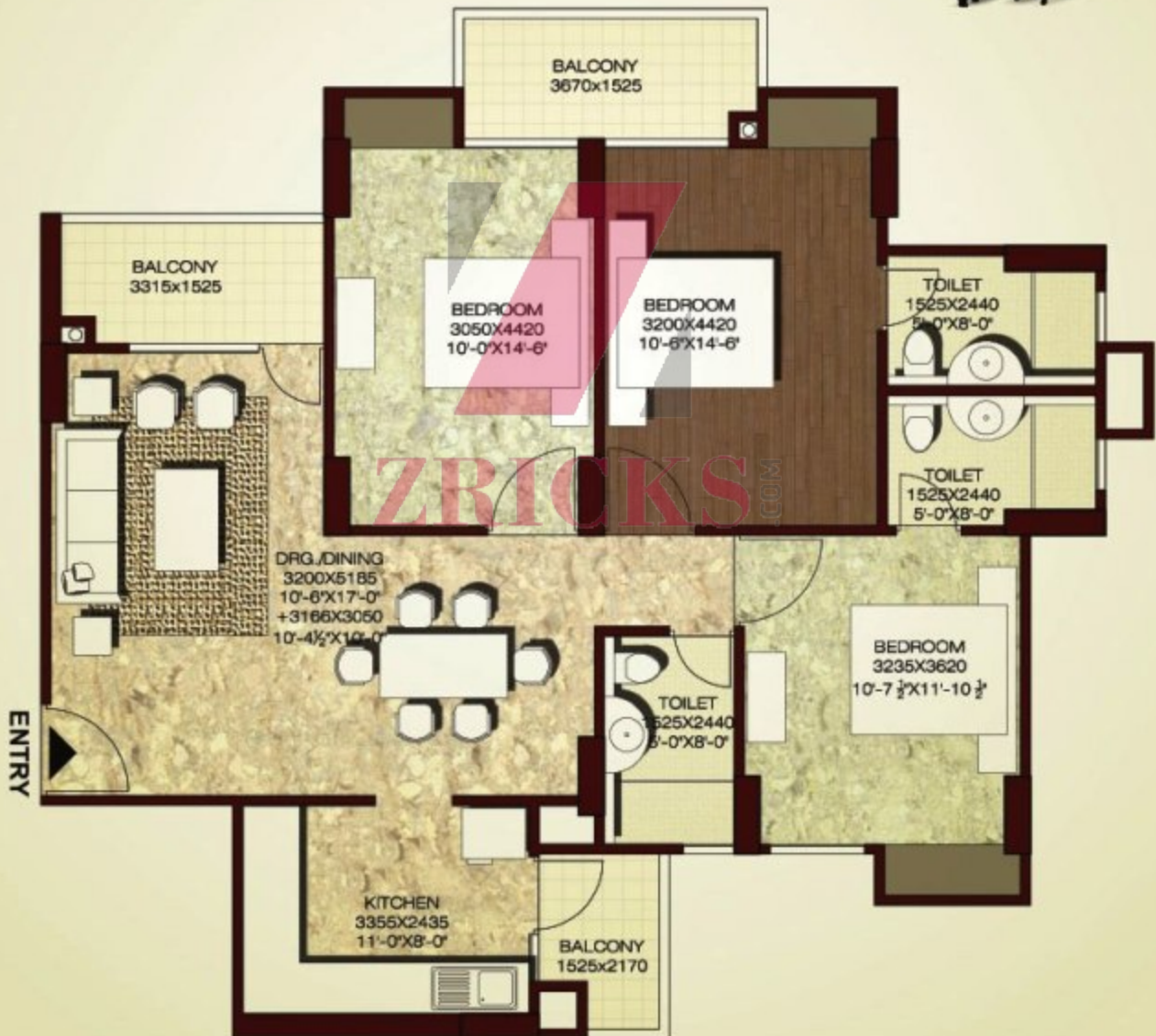
TYPE-2 : AREA = 1685 SQ. FT. 3 BHK · 3 TOILETS