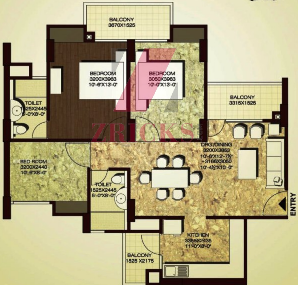
TYPE-5 : AREA = 1395 SQ. FT. 3 BHK · 2 TOILETS