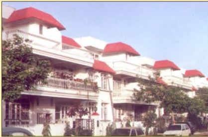
Villas in Eros Garden