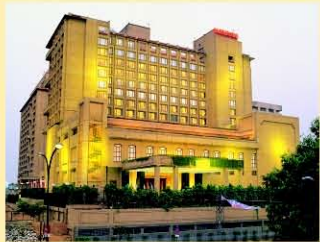
Intercontinental Eros, Nehru Place, New Delhi