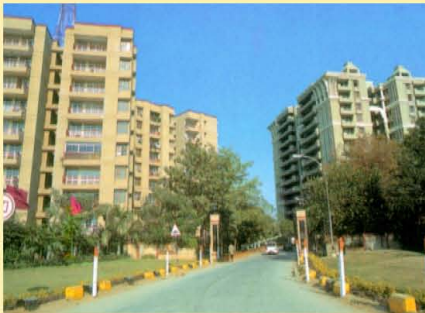
Entrance to Charmwood Village