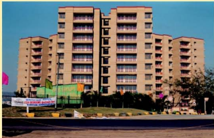
Belvedere Tower, Charmwood Village