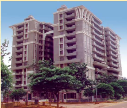
Royale Retreat, Charmwood Village

Charmwood Village, on Suraj Kund Road in continuation of posh New Delhi colonies, is fast developing as the finest residential township. For reasons that become obvious to even a cursory visitor to the complex.