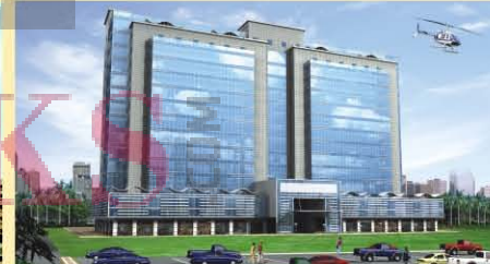
Eros Corporate Park