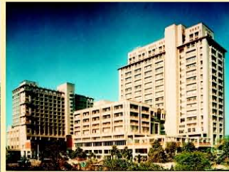
International Trade Tower, Nehru Place