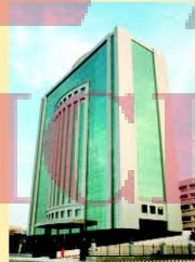
Eros Corporate Tower