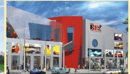
EF3 Shopping Mall