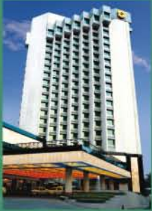
Shangri-La's Eros Hotel Ashoka Road, New Delhi