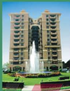
Royale Retreat Charmwood Village, SurajKund Road, Faridabad