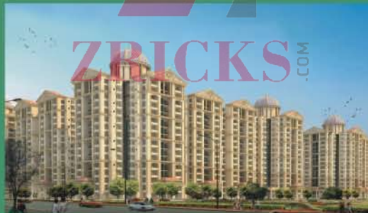
Eros Sampoornam Greater Noida