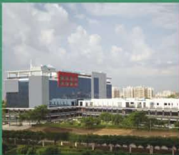
Eros City Square Rosewood City, Sector 49-50, Gurgaon