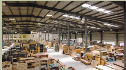
Sobha Interiors Division