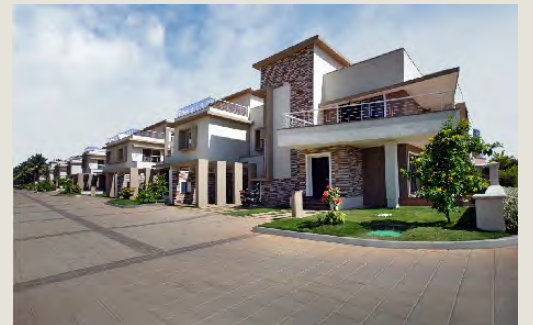
Sobha Azalea, Bangalore