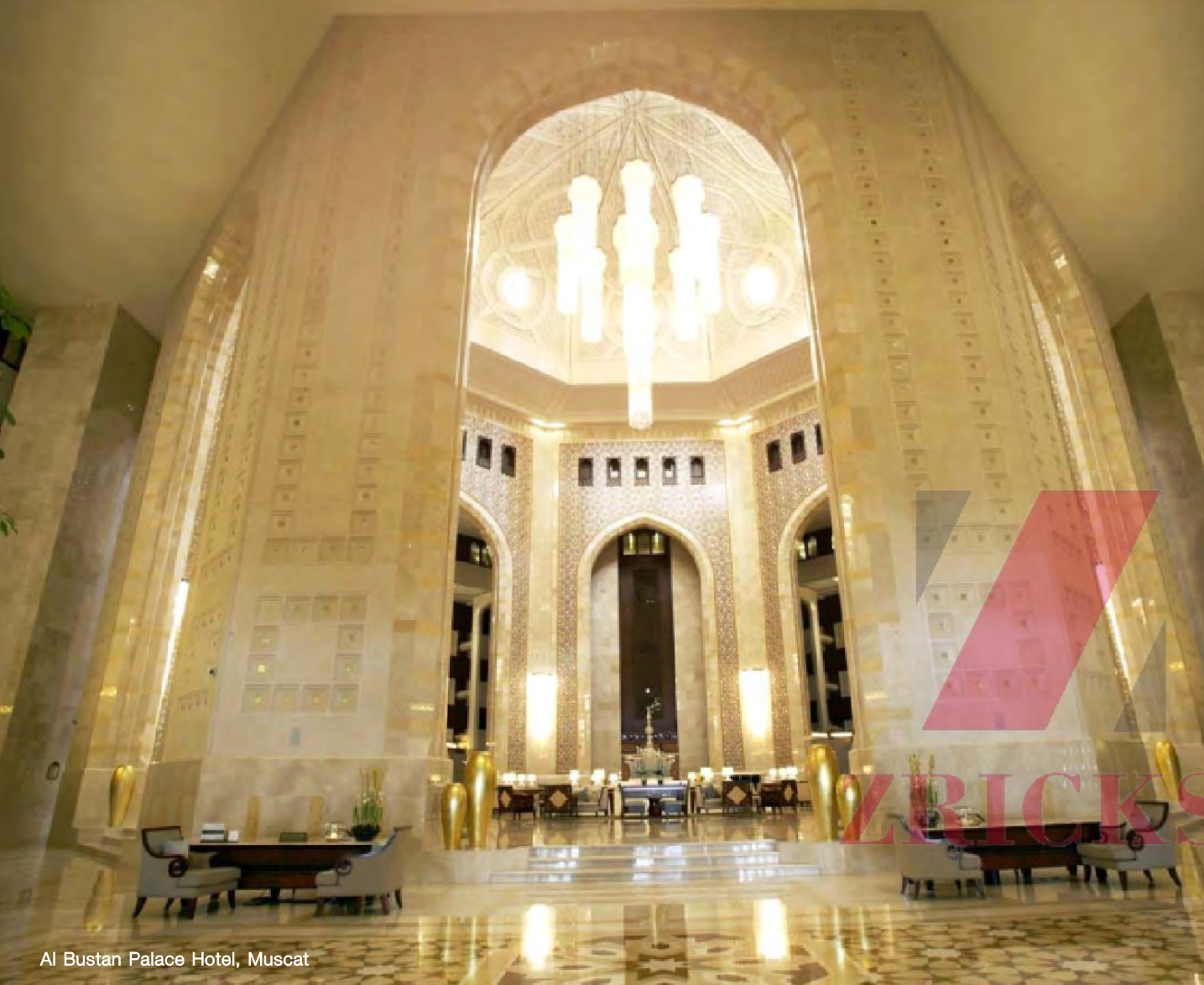
Al Bustan Palace Hotel, Muscat