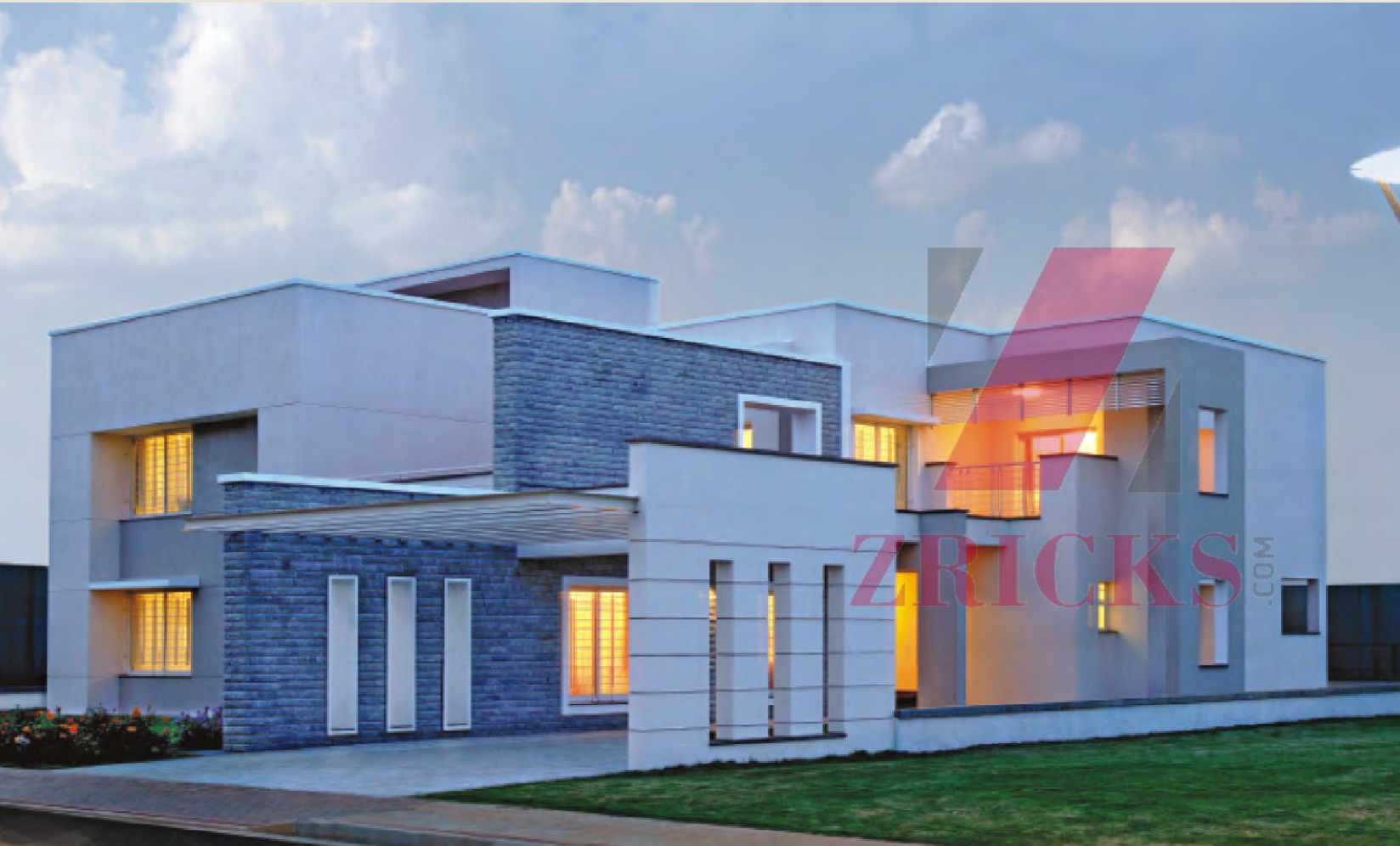
Sobha Lifestyle, Bangalore