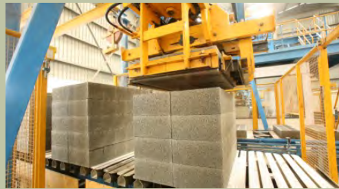
Sobha Concrete Block Division

to ensure nothing less than the best, we do it ourselves