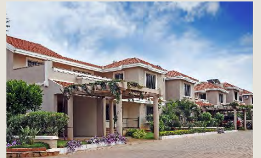
Sobha Malachite, Bangalore