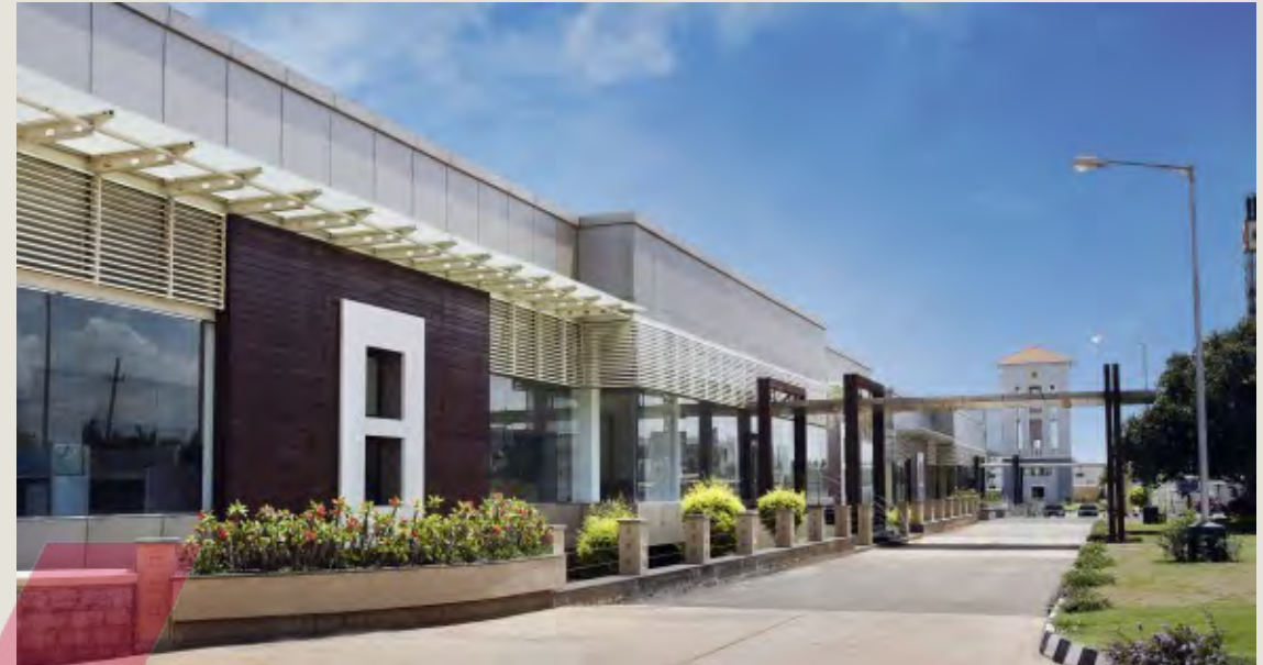
Sobha Manufacturing Unit