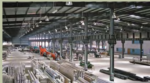
Sobha Metal & Glazing Division