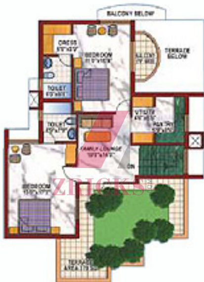
TYPE - PIII