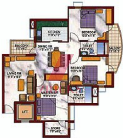
TYPE - BI