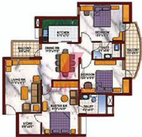
TYPE - BI