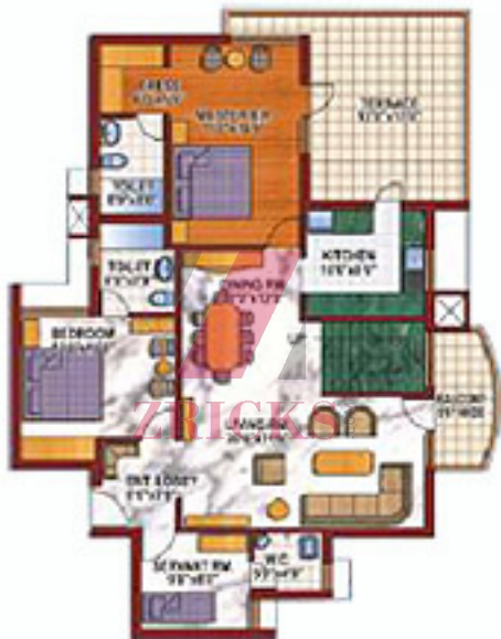
TYPE - PIII