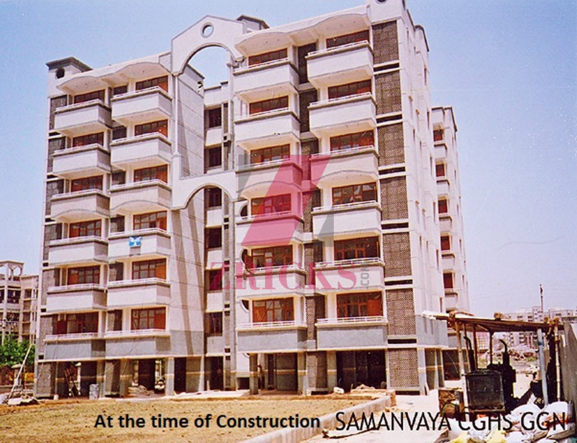
At the time of Construction SAMANVAYA CGHS GCN