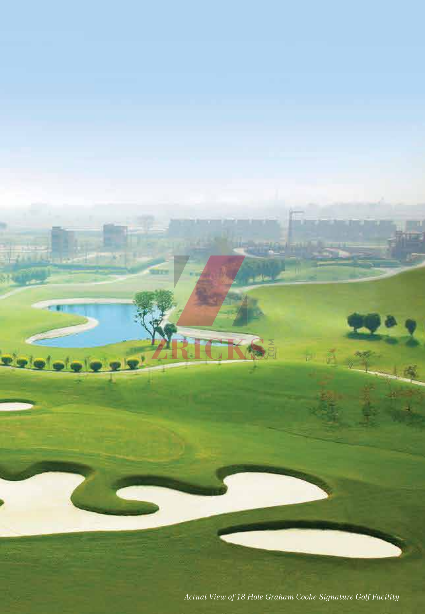
Actual View of 18 Hole Graham Cooke Signature Golf Facility