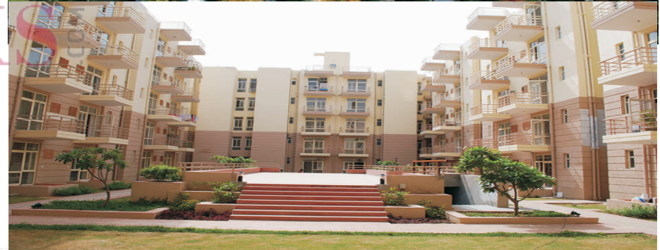
Genesis Gardenia, Bhiwadi