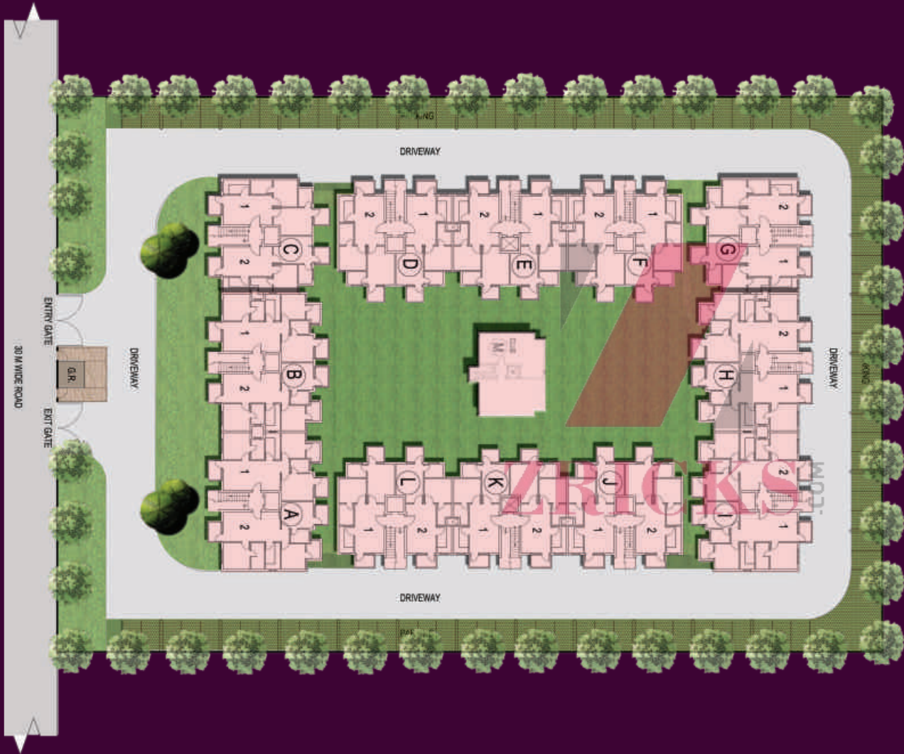
S I T E P L A N