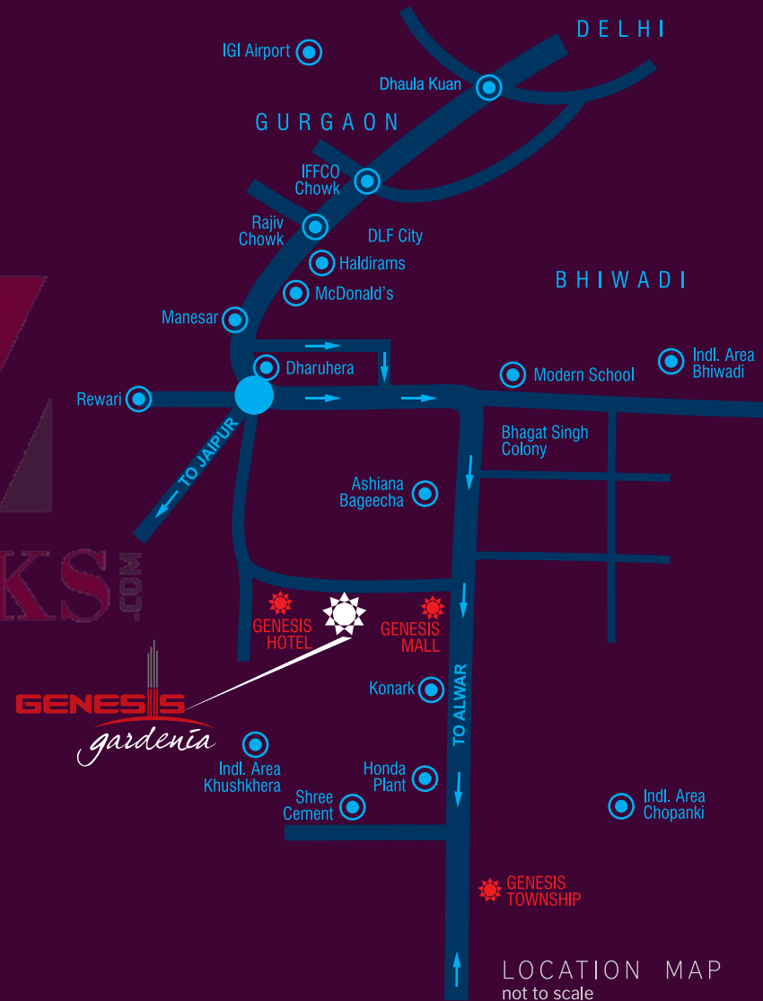
LOCATION MAP not to scale