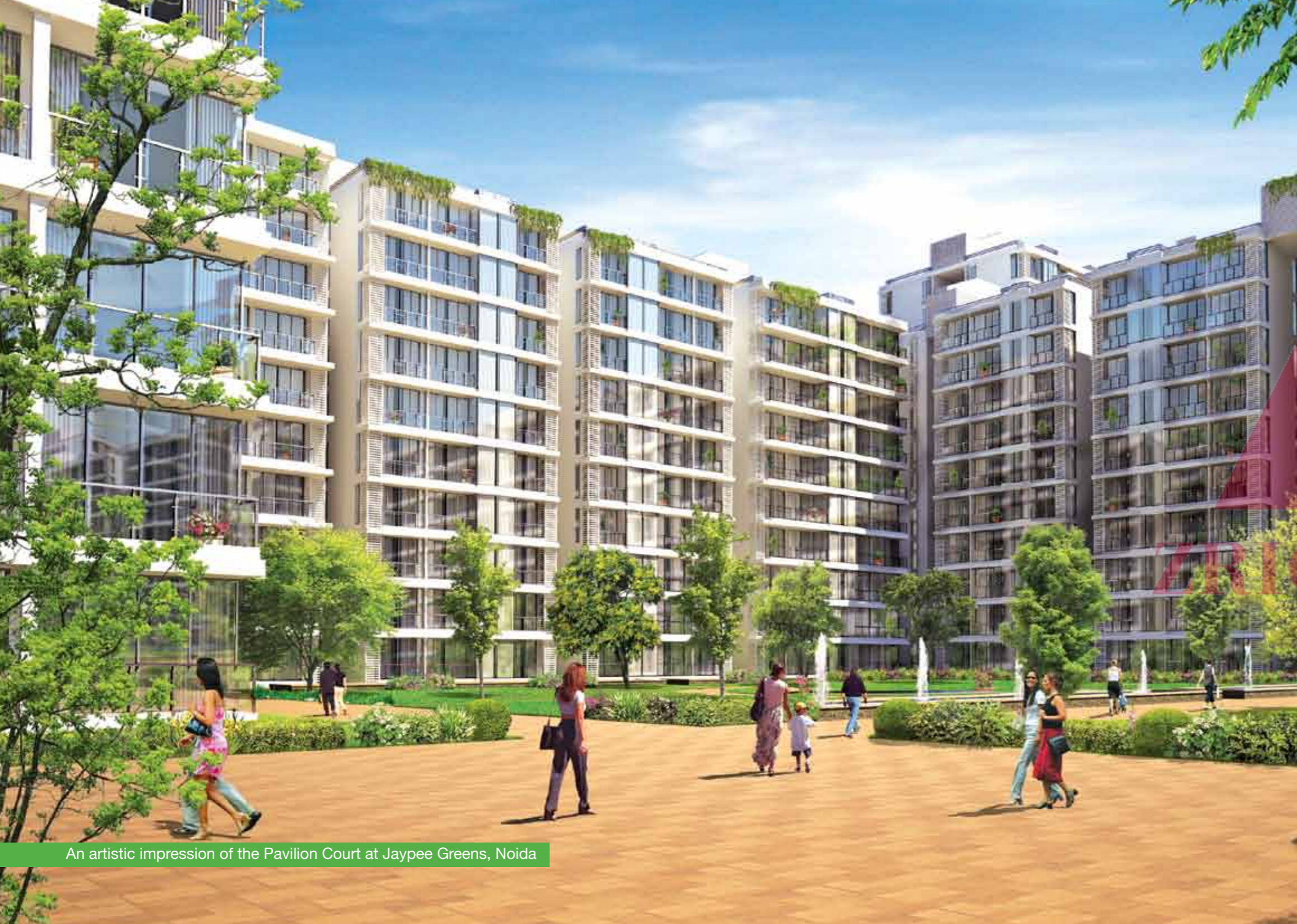
An artistic impression of the Pavilion Court at Jaypee Greens, Noida