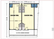
Ground Floor Plan 1207.24 sq. ft. approx.