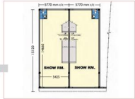
First Floor Plan 1207.23 sq. ft. approx.