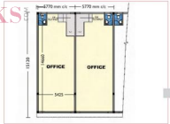
Second Floor Plan 1207.25 sq. ft. approx.