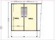
Basement Floor Plan 701.47 sq. ft. approx.